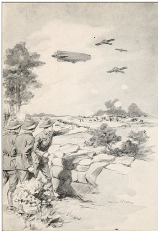
The long roll of rifle firing in volleys, and the faint cheers of charging men.— Page 178.