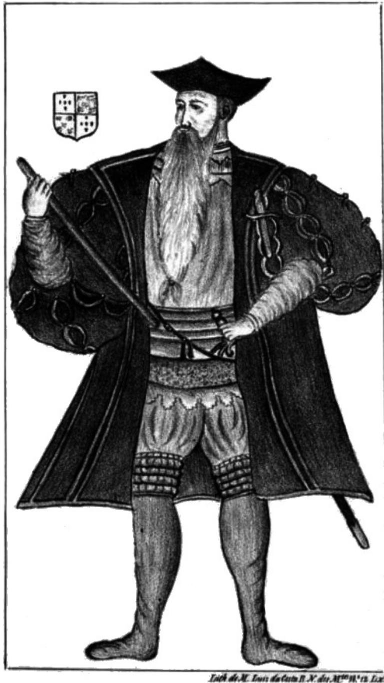
Governador Affonso de Albuquerque.

O Governador Affonso de Albuquerque, o Grande Heroe da Azia succedeo como Governador em 18 de Novembro, de 1509 ao V. R. D. Francisco de Almeida.