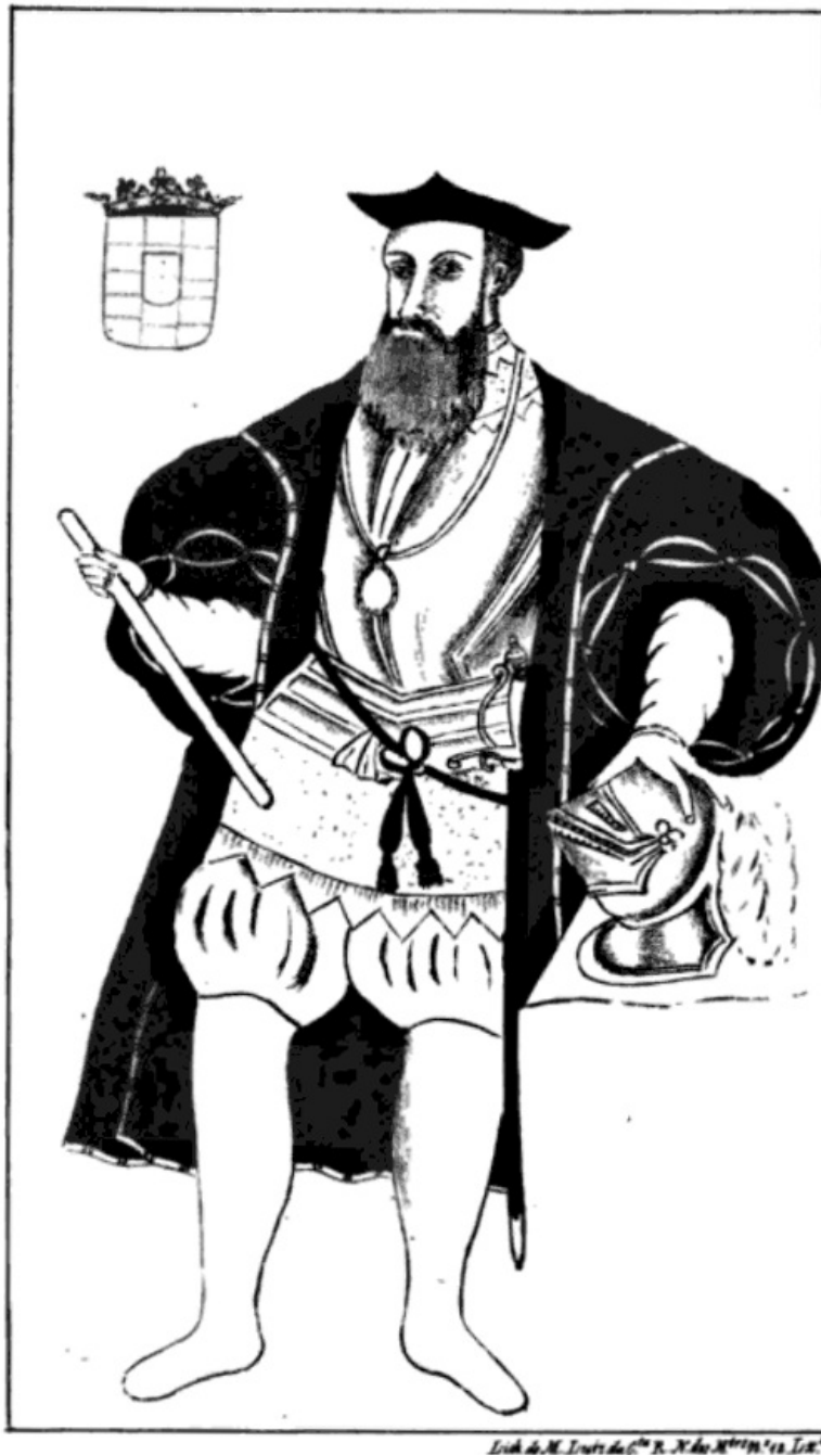
Vice-Rey D. Vasco da Gamma.

O Vice-Rei D. Vasco da Gama, Conde Almirante dos mares da India, succedeo ao Governador D. Duarte de Menezes no anno de 1524.—