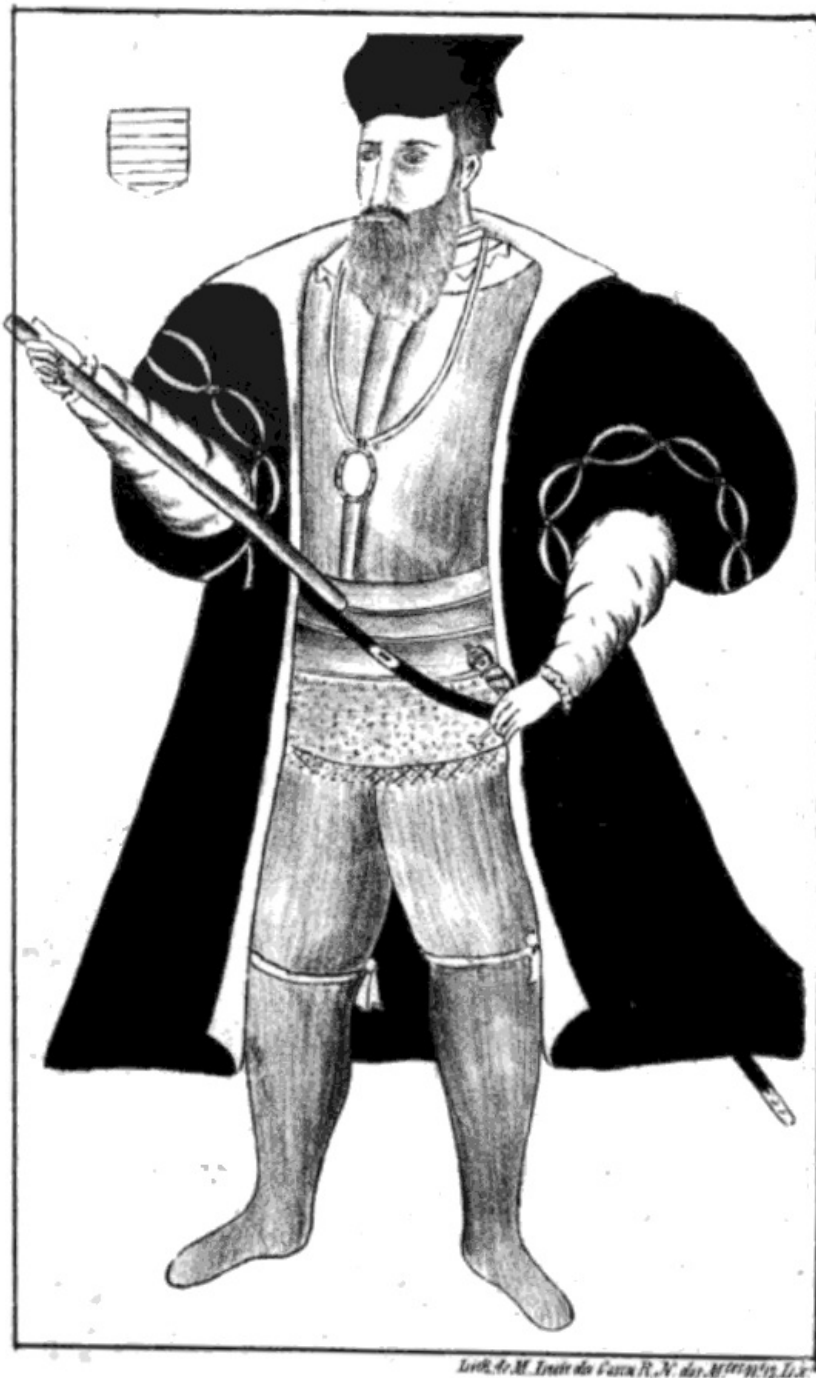
Governador Lopo Soares de Albergaria.

O Governador Lopo Soares de Albergaria succedeo ao Governador Affonso de Albuquerque em Dezembro de 1515—Foi ao Porto Judá, e avassalou seo Rei—Forteficou Ceilão, e fez seo Rei tributario—Governou até 1518 em que voltou para Portugal.