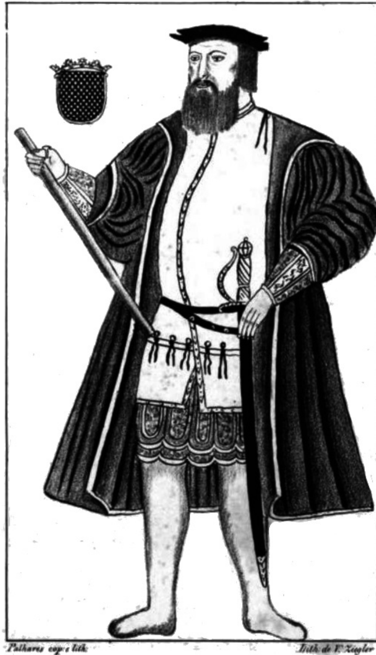
Governador Garcia de Sá.

O Governador D. Garcia de Sá sucedeu em via ao Vice-Rei D. João de Castro em 6 de Julho de 1548. Em seu tempo se fez christão, o Rei de Tanor, que veio a Goa==Governou até ao mez de Julho de 1549==Está sepultado na Igreja de Nossa Senhora do Rosario.