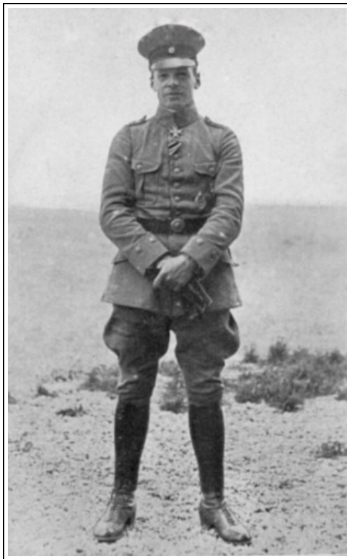
Colonel Oswald Bölcke's Last Picture