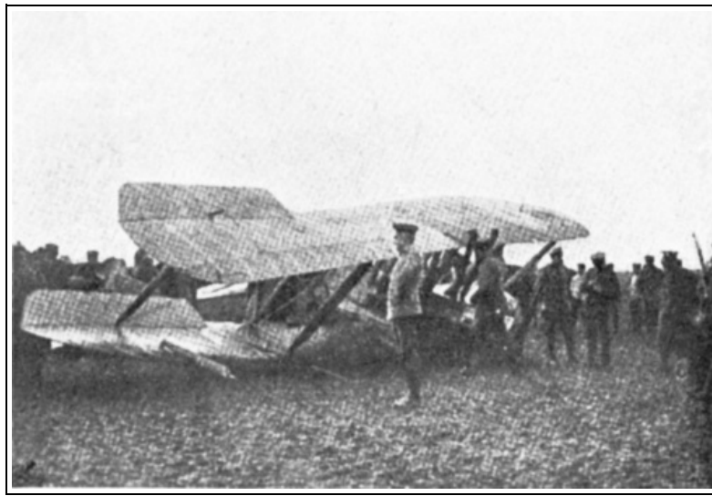
ONE OF HIS LAST VICTIMS