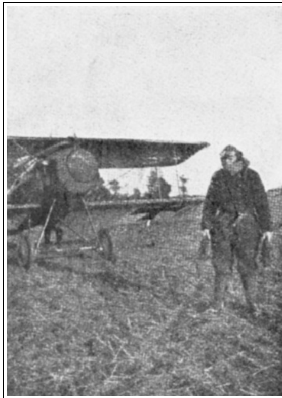
STARTING ON HIS LAST RIDE OCTOBER 28, 1916—5 P. M.