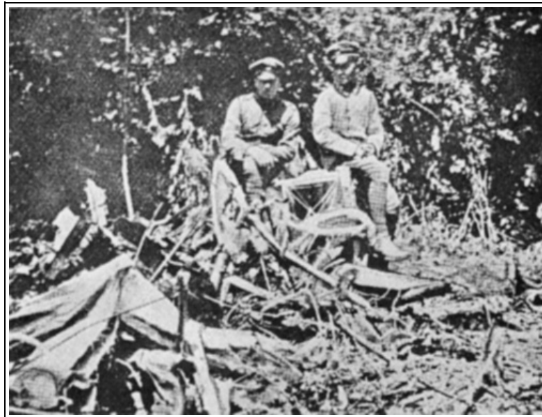
AFTER HIS FIRST VICTORY

Where I will be sent from here, I cannot say as yet. My old mobilization orders commanded me to report to a reconnoitering squadron in the first line, as commander. But these have been countermanded, and I do not know anything about my destination. I expect to get telegraphic orders to-day or to-morrow.