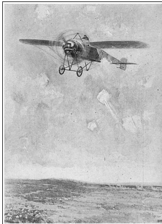
AN AVIATOR BOMBARDED WITH SHRAPNEL