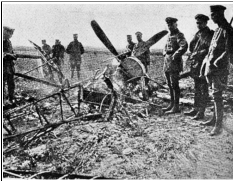
THE ENEMY'S AEROPLANE IN RUINS