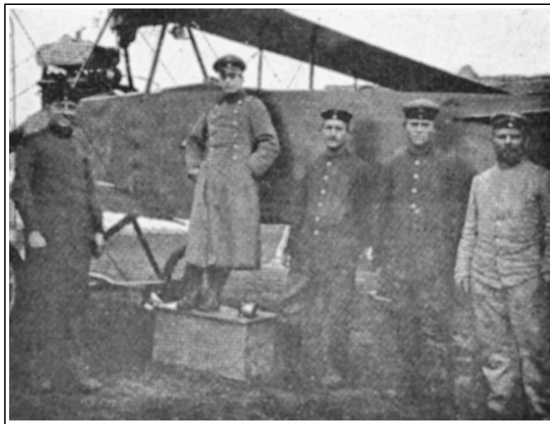
THE MASTER-FLIER AND HIS MEN