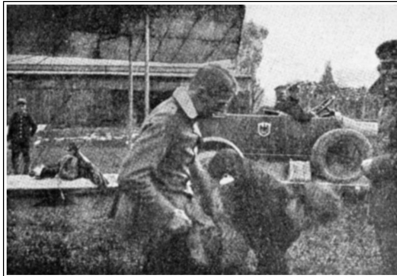
DONNING HIS FLYING-DRESS