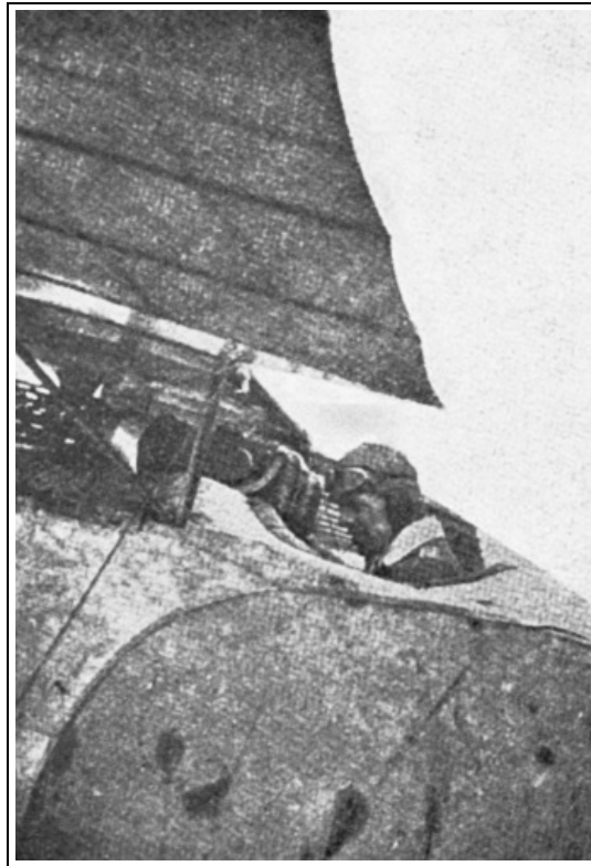
READY FOR THE START

The evening, I spent with some officers and a number of gentlemen from the German Embassy.