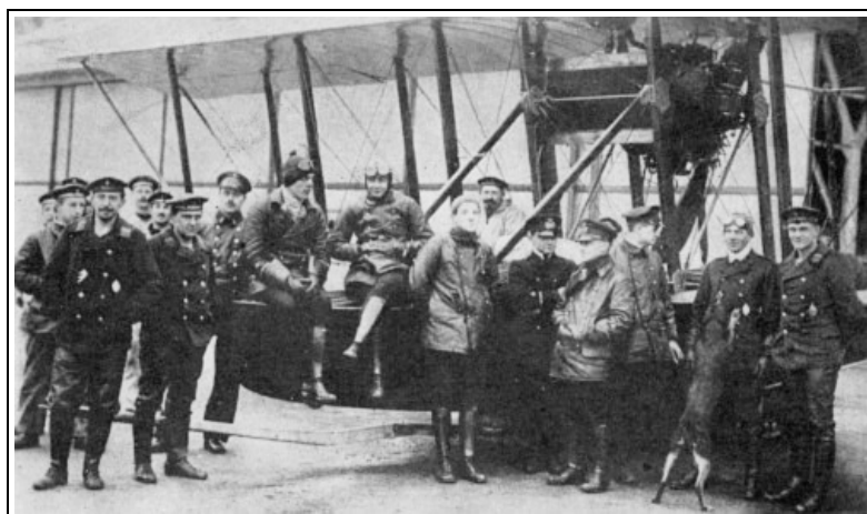
GERMAN MARINE AVIATORS ON A FIELD NEAR THE NORTH SEA

Even though this was nothing that replaced my work, it was, at least, a balm for my wounded feelings. I immediately went to S. to pack my things and use the remaining two days to fly as much as possible. I flew twice that night, because I had to utilize the time. In spite of bad weather, I had the luck to meet five Frenchmen the second time I went up. One came within range and I attacked him. He was quite low and above his own trenches, but in my present frame of mind that did not matter to me. I flew toward him, firing both guns, flew over him, turned and started to attack him again, but found him gone. It was very dark by then. When I got home I asked if anyone had seen him fall, but no one knew anything definite.