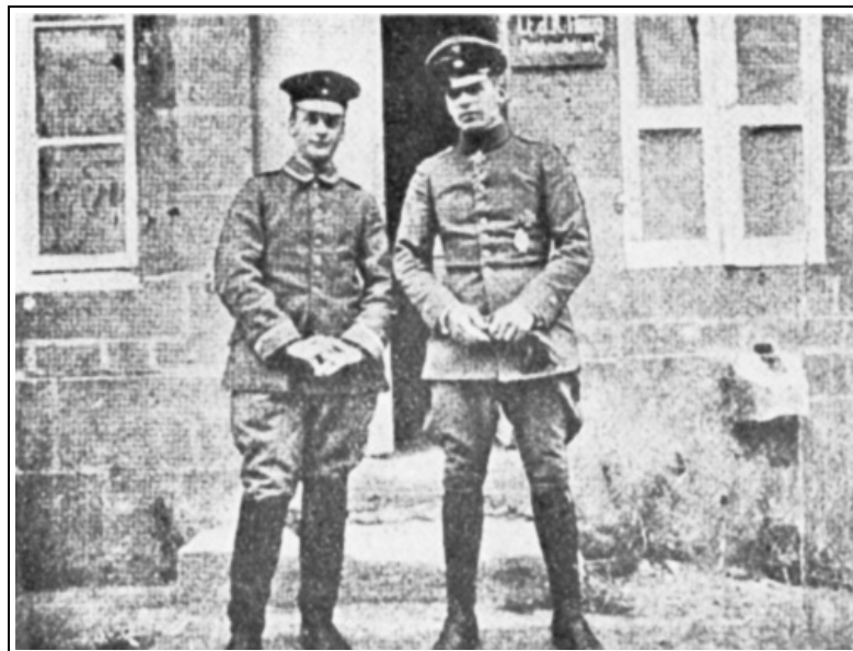
BÖLCKE AND HIS BROTHER MAX IN FRANCE (AUGUST, 1916)