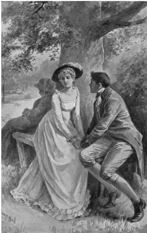
SUDDENLY HIS SLIGHT BROWN HANDS CLOSED ON HERS.

"We may all go back to the château together, madame, may we not?" said Angelot with dancing eyes, and he hurried the children on, all chattering of the wonderful corners and treasures that Henriette had shown them. [Pg 111]