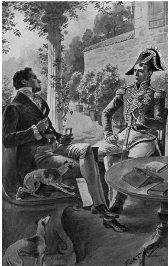
"AN ORDER FROM THE EMPEROR!" HE REPEATED.

The Prefect never smoked; his snuff-box and a book were enough for him. Monsieur de Chateaubriand's Itinéraire de Paris a Jérusalem , just published in three volumes, lay on a marble table beside him, and he was enjoying an hour of unusual peace and quietness, his only companions two little greyhounds sleeping at his feet.