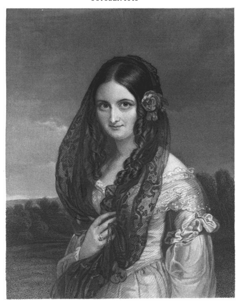
THE UNMARRIED BELLE

*** START OF THE PROJECT GUTENBERG EBOOK GRAHAM'S MAGAZINE VOL XXXIII NO. 4 OCTOBER 1848 ***