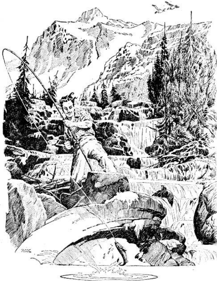
Illustrated by Krenkel

B arney Chard, thirty-seven—financier, entrepreneur, occasional blackmailer, occasional con man, and very competent in all these activities—stood on a rickety wooden lake dock, squinting against the late afternoon sun, and waiting for his current business prospect to give up the pretense of being interested in trying to catch fish.