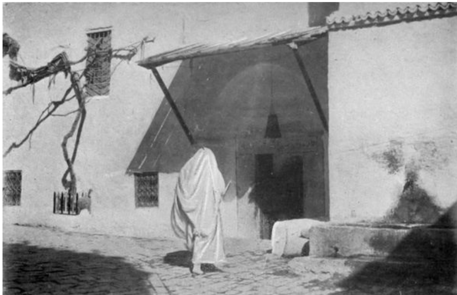
AN ARAB WOMAN ENTERING A SAINT'S TOMB (TUNIS)

Before our house stands a Zawia (saint's tomb), built in honor of a female saint, and at this tomb one day stood an Arab woman, knocking gently at the door and crying in piteous tones, "O lady! Heal me, for I am very ill! I have giddiness in my head! I am very weak! Do heal me!" The poor creature calling in her ignorance on a dead saint not only moves the heart to pity but also creates in the mind a wonder as to who these saints may be, and what has led to their being thus honored.