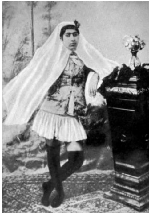
INDOOR DRESS (Northern Persia)

When one first comes to a Moslem country, a sentiment of profound pity for the women predominates; but as it is evident that half the population cannot be kept in an unnatural and degraded condition, without entailing disastrous consequences on the other half, one begins to feel equal sympathy for the men, who suffer under the disadvantage of having no true family life, and indeed of being unable to form a conception of what it is.