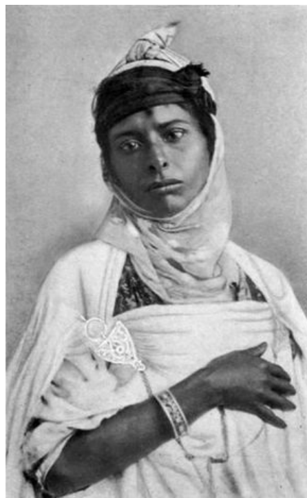
A CRY OF DISTRESS FROM ALGIERS

This might be done by older workers and we earnestly urge that women's missionary boards and societies should be willing to receive women for this department older than they can take for school or medical work. The language is learnt through constant intercourse with the women. If older women who could meet their own expenses might be allowed to give themselves solely to this evangelistic work, we believe that a large increase would be made to our missionary force.