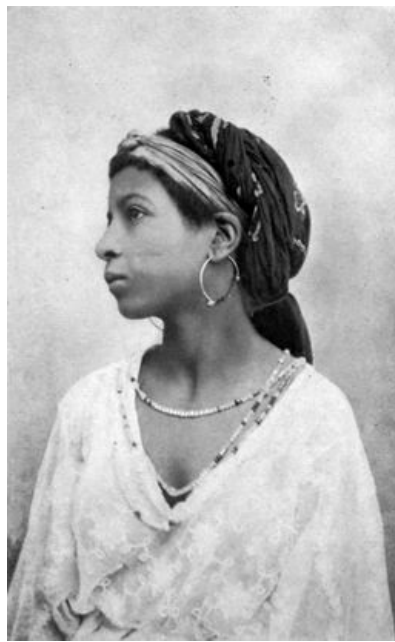
A YOUNG GIRL OF THE ABU SAAD TRIBE

And if this budding and blossoming can come with the poor watering of human love, what could it be with the heavenly showers, in their miracle-power of drawing out all that there is in the earth that they visit. Oh the capacities that are there! The soil is "only dry."