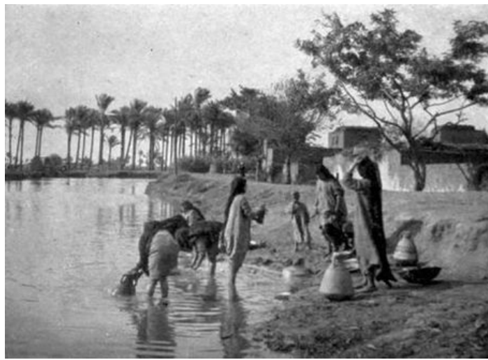
BY THE BANKS OF THE NILE

Again, perchance, he sees the "fellahah" carrying her water jar with ease and grace along some rough uneven track; or, may be, in company with others bearing with agility and strength loads of mud and brick to the builders, measuring her steps and actions to the music of some native chant; and he is impressed with the idea of her bright existence and her powers of perfect enjoyment.