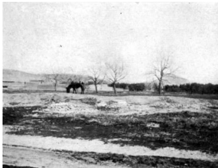
A MOSLEM CEMETERY