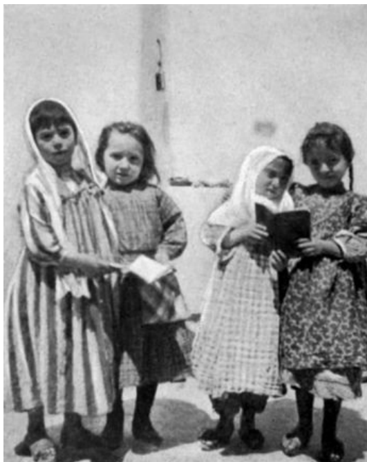
MOSLEM AND CHRISTIAN GIRLS READING TOGETHER

The following are the words of another writer: