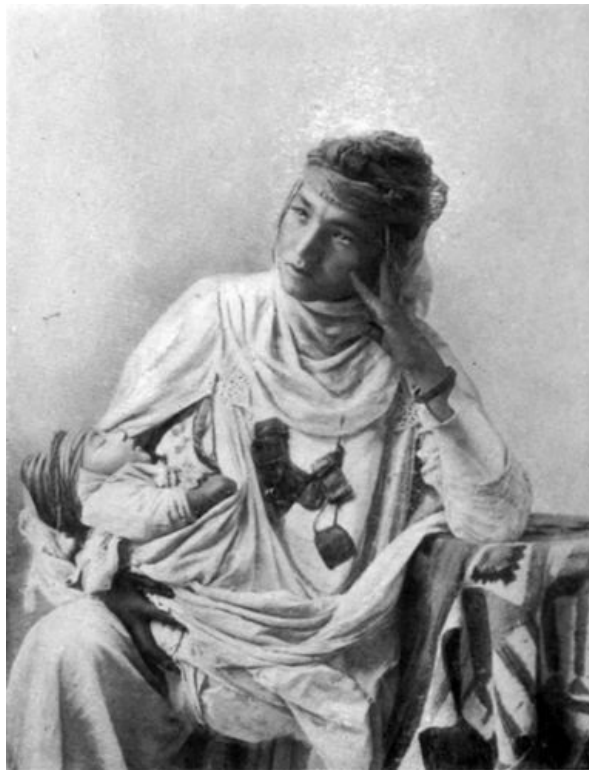
A MOTHER AND HER DAUGHTER FROM TUNIS

New York: 158 Fifth Avenue Chicago: 80 Wabash Avenue Toronto: 25 Richmond St., W. London: 21 Paternoster Square Edinburgh: 100 Princes Street