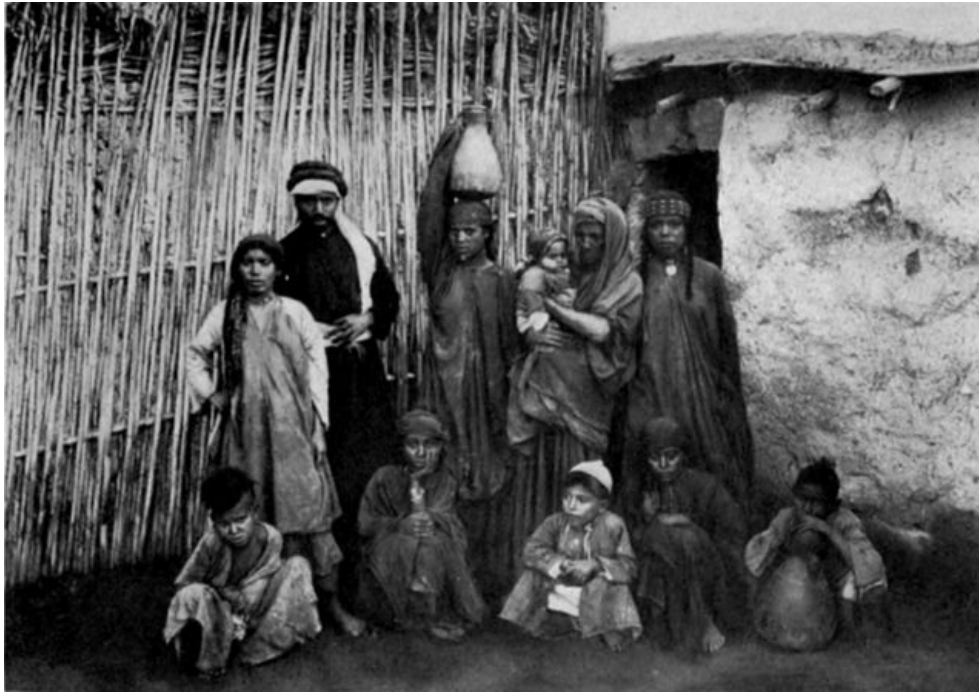
A FAMILY GROUP AT JERICHO

they are shrouded in their long "covers" or cloaks, with faces veiled, and that the cemetery is not a cheerful place, to say the least, and that it is the only place where they are allowed to go, this so-called "freedom" does not seem to be so very wonderful, after all. However, it is far better than being shut indoors all the time.