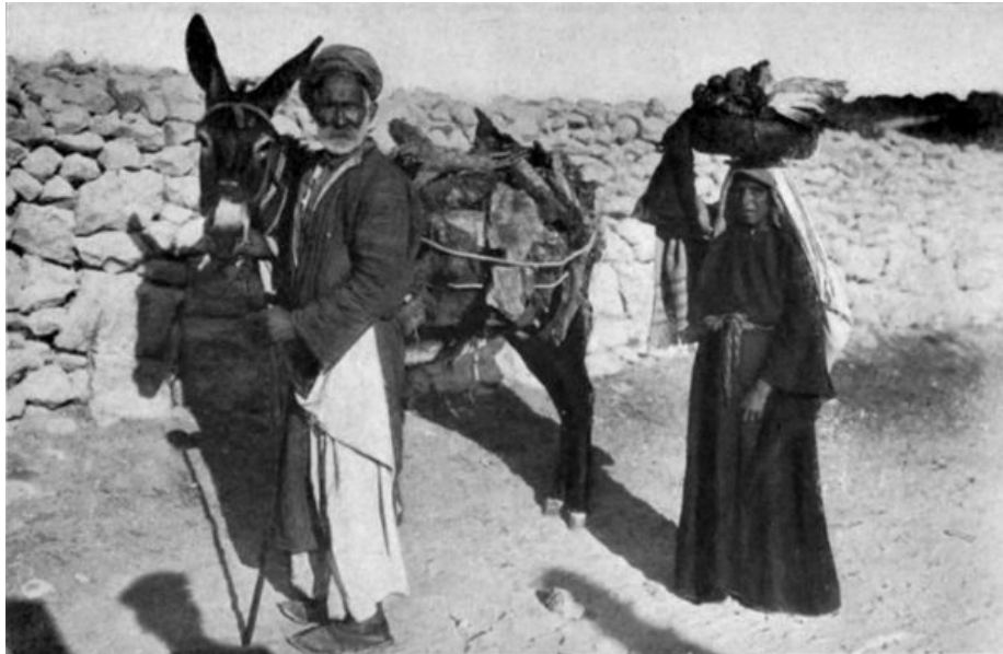
GOING TO MARKET. TWO BURDEN BEARERS.

They are tidy, industrious, and lively, and, to any one who did not understand their language, these women would give the impression of a charming picture and of many things good and true. But to one who could hear the conversation, as I often have, the secret of the utter depravity of all the people is soon learned, and one sees how it is that none grow up with any idea of purity. The minds of even young children are vitiated from the earliest age.