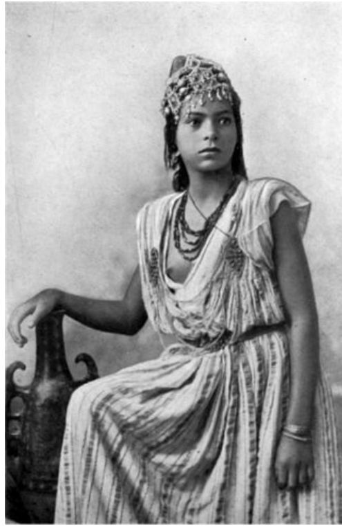
A Bedouin Girl from North Africa

conscious of losing a friend and helper. She took with her a Gospel and was followed by our prayers.