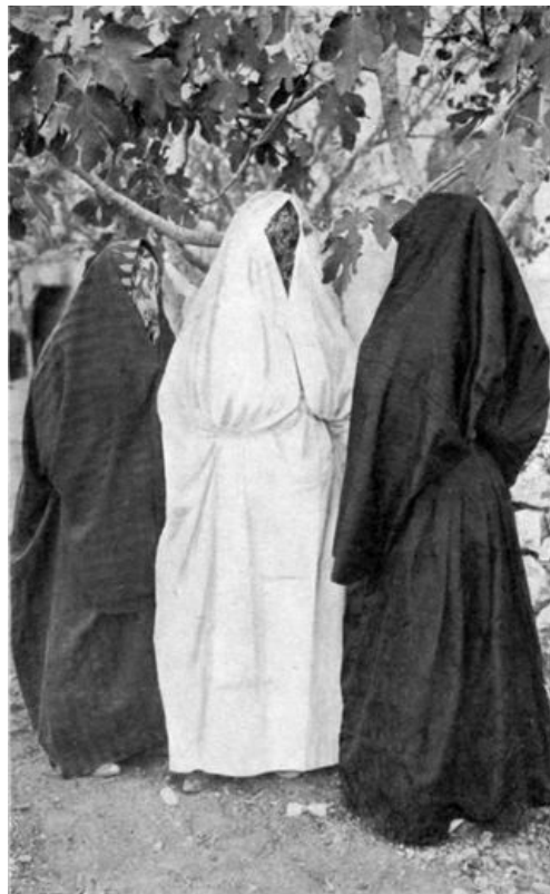
MOSLEM WOMEN OF THE BETTER CLASS IN STREET DRESS (Syria)

At meal times girls take the last place and must be content with what others leave for them. When on holidays or on other occasions boys get presents, the girls go away empty-handed. Even for boy's dress more is spent than for that of the girls.