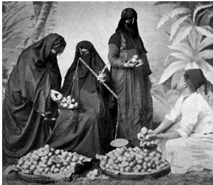
BARGAINS IN ORANGES