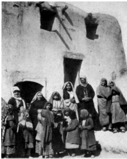
A VILLAGE SCHOOL IN SYRIA