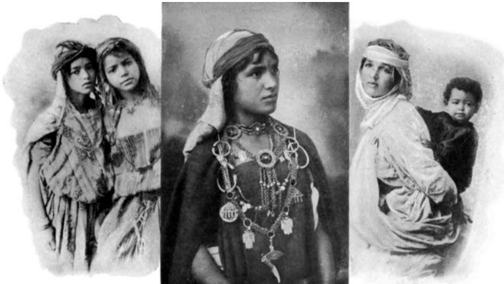
TYPES IN TUNIS AND ALGIERS

Dry soil, NOT dead soil. If you were out here in Algiers and could see and know the people, you would say so too. The next best thing is to bring you some of their faces to look at that you may judge whether the possibilities have gone out of them yet or not: women faces and girl faces, for it is of these that I write. Will you spend five minutes of your hours to-day in looking—just looking—at them, till they have sunk down into your heart? ARE they the faces of a dead people? Do you see no material for Christ if they had a chance of the Water of Life? These are real living women, living to-day, unmet by Him.