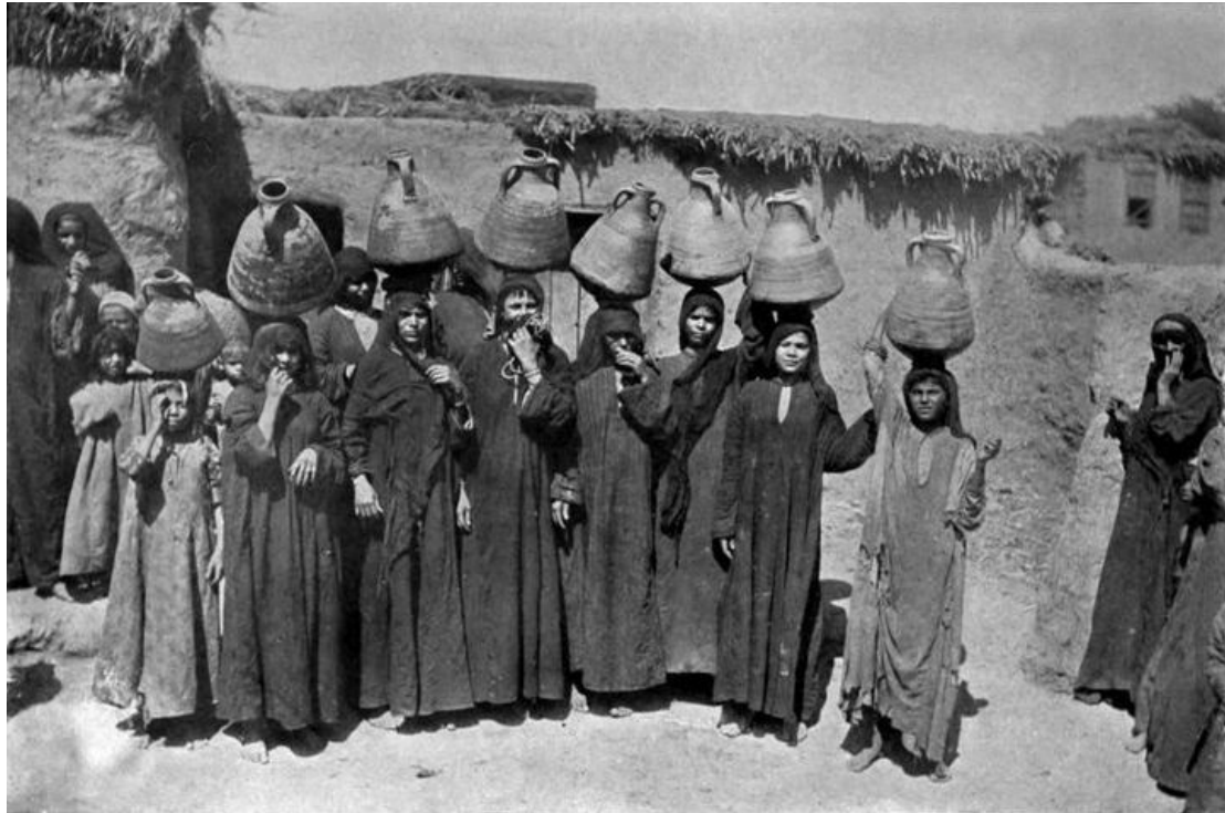
DAUGHTERS OF EGYPT