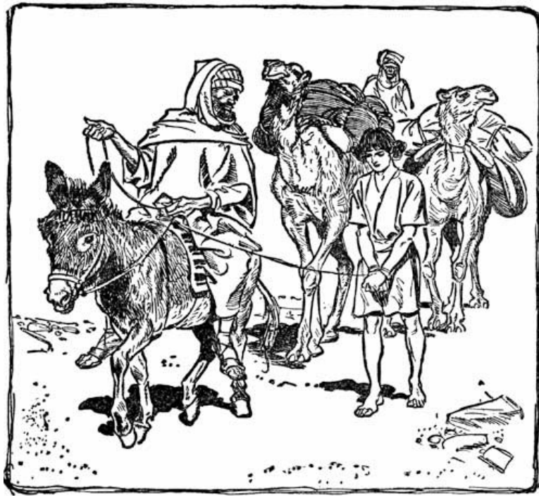
He was tied to the saddle of the man who had bought him.

It might perhaps have seemed better just then for Joseph if he had been dead instead of being carried away into slavery. It was a terrible fate, and he might well have become sullen and hopeless in the strange land of Egypt to which the merchantmen took him.