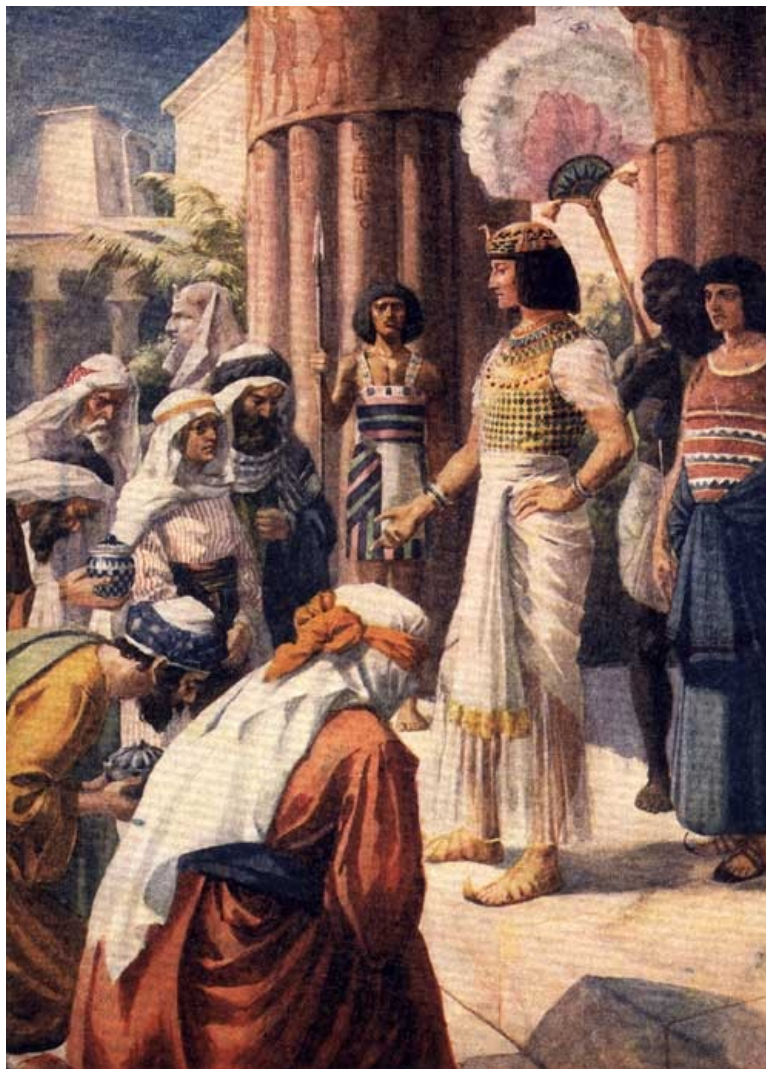
Joseph as Ruler of Egypt speaks to his brothers.