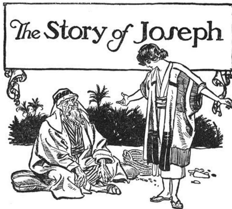
The coat of many colours.