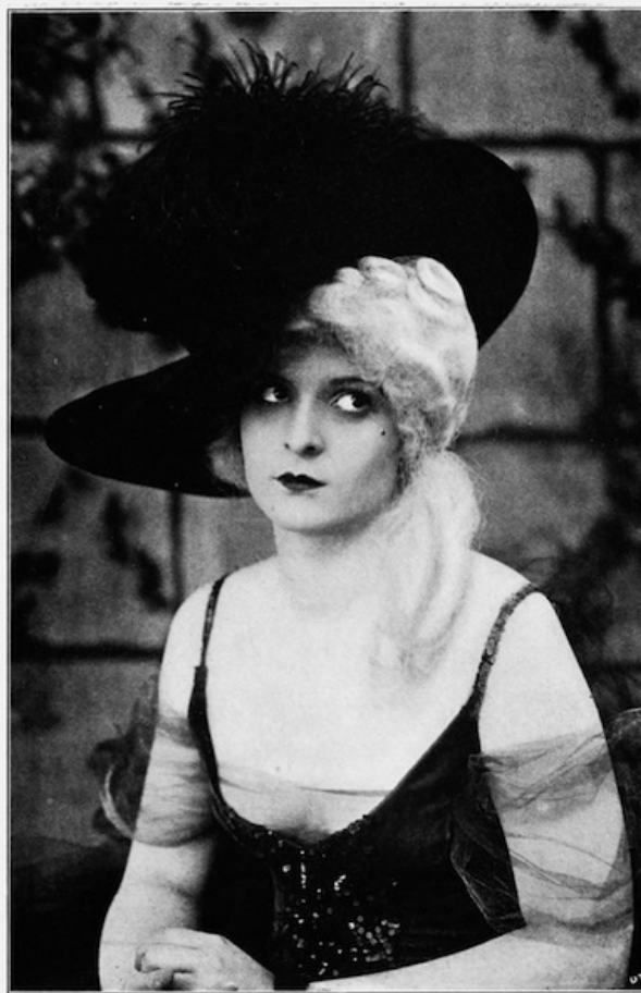
ONE OF THE BEAUTIES OF THE GARDEN FETE OF BEL-AIR.

"Who would not be frightened at the idea of being led off amid insults and jeers--condemned to a two months' voyage in the vilest company--and at the end of it be landed in a wild country to face the alternatives of slavery or a runaway into the savage swamps?"