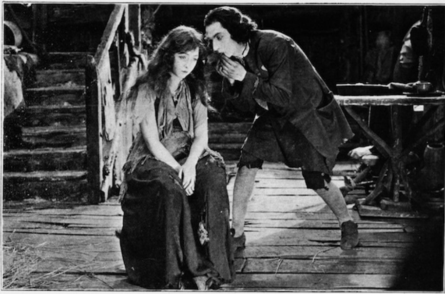
PIERRE BECOMES THE DEVOTED WORSHIPPER OF LOUISE WHOM HE HAS SAVED FROM THE RIVER

Danton--"the huge, brawny figure, through whose black brows and rude flattened face there looks a waste energy as of Hercules not yet furibund."