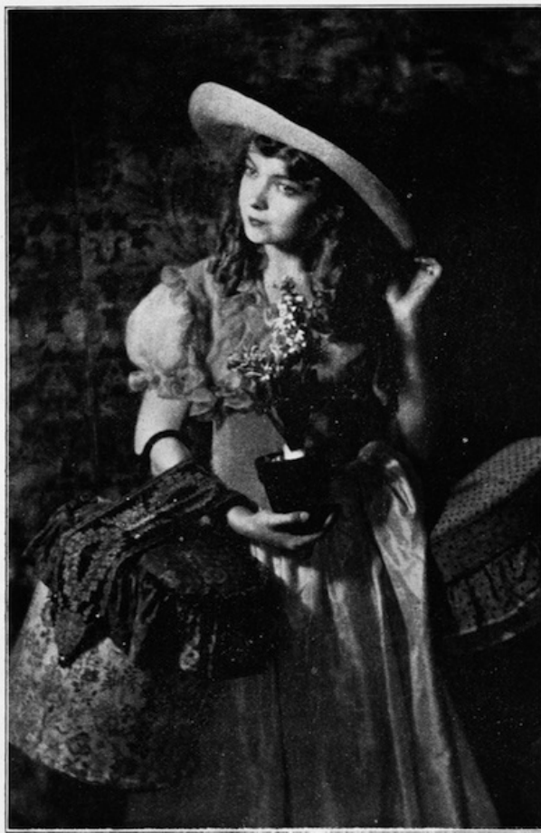
THE MARQUIS DE PRAILLE IS ENRAPPED BY THE LITTLE VISION FROM THE STAGE COACH (HENRIETTE PLAYED BY LILLIAN GISH.)

It was in one of his frequent talks at the simple lodgings to which he had conducted her the night of Bel-Air. Swiftly they had retraced the steps of the stricken Louise even to the pier edge over the darkling Seine. Horrified and trembling, Henriette feared the worst.