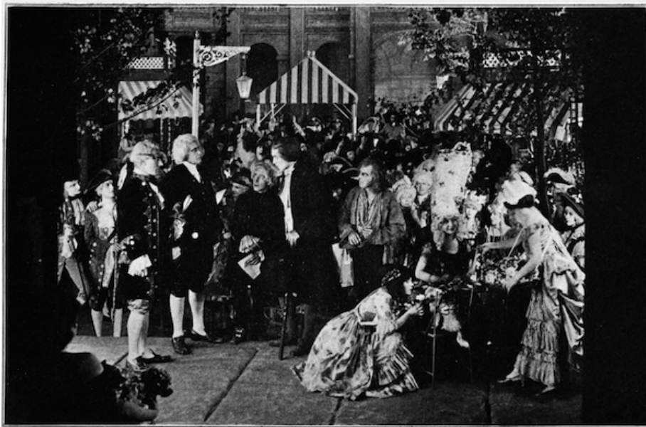
DANTON WELCOMES LAFAYETTE AND JEFFERSON, THE REPRESENTATIVES OF AMERICA'S NEW-WON FREEDOM.

"Friends, shall we die like hunted hares? Us, meseems, only one cry befits: To arms! Let universal Paris, universal France, as with the throat of the whirlwind, resound: To arms! Friends (continues Camille) some rallying sign! Cockades, green one; the color of hope!' As with the flight of locusts, these green leaves; green ribands from the neighboring shops; all green things are snatched and made cockades of.... And now to Curtius' image shop there; to the boulevards; to the four winds, and rest not until France be on fire!"