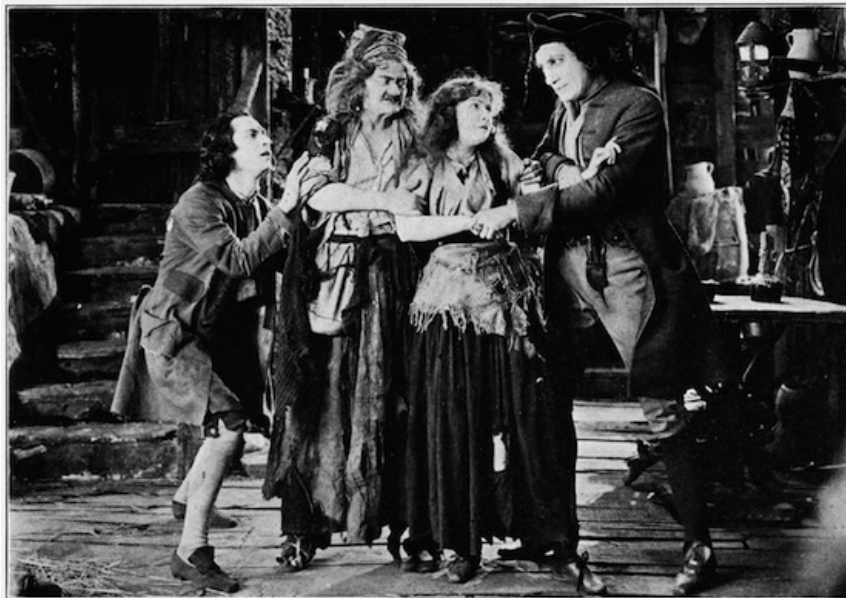
LOUISE AND LA FROCHARD TRYING TO KEEP PIERRE, THE CRIPPLE, FROM FIGHTING HIS BROTHER JACQUES.

Another misfit of the grotesque crowds was Picard, foolishly trying to discover what 'twas all about, gazing soulful-eyed into hoodlum "mugs" that gave him the merry "ha! ha!" or sickened him with the likeness of the First Murderer. But "crime," in one instance at least, was followed by "punishment," for as the murderous citizen suddenly thrust out his roaring raucous mouth, Picard inadvertently leaned back.