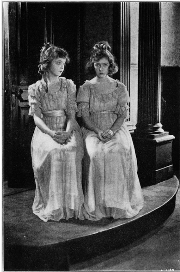
LILLIAN AND DOROTHY GISH AS THE TWO ORPHANS IN D. W. GRIFFITH'S ORPHANS OF THE STORM. Frontispiece.