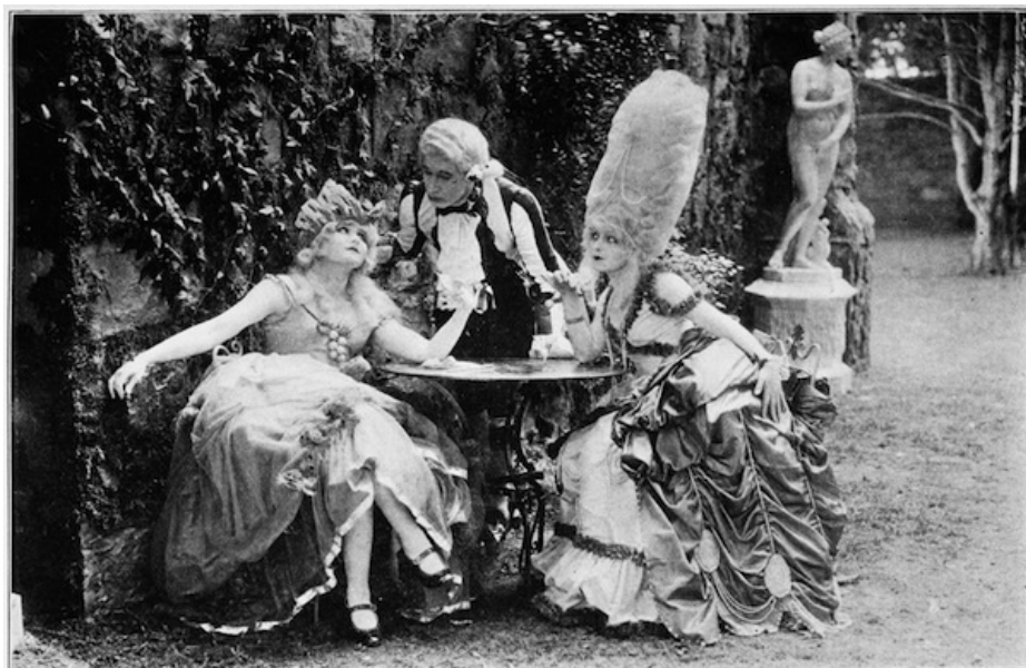
MARQUIS DE PRAILLE PLYING HIS ART WITH THE LADIES.

"No, Madame, I am blind," was the low, sad answer.