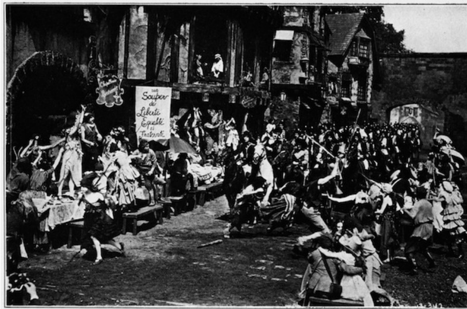
DANTON AND MEN RIDE TO THE RESCUE PAST THE CORRUPT AND DEGENERATE ORGY OF THE "FEAST OF REASON."

Alarmed at the swiftly changing tide, the Chief Judge sought the Dictator's eye. The orator's eyes were far away, his frame was convulsed by emotion as he cried: "My very life--everything--I owe to one of these victims!" The mob identified its cause with Danton's, submerged their personalities with his own!