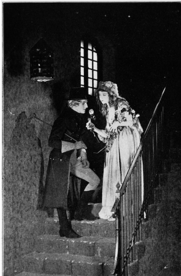
LOVE, MASTER OF HEARTS.