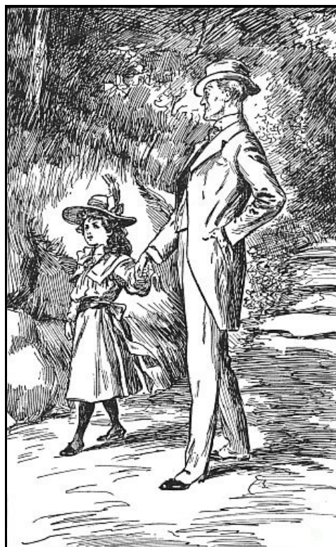
"Shall I find mother for you?" asked Sibyl, leading Lord Grayleigh across the lawn.—

Lord Grayleigh made no answer, unless an uneasy movement of his feet signified a sense of discomfort. The carriage drew up at the porch and he alighted. Sibyl skipped out after him.