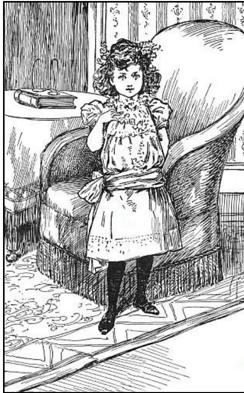
DADDY'S GIRL. Frontispiece.