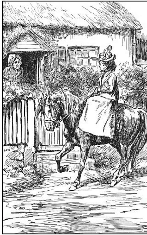
An old woman wearing a bedgown, and with a cap with a large frill, appeared in the porch of the tiny cottage.—Page 224. Daddy's Girl.

“Oh, don’t I,” answered Mrs. Scott. “It’s a pity you can’t come in, Missy. There, Danny, keep quiet; the little lady ain’t no time to be a-visiting of you. That’s him calling out, Missy; you wait a minute, and I’ll find out what he wants.” [Pg 225]