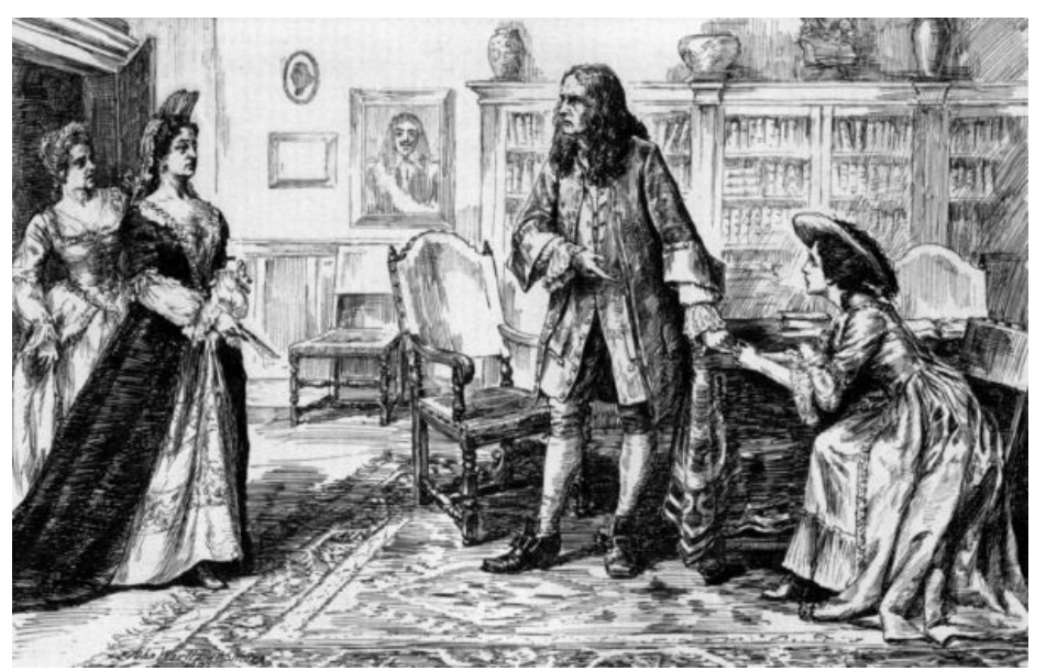
ROXANA IS CONFRONTED WITH HER DAUGHTER "Pray, madam," says he, "do you know this young woman?"

After this she told my lord everything she knew of me, even in the character of Roxana, and described my dress so well, that he knew it to be mine.