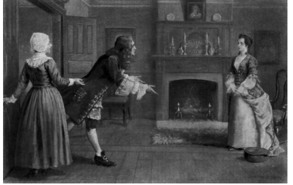
THE DUTCH MERCHANT CALLS ON ROXANA "There," says she (ushering him in), "is the person who, I suppose, thou inquirest for"