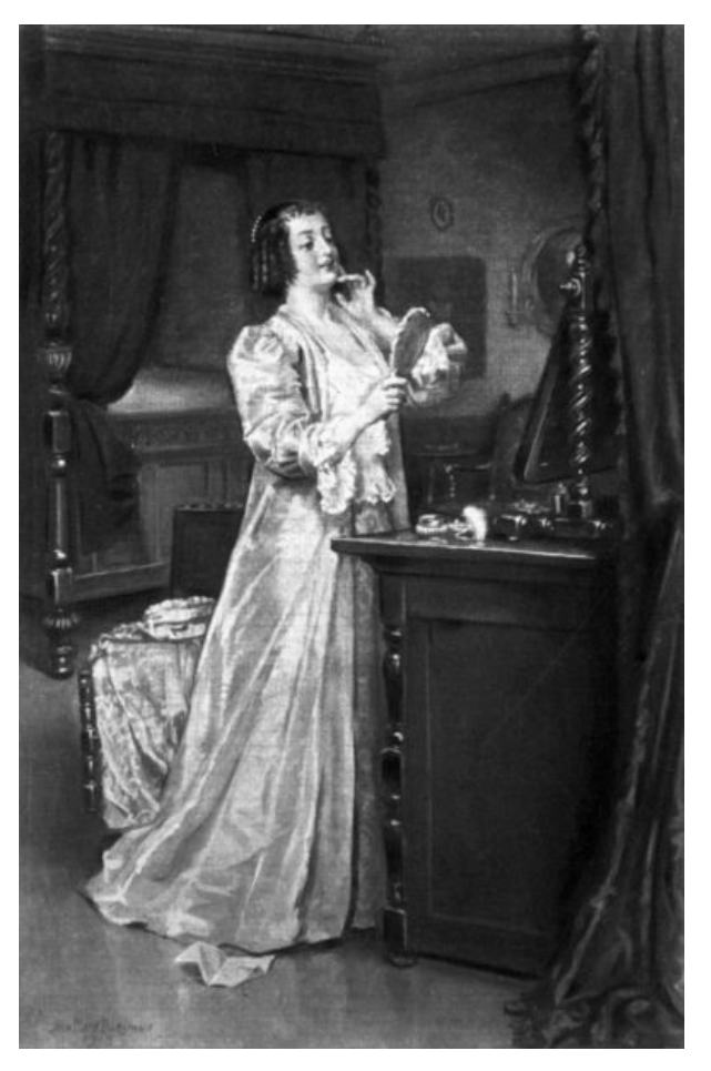
ROXANA I was rich, beautiful, and agreeable, and not yet old

*** START OF THE PROJECT GUTENBERG EBOOK THE FORTUNATE MISTRESS (PARTS 1 AND 2) ***