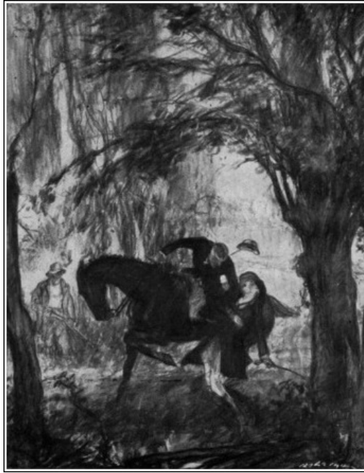
He tried to swing her to the pommel, but she fought herself free and came to the ground and was almost trampled.