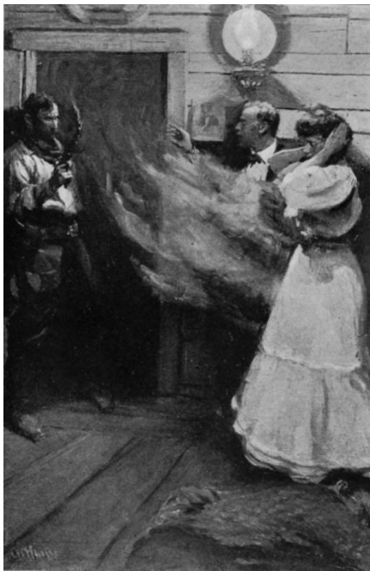
"AND DOWN HART WENT IN A HEAP ON THE FLOOR"

The whole place, of course, right away broke into yells and cusses, and everybody come a-crowding into a heap--some of the boys picking up Hart and carrying him, kicking feeble real natural, out into the kitchen; and some more grabbing a-hold of Shorty and taking away his gun. Kerosene let off howls fit to blow the roof off--only quieting down long enough to say she'd just agreed to take Hart for her second, and it was hard luck to be made a widow of twice in one day. Then she howled more. Really, things did go with a hum!