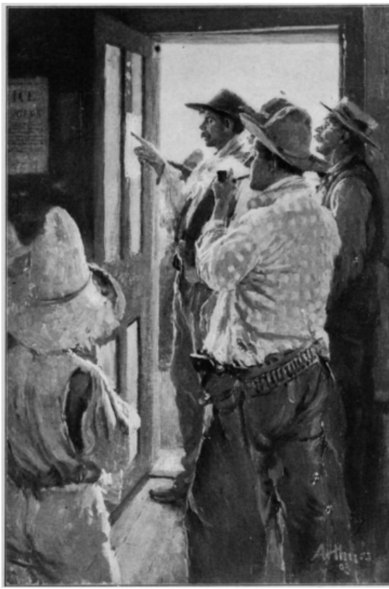
“WROTE OUT A NOTICE THAT WAS TACKED UP ON THE DEEPO DOOR”

“You’ve come out well once as the Baptist minister, Charley,” the Hen said, shaking all over; “and I reckon you can do it again--only it won’t be so easy showing off the new church and the parsonage by daylight as it was in the dark. About us girls laying low, maybe you’re right and maybe you’re not right. Anyway, don’t you worry about us. All I’ll say is, it won’t be the ladies in this combine that’ll give anything away!” And she and the other girls got so to laughing over it they all of ’em had to set down.