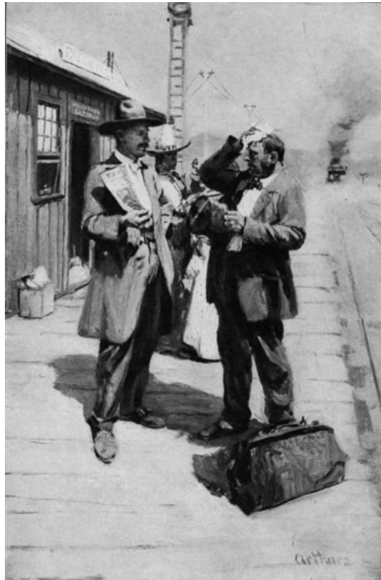
"IT'S HOTTER THAN SAHARA!' SAID THE ENGLISHMAN"

Charley bowed handsome--there was no ketching off Santa Fé when it come to slinging good manners, his being that gentlemanly he could a-give points to a New York bar-keep--and says back: "Sir, I beg yours! Heedlessness is my besetting sin. The fault is mine!" And then he said, keeping on talking the toney way he knowed how to: "I trust, sir, that you are not incommoded by the heat. Even for New Mexico in August, this is a phenomenally hot day."