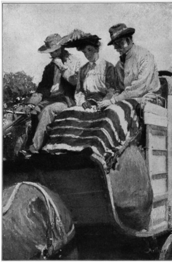
"HER LEFT HAND WAS LAYING IN HER LAP, AND THE OLD GENT GOT A-HOLD OF IT"

Her left hand was laying in her lap, sort of casual, and the old gent got a-hold of it and said he didn't know how to tell her how sorry he was for her. Talking from behind her pocket-handkerchief, she said such sympathy was precious; and then she went on, kind of pitiful, saying she s'posed her little Willy'd have forgot all about her before she'd get back to him--and she cried some more. Hill said she done it so well he was half took in himself for a minute, and felt so bad he went to licking and swearing at his mules.