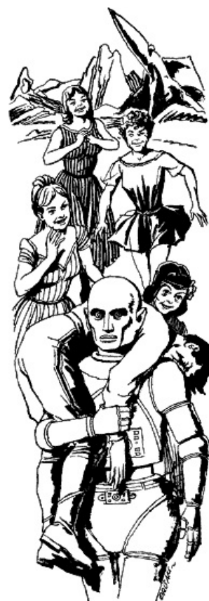
Illustrated by Paul Orban

"Do you suppose we'll ever escape from this best of all possible manless worlds?" asked Betsy,