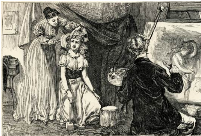
Mrs. Dobbs Broughton piles her Fagots.

"Let us make the best of our time then," said Dalrymple; and the sitting was arranged; Miss Van Siever went down on her knees with her hammer in her hand, and the work began. Mrs. Broughton had twisted a turban round Clara's head, as she always did on these occasions, and assisted to arrange the drapery. She used to tell herself as she did so, that she was like Isaac, piling the fagots for her own sacrifice. Only Isaac had piled them in ignorance, and she piled them conscious of the sacrificial flames. And Isaac had been saved; whereas it was impossible that the catching of any ram in any thicket could save her. But, nevertheless, she arranged the drapery with all her skill, piling the fagots ever so high for her own pyre. In the meantime Conway Dalrymple painted away, thinking more of his picture than he did of one woman or of the other.