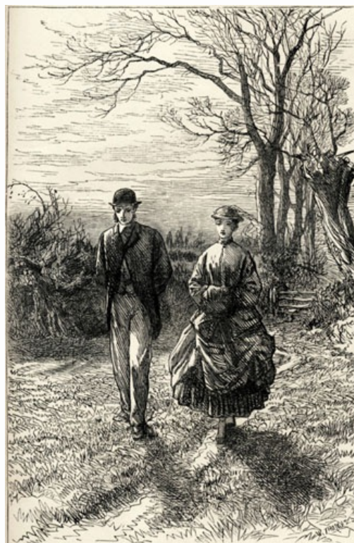
Lily wishes that they might swear to be Brother and Sister.

"It was, I think, only yesterday that I was telling Grace that you are more like a brother to me than any one else. I wish it might be so. I wish we might swear to be brother and sister. I'd do more for you than than walk across the fields with you to Guestwick Cottage. Your prosperity would then be the thing in the world for which I should be most anxious. And if you should marry—"