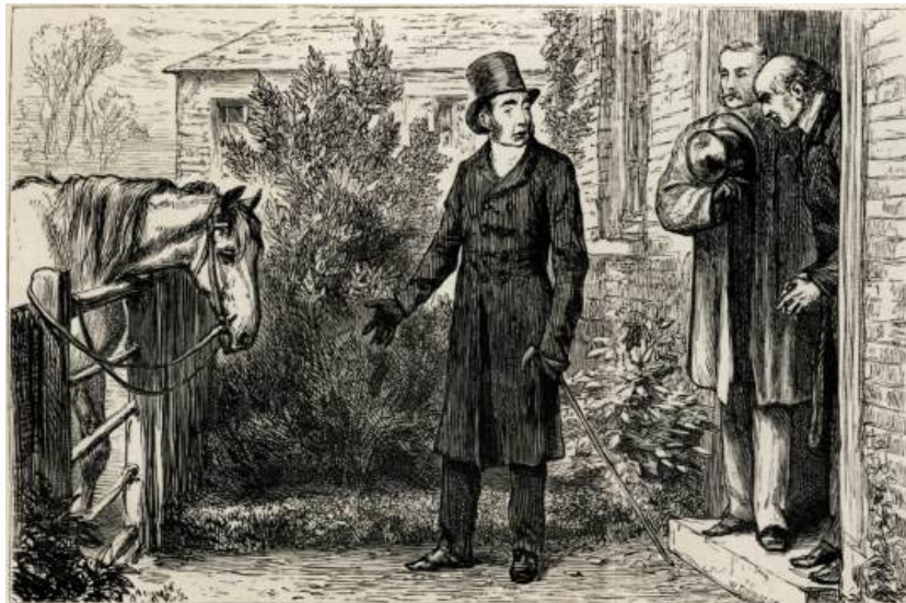
Mrs. Proudie's Emissary.

"You can surely walk, leading the beast, if you fear to mount him," said Mr. Crawley.