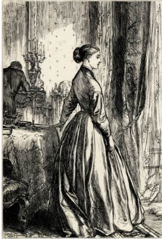
The last Denial.

best this man who was now waiting for some word of answer to his words, and she did love him dearly; she would have tended him if sick, have supplied him if in want, have mourned for him if dead, with the bitter grief of true affection;—but she could not say to herself that he should be her lord and master, the head of her house, the owner of herself, the ruler of her life. The shipwreck to which she had once come, and the fierce regrets which had thence arisen, had forced her to think too much of these things. "Lily," he said, still facing towards the mirror, "will you not come to me and speak to me?" She turned round, and stood a moment looking at him, and then, having again resolved that it could not be as he wished, she drew near to him. "Certainly I will speak to you, John. Here I am." And she came close to him.