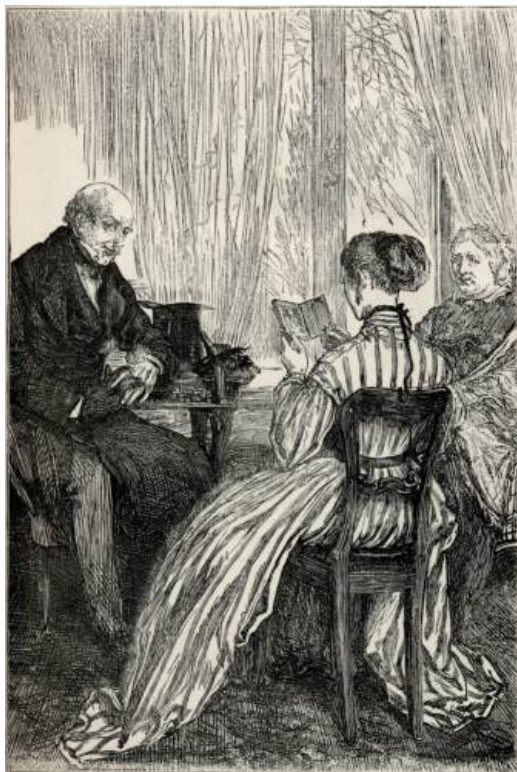
They pronounced her to be very much like a Lady.

Then the squire produced a photograph of Emily Dunstable which his nephew had sent to him, and they all pronounced her to be very pretty, to be very much like a lady, and to be very good-humoured. The squire was evidently pleased with the match, and therefore the ladies were pleased also. Bernard Dale was the heir to the estate, and his marriage was of course a matter of moment; and as on such properties as that of Allington money is always wanted, the squire may be forgiven for the great importance which he attached to the young lady's fortune. "Bernard could hardly have married prudently without any money," he said,— "unless he had chosen to wait till I am gone."