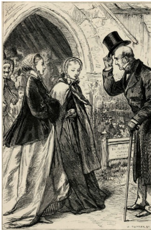
Grace Crawley is introduced to Squire Dale.