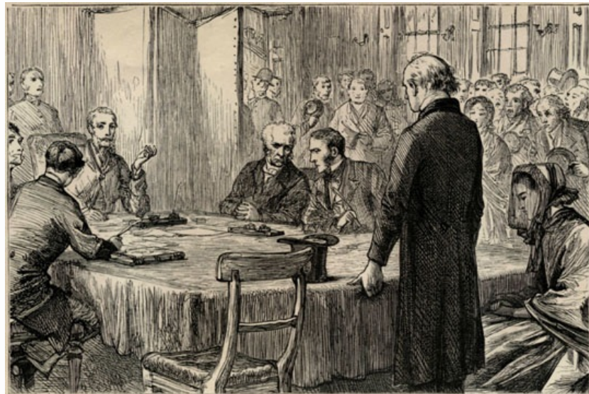
Mr. Crawley before the Magistrates.