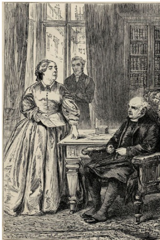
"A convicted thief," repeated Mrs. Proudie.

"A convicted thief," repeated Mrs. Proudie; and she vociferated the words in such a tone that the bishop resolved that he would for the future let the word convicted pass without notice. After all she was only using the phrase in a peculiar sense given to it by herself.