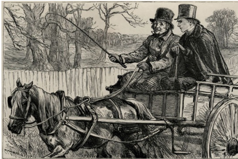
Farmer Mangle and Mr. Crawley.

On the following morning he consented to get into farmer Mangle's cart, and was driven as far as Framley Mill. "I wouldn't think nowt, your reverence, of running you over into Barchester,—that I wouldn't. The powny is so mortal good," said farmer Mangle in his foolish good-nature.