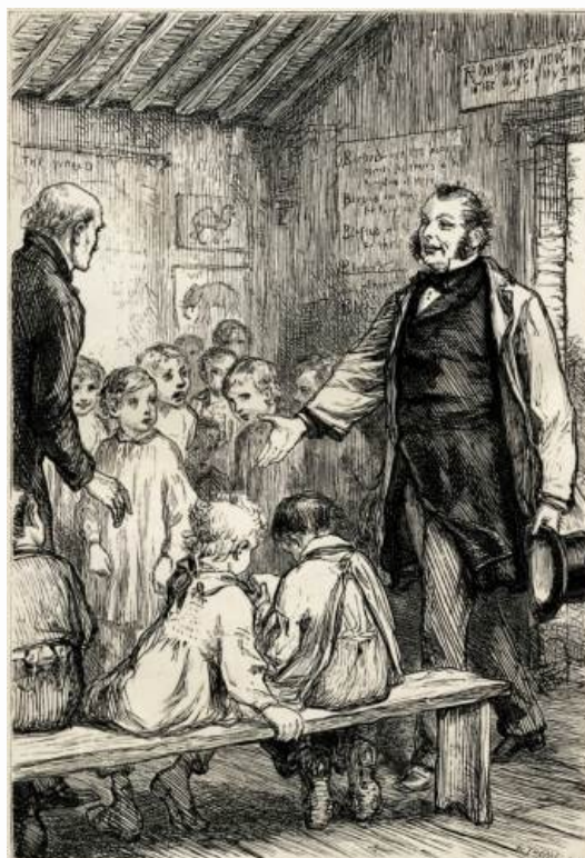
"These are the young Hogglestockians, are they?"

"Just so, my friend," said Toogood, with his hand extended, "just so; and there's another gentleman outside who wants to have a word with you also. Perhaps you won't mind stepping out. These are the young Hogglestockians; are they?"