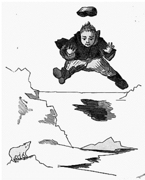
JOHN WHOPPER AT THE NORTH POLE.