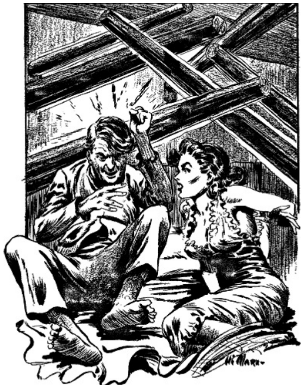
It was getting so a person couldn't sleep nights anymore.

They went in the door and faced a desk large enough to play tennis on. The man behind the desk