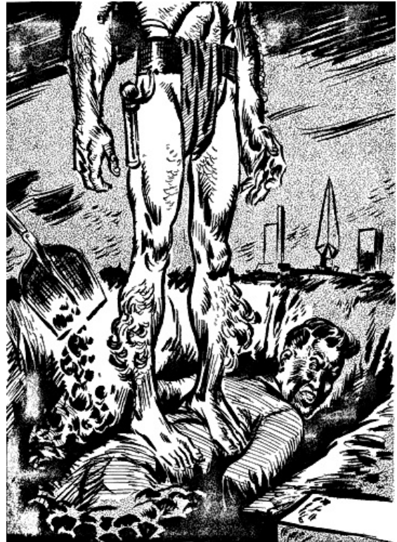
Larkin—now beyond sanity—was gibbering in the grave.

The Martians were standing around grinning at the pile of shovels lying in the fuzz-bush. The Martians seemed interested and appeared to communicate with one another in some