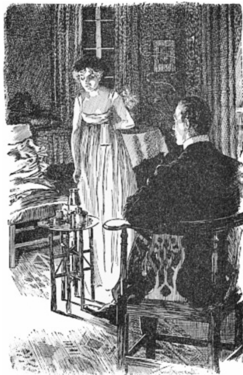
Matravers found himself wondering at this new and very natural note of domesticity in her

All the time he was talking, telling her in a few chosen sentences of the little tour for which she really was responsible—of the pink-and-white apple-blossoms of Brittany, of the peasants in their quaint and picturesque garb, and of the old time-worn churches, the exploration of which had constituted his chief interest. She listened eagerly; every word of his description, so vivid and picturesque, was interesting. When he had finished, he looked at her thoughtfully.