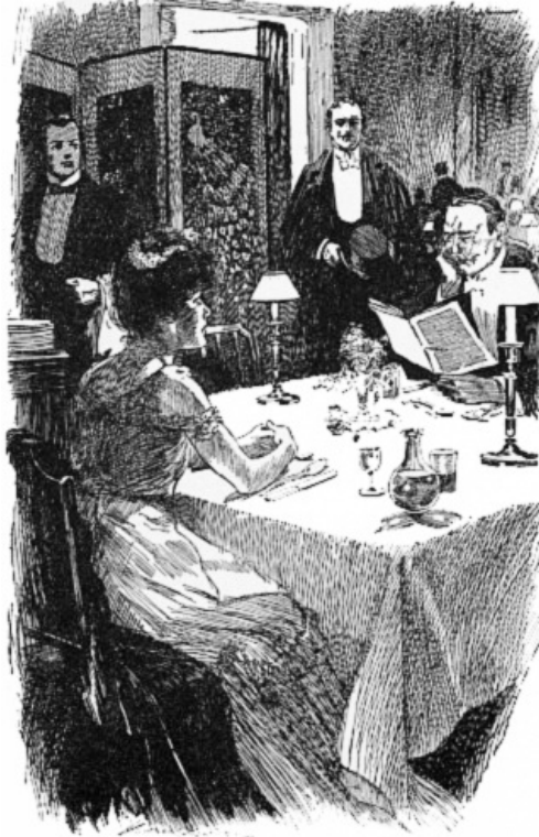
Her companion, who was intent upon the wine list, noticed nothing

Ellison came hurrying back in a few moments and looked in vain for his companion. As he stood there watching the throng of people, Berenice called him to her.