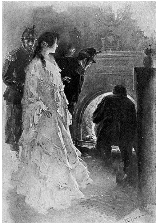
"She was in an agony of alarm."