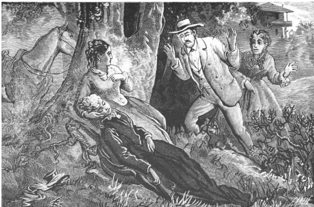
"She soon discovered Mrs. Potter lying by the road-side, groaning and in great pain." — Page 64.

A few days afterwards, Mrs. Potter was lying awake in her room at about seven o'clock in the morning. Mr. and Mrs. Drysdale's room was next to hers, and the transom over the connecting door was open, so that whatever was said in one room could be easily heard in the other. Mrs. Potter heard Drysdale get up and open the blinds to let in the morning sun. He had hardly done so ere he gave a sharp cry and sank into a chair.