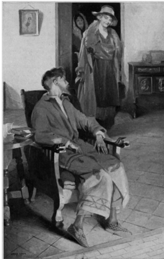
Gerald turned, and beheld that lady

Aurora, smiling all the time with the pleasure she felt in not finding him angry or estranged or in any way altered toward her, took the arm-chair from which he had just risen, while he drew a lighter chair to the other side of the chimney-place. His fires were not like hers. Two half-burned sticks and a form of turf smoldered sparingly on a mound of hot ashes; he eagerly cast on a fagot, and added wood with, for once, an extravagant hand. Then, looking over at her, he smiled, too.