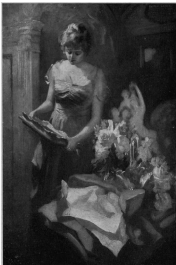
Alone in her room later ... she looked at the other portrait

*** START OF THE PROJECT GUTENBERG EBOOK AURORA THE MAGNIFICENT ***