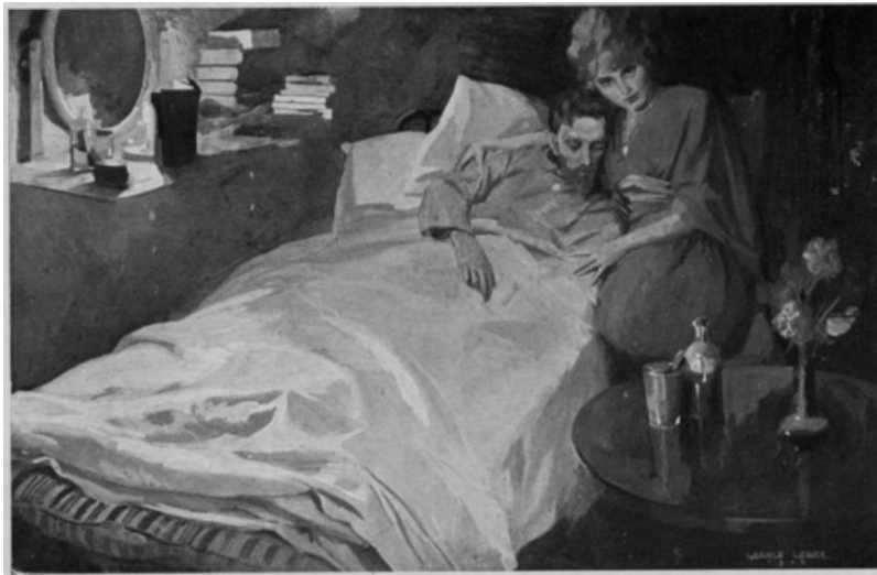
Aurora's eyes, fixed and starry, rested upon the little flame

On the day when Doctor Batoni had agreed that with prudence there would be nothing more to fear, the patient might be regarded as having entered convalescence, Aurora covered him with a wide and warming smile.