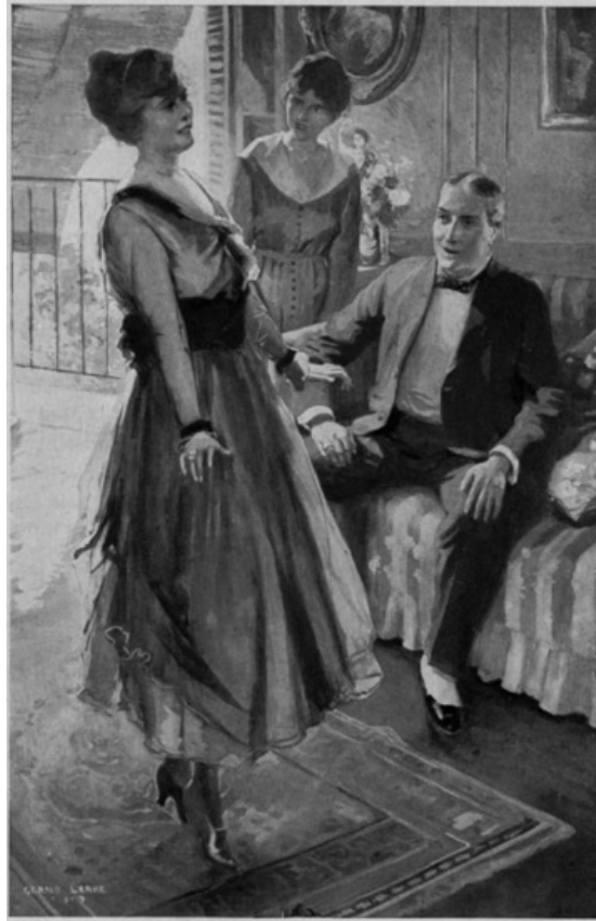
Aurora, with a comedy of pride, threw up her chin, lifted her arms, and turned as if on a pivot, to show herself off in her elegance

Dr. Bewick looked all around the room with leisurely appraising eyes, then nodded understanding. There was no intimation that he was not ready to listen, but he did not seem quite ready to talk. His white shirt-bosom was remarkably broad as he leaned back in his chair in the slightly lolling fashion of large, good-humored men. For all the nonchalance of his attitude, he looked, from evening tie to thin-soled dress-boots, beautifully spruce, as Aurora had remarked, and made an appropriate pendant to her in her Parisian finery.