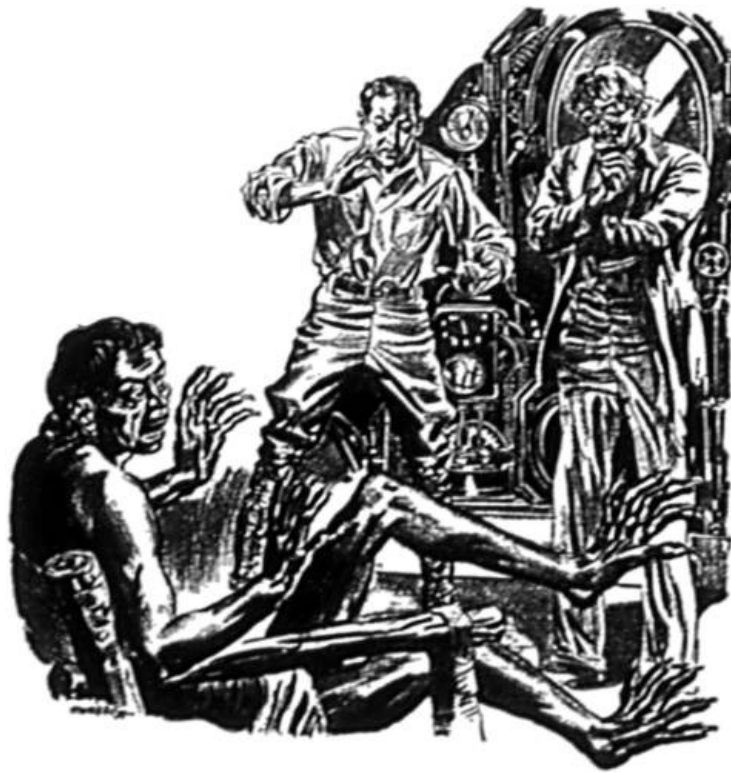
Sir Basil showed his teeth in his ugly smile. "A creator is never merciful."

THE two batalões turned from the open waters of the lower Tapajos River into the igarapé , the lily-smothered shallows that often mark an Indian settlement in the jungles of Brazil.