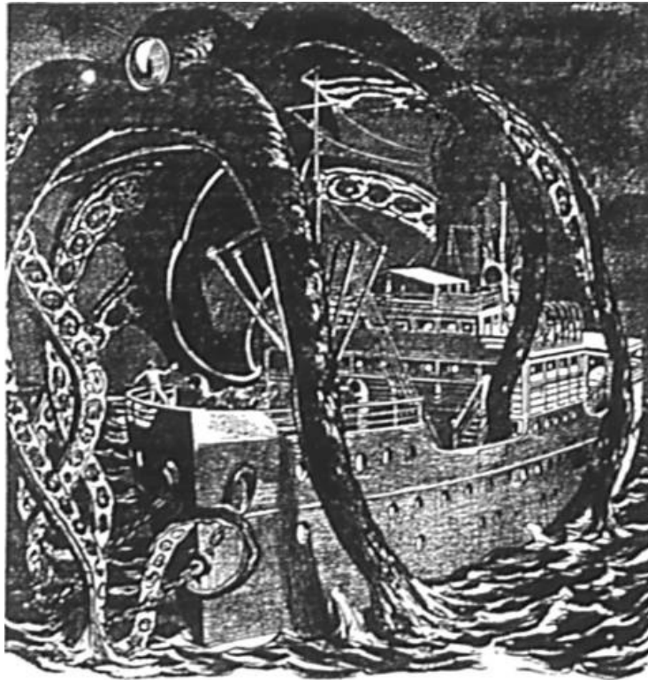
"The mass hung over the ship."

"I BEG your pardon, sir. I'm looking for Dr. Bird."