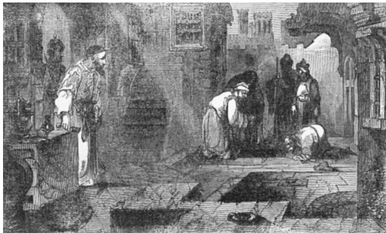
Raising Jeremiah From the Dungeon.

Of course, during the time of this captivity, a very considerable portion of the inhabitants of Judea remained in their native land. The deportation of a whole people to a foreign land is impossible. A vast number, however, of the inhabitants of the country were carried away, and they remained, for two generations, in a miserable bondage. Some of them were employed as agricultural laborers in the rural districts of Babylon; others remained in the city, and were engaged in servile labors there. The prophet Daniel lived in the palaces of the king. He was summoned, as the reader will recollect, to Belshazzar's feast, on the night when Cyrus forced his way into the city, to interpret the mysterious writing on the wall, by which the fall of the Babylonian monarchy was announced in so terrible a manner.