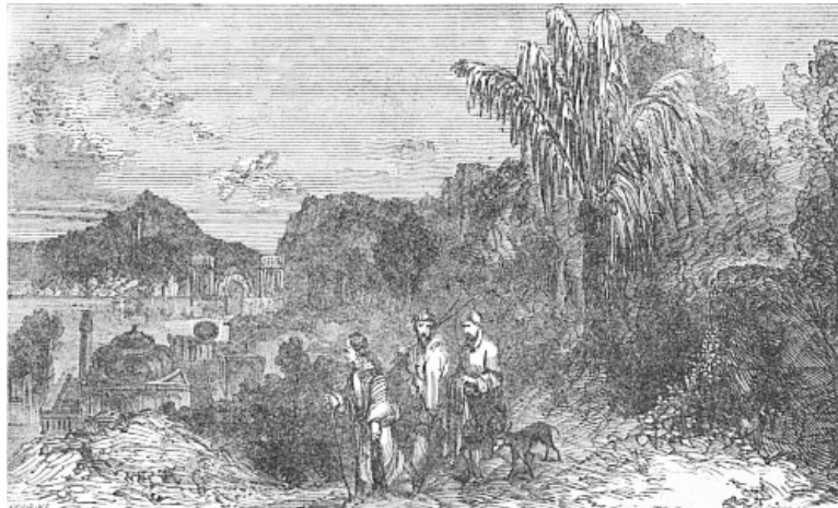
The Secret Correspondence.

He wrote a letter to Cyrus, and then taking a hare, which some of his huntsmen had caught for him, he opened the body and concealed the letter within. He then sewed up the skin again in the most careful manner, so that no signs of the incision should remain. He delivered this hare, together with some nets and other hunting apparatus, to certain trustworthy servants, on whom he thought he could rely, charging them to deliver the hare into Cyrus's own hands, and to say that it came from Harpagus, and that it was the request of Harpagus that Cyrus should open it himself and alone. Harpagus concluded that this mode of making the communication was safe; for, in case the persons to whom the hare was intrusted were to be seen by any of the spies or other persons employed by Astyages on the frontiers, they would consider them as hunters returning from the chase with their game, and would never think of examining the body of a hare, in the hands of such a party, in search after a clandestine correspondence.