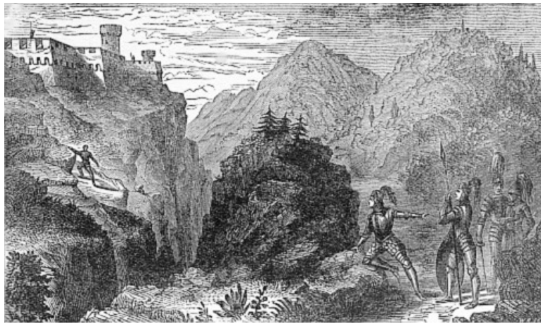
The Siege of Sardis.

In the dreadful confusion and din of the storming of the city, Crœsus himself had a very narrow escape from death. He was saved by the miraculous speaking of his deaf and dumb son—at least such is the story. Cyrus had given positive orders to his soldiers, both before the great battle on the plain and during the siege, that, though they might slay whomever else they pleased, they must not harm Crœsus, but must take him alive. During the time of the storming of the town, when the streets were filled with infuriated soldiers, those on the one side wild with the excitement of triumph, and those on the other maddened with rage and despair, a party, rushing along, overtook Crœsus and his helpless son, whom the unhappy father, it seems, was making a desperate effort to save. The Persian soldiers were about to transfix Crœsus with their spears, when the son, who had never spoken before, called out, "It is Crœsus; do not kill him." The soldiers were arrested by the words, and saved the monarch's life. They made him prisoner, and bore him away to Cyrus.