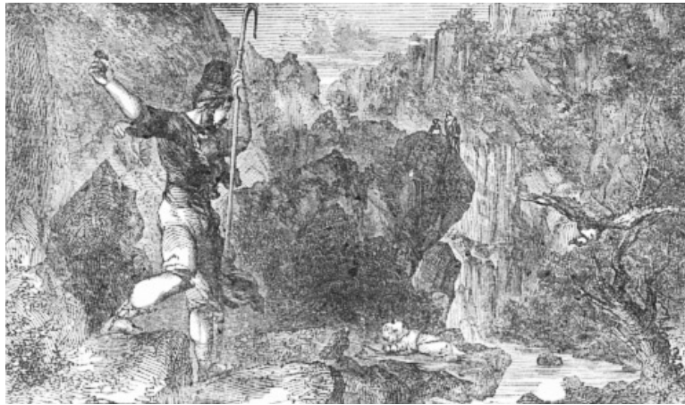
The Exposure of the Infant.

Three days passed away, during which the attendant whom the herdsman had left in the forest watched near the body to prevent its being devoured by wild beasts or birds of prey, and at the end of that time he brought it home. The herdsman then went to Harpagus to inform him that the child was dead, and, in proof that it was really so, he said that if Harpagus would come to his hut he could see the body. Harpagus sent some messenger in whom he could confide to make the observation. The herdsman exhibited the dead child to him, and he was satisfied. He reported the result of his mission to Harpagus, and Harpagus then ordered the body to be buried. The child of Mandane, whom we may call Cyrus, since that was the name which he subsequently received, was brought up in the herdsman's hut, and passed every where for Spaco's child.