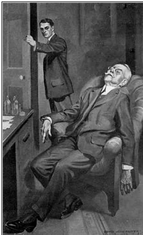
"Mildred!" His White Lips Whispered, Then Stiffened and Were Still

The architect turned on his heel and left the room. Dr. Annister sank wearily into his chair and his hands sought their accustomed position. Then they too fell back against his chest. "Mildred!" his white lips whispered, then stiffened and were still.