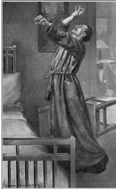
He Sank Face Downward Upon the Bed

The clutching will that was battling with his moved him one step, and then another, toward the end that he feared, though he strove so fiercely against it that the sinews of his neck seemed about to burst through their restraining skin. Stiffening his body, catching at chairs and tables and putting all his strength into the effort to hold his feet firm upon the floor, he fought with the intangible force that gripped him.