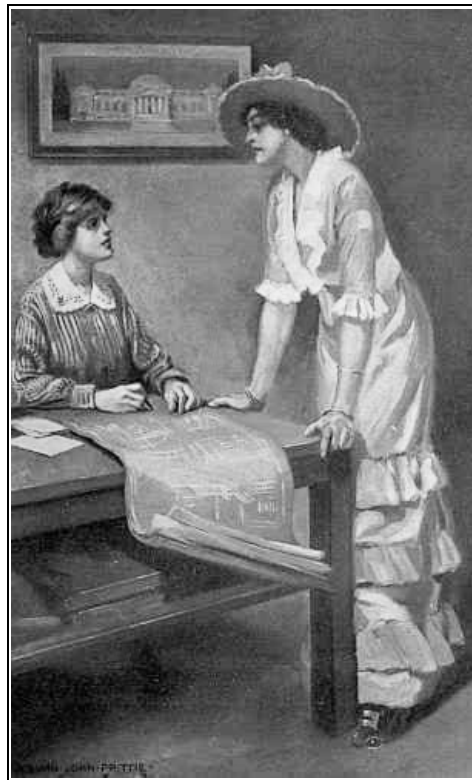
“Harry, Dear, Have You Heard From Him!”

“You’re not keeping anything from me?” the girl demanded, staring at Henrietta with wild, suspicious eyes. “Oh, Harry, you don’t know what all this means to me! I’ve hardly slept for the last two nights! You must tell me everything! Oh, I know you are his confidential secretary and you must not betray his trust, but—you don’t know—I’ve never told you—I’m almost the same as his wife. We’re engaged, and we’d have been married before this but for some notion father has. So I’ve the right to know, Harry—you must tell me all you can!”