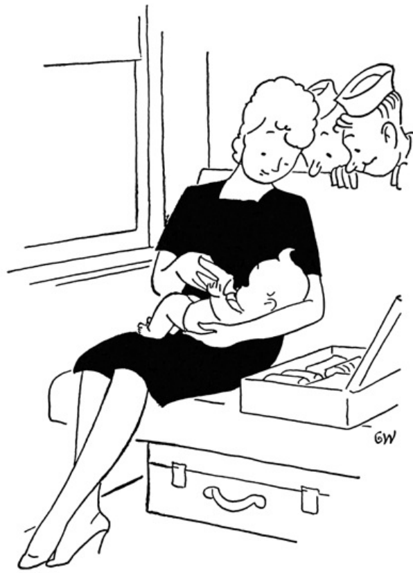
Boys in the bleachers