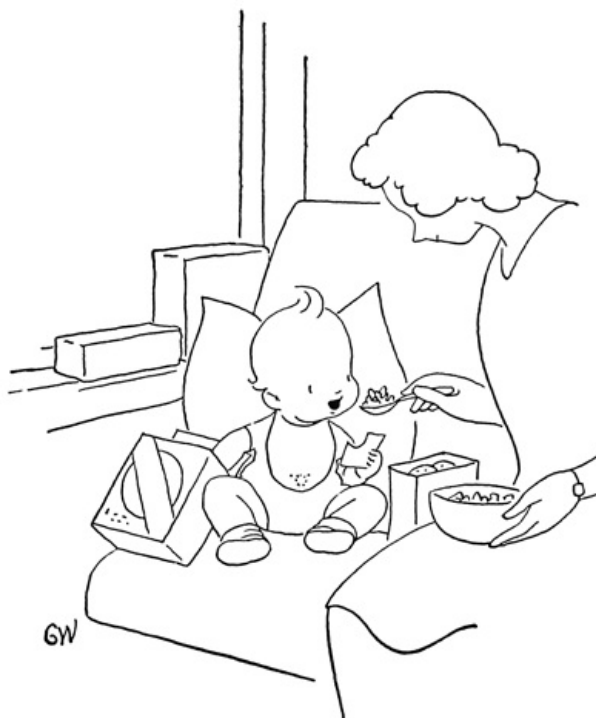
Solid food and solid comfort

—Mothers sometimes attempt to bathe babies on a train in the washroom basins. Don't do it. It isn't sanitary. It is better to let your baby go unbathe during the trip than to run the risk of infection. Clean his face and hands off with cold cream and cleansing tissues and let it go at that.