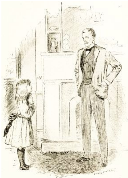
Two muffins would be exquisite.

"Oh ho," he said, "I see! And what is it you want then?"