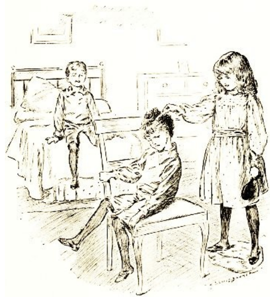
For his hair was very tuggy this morning.