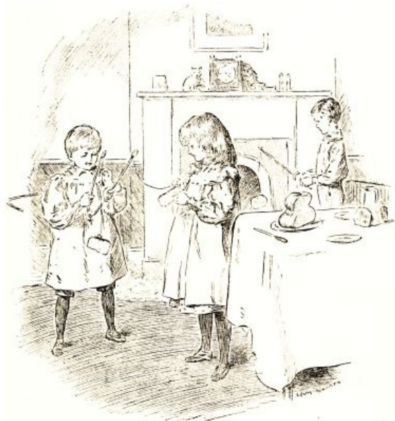
We made holes at the crusty side of the slices, and tied them with string. [Pg 136]

It was no good thinking of splitting the slices, we had to make the best of them, thick as they were. And it took all our planningness to do without a toasting-fork. The tea-spoons were so short that it burnt our hands to hold them so near the fire, and for a minute or two we were quite in despair. At last we managed it. We made holes at the crusty side of the slices, and tied them with string—of which, of course, there were always plenty of bits in Tom's pockets; I believe if he'd been in a desert island for a year he still would have found bits of string to put in his pockets—to the end of the poker and to the two ends of the tongs. They dangled away beautifully; two succeeded admirably, the third unfortunately was hopelessly burnt. We repeated the operation for another set of slices, which all succeeded, then we spread them with the scraped butter in front of the fire by means of the flat ends of our tea-spoons, and at last, very hot, very buttery, very hungry, but triumphant, we sat round the table again to regale ourselves with our tepid tea, but beautifully hot toast, whose perfection was completed by a good thick layer of strawberry jam.