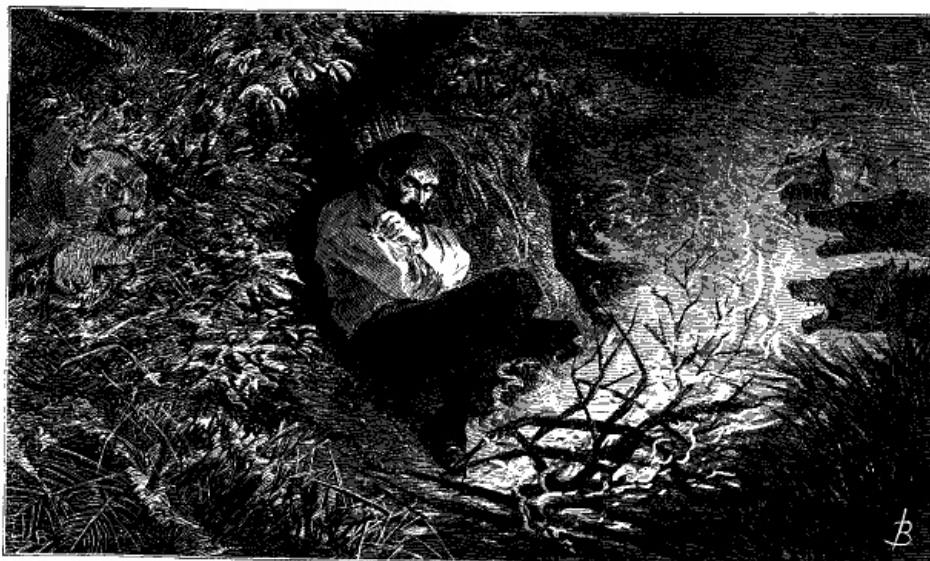
A NIGHT OF TERROR.

Filling my pouches with thistle-roots, I took a parting survey of the little solitude that had afforded me food and fire the preceding ten days, and with something of that melancholy feeling experienced by one who leaves his home to grapple with untried adventures, started for the nearest point on Yellowstone Lake. All that day I traveled over timber-heaps, amid tree-tops, and through thickets. At noon I took the precaution to obtain fire. With a brand which I kept alive by frequent blowing, and constant waving to and fro, at a late hour in the afternoon, faint and exhausted, I kindled a fire for the night on the only vacant spot I could find amid a dense wilderness of pines. The deep gloom of the forest, in the spectral light which revealed on all sides of me a compact and unending growth of trunks, and an impervious canopy of somber foliage; the shrieking of night-birds; the supernaturally human scream of the Mountain lion; the prolonged howl of the wolf, made me insensible to all other forms of suffering.