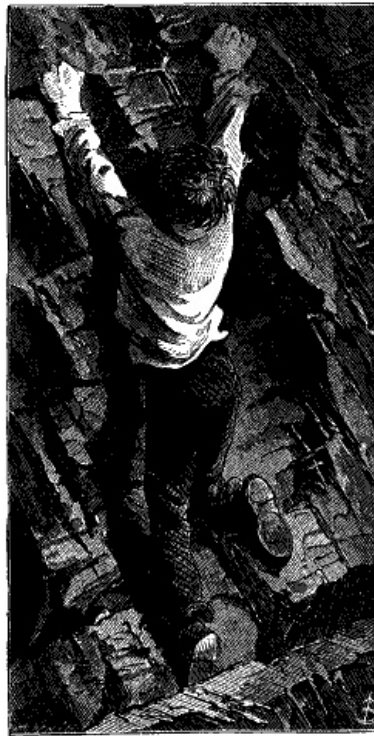
DESCENDING THE PRECIPICE.

Taking counsel of this early formed resolution, I hobbled on my course through the snow, which was rapidly disappearing before the rays of the warm sun. Well knowing that I should find no thistles in the open country, I had filled my pouches with them before leaving the forest. My supply was running low, and there was several days of heavy mountain travel between me and Boteler's ranch. With the most careful economy, it could last but two or three days longer. I saw the necessity of placing myself and imaginary companions upon allowance. The conflict which ensued with the stomach, when I announced this resolution, required great firmness to carry through. I tried wheedling and coaxing and promising; failing in these, I threatened to part company with a comrade so unreasonable, and he made no further complaint.