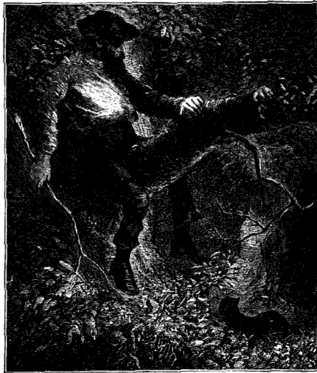
THE MOUNTAIN LION.

Had strength permitted, I should have retained my perch till daylight, but with the consciousness of escape from the jaws of the ferocious brute came a sense of overpowering weakness which almost palsied me, and made my descent from the tree both difficult and dangerous. Incredible as it may seem, I lay down in my old bed, and was soon lost in a slumber so profound that I did not awake until after daylight. The experience of the night seemed like a terrible dream; but the broken limbs which in the agony of consternation I had thrown from the tree, and the rifts made in fallen foliage by my visitant in his circumambulations, were too convincing evidences of its reality. I could not dwell upon my exposure and escape without shuddering, and reflecting that probably like perils would often occur under less fortunate circumstances, and with a more fatal issue. I wondered what fate was in reserve for me—whether I should ultimately sink from exhaustion and perish of starvation, or become the prey of some of the ferocious animals that roamed these vast fastnesses. My thoughts then turned to the loved ones at home. They could never know my fate, and would indulge a thousand conjectures concerning it, not the least distressing of which would be that I had been captured by a band of hostile Sioux, and tortured to death at the stake.