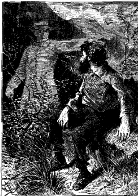
THE GHOSTLY COUNSELLOR.

Overcome by these and other persuasions, and delighted with the idea of having a traveling companion, I plodded my way over the route I had come, intending at a certain point to change it so as to strike the river at the foot of the lake. Stopping after a few miles of travel, I had no difficulty in procuring fire, and passed a comfortable night. When I resumed my journey the next day the sun was just rising. Whenever I was disposed, as was often the case, to question the wisdom of the change of routes, my old friend appeared to be near with words of encouragement, but his reticence on other subjects both surprised and annoyed me. I was impressed at times, during the entire journey with the belief that my return was a fatal error, and if my deliverance had failed should have perished with that conviction. Early this day I deflected from my old route and took my course for the foot of the lake, with the hope, by constant travel, to reach it the next day. The distance was greater than I anticipated. Nothing is more deceptive than distance in these high latitudes. At the close of each of the two succeeding days, my point of destination was seemingly as far from me as at the moment I took leave of the Madison Range, and when, cold and hungry, on the afternoon of the fourth day, I gathered the first food I had eaten in nearly five days, and lay down by my fire near the debouchure of the river, I had nearly abandoned all hope of escape.