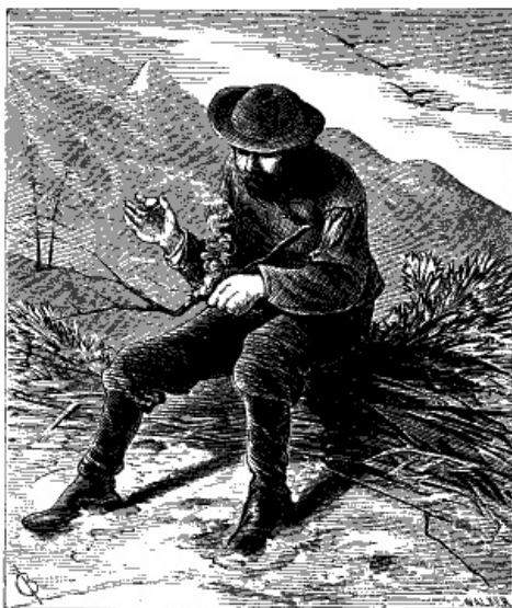
THE FIRST FIRE.

My stay at the springs was prolonged several days by an accident that befell me on the third night after my arrival there. An unlucky movement while asleep broke the crust on which I reposed, and the hot steam, pouring upon my hip, scalded it severely before I could escape. This new affliction, added to my frost-bitten feet, already festering, was the cause of frequent delays and unceasing pain through all my wanderings. After obtaining fire, I set to work making preparations for as early departure as my condition would permit. I had lost both knives since parting from the company, but I now made a convenient substitute by sharpening the tongue of a buckle which I cut from my vest. With this I cut the legs and counters from my boots, making of them a passable pair of slippers, which I fastened to my feet as firmly as I could with strips of bark. With the ravelings of a linen handkerchief, aided by the magic buckle-tongue, I mended my clothing. Of the same material I made a fish-line, which, on finding a piece of red tape in one of my pockets better suited to the purpose, I abandoned as a "bad job." I made of a pin that I found in my coat a fish-hook, and, by sewing up the bottoms of my bootlegs, constructed a good pair of pouches to carry my food in, fastening them to my belt by the straps.