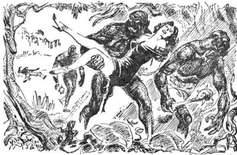
The beastman's intent was all too clear.

His heart was sick at what would surely be Doree's fate. He saw her just beyond the perimeter of battle still held by her two captors who were viewing the fight with rapt interest. If he could only reach her. One swing of his gun butt and she would serve no vile purpose in the hands of these raiders.