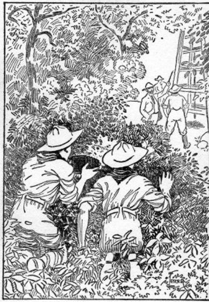
Here they knelt and waited and waited.