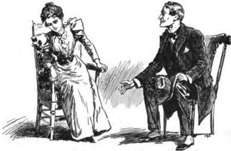
HIS OPEN ADMIRATION WAS GETTING QUITE EMBARRASSING.

He gazed at me once more. 'Ef only I could get hold of a woman of business like you to soar through life with me,' he murmured.