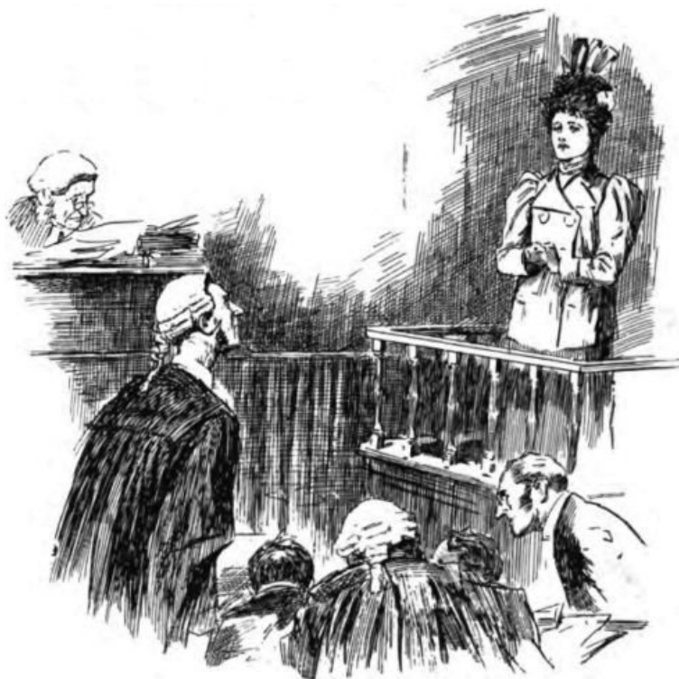
I WAS A GROTESQUE FAILURE.

'Oh, he took you aside? Confidential? Well, now we're getting at it. And did anybody but yourself see or hear any part whatsoever of this precious document?'