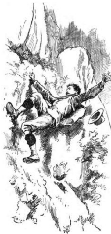
I ROLLED AND SLID DOWN.