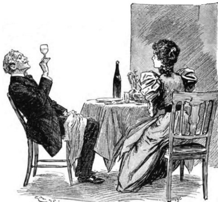
LET THEM BOOM OR BUST ON IT.

' Old town?' he repeated, gazing with a blank stare. 'You call this town old , do you?'