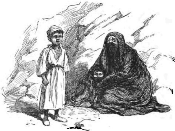
CROUCHING BY THE ROCKS SAT OUR MYSTERIOUS STRANGER.

After ten minutes, when we had returned to our crouching-place under the shadow of the wall, the woman detached herself slowly from the group, and began strolling with almost overdone nonchalance along the road to Geergeh. We could see the little girl was frightened and seemed to expostulate with her mother: fortunately, the Arabs about were too much occupied in watching the suspicious strangers to notice this episode of their own people. Presently, our new friend disappeared; and, with beating hearts, we awaited the sunset.