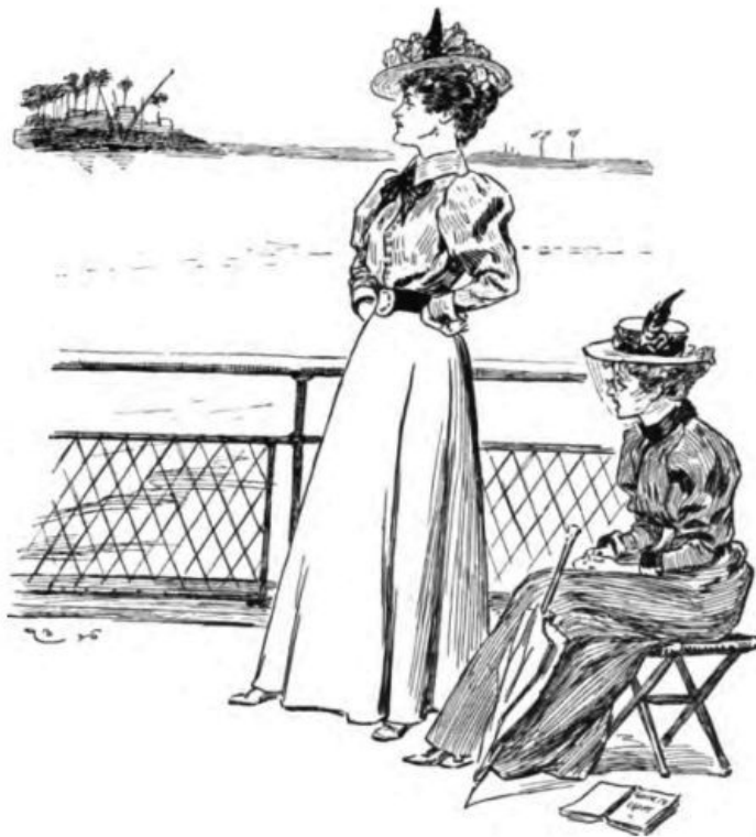
TOO MUCH NILE.

Another disillusion weighed upon my soul. Before I went up the Nile, I had a fancy of my own that the bank was studded with endless ruined temples, whose vast red colonnades were reflected in the water at every turn. I think Macaulay's Lays were primarily answerable for that particular misapprehension. As a matter of fact, it surprised me to find that we often went for two whole days' hard steaming without ever a temple breaking the monotony of those eternal date-palms, those calm and superciliously irresponsive camels. In my humble opinion, Egypt is a fraud; there is too much Nile—very dirty Nile at that—and not nearly enough temple. Besides, the temples, when you do come up with them, are just like the villages; they are the same temple over again, under a different name each time, and they have the same gods, the same kings, the same wearisome bas-reliefs, except that the gentleman in a chariot, ten feet high, who is mowing down enemies a quarter his own size, with unsportsmanslike recklessness, is called Rameses in this place, and