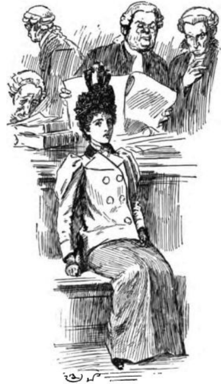
I REELED WHERE I SAT.