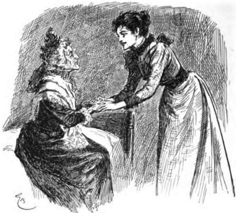
I PUT HER HAND BACK FIRMLY.