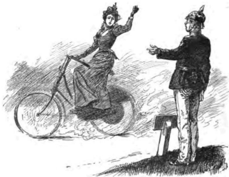
HOW FAR AHEAD THE FIRST MAN?

The steepest slope of all lay in the next two miles. If I were going to win I must pass these two there, for my advantage lay all in the climb; if it came to coasting, the men's mere weight scored a point in their favour. Bump, crash, jolt! I pedalled away like a machine; the Manitou sobbed; my ankles flew round so that I scarcely felt them. But the road was rough and scarred with waterways—ruts turned by rain to runnels. At half a mile, after a desperate struggle among sand and pebbles, I passed the second man; just ahead, the Prussian officer looked round and saw me. 'Thunder-weather! you there, Engländerin?' he cried, darting me a look of unchivalrous dislike, such as only your sentimental German can cast at a woman.