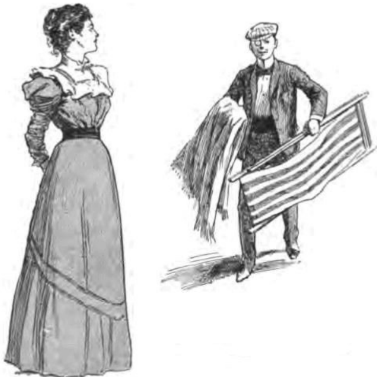
NOTHING SEEMED TO PUT THE MAN DOWN.

'I am glad,' I answered demurely, 'if I have secured your approbation in that humble capacity. I'm sure I have tried hard for it.'