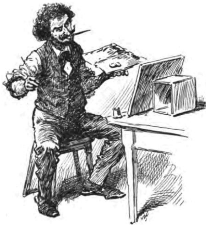
PAINTING THE SIGN-BOARD.