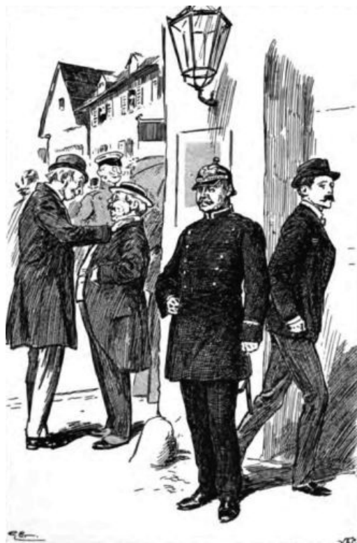
HE CAST A HASTY GLANCE AT US.

We walked much on the terrace—the inevitable dawdling promenade of all German watering-places—it reeked of Serene Highness. We also drove out among the low wooded hills which bound the Rhine valley. The majority of the visitors, I found, were ladies—Court ladies, most of them; all there for their complexions, but all anxious to assure me privately they had come for what they described as 'nervous debility.' I divided them at once into two classes: half of them never had and never would have a complexion at all; the other half had exceptionally smooth and beautiful skins, of which they were obviously proud, and whose pink-and-white peach-blossom they thought to preserve by assiduous bathing. It was vanity working on two opposite bases. There was a sprinkling of men, however, who were really there for a sufficient reason—wounds or serious complaints; while a few good old sticks, porty and whisty, were in attendance on invalid wives or sisters.