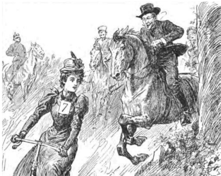
DON'T SCORCH, MISS; DON'T SCORCH.

to pass the hindmost of the cyclists; and they were kept back by my presence from following up their special champions. 'Give it up, Fräulein, give it up!' they cried. 'You're beaten. Let us pass and get forward.' But at the self-same moment, I heard the shrill voice of my American friend whooping aloud across the din, 'Don't you do nothing of the sort, miss! You stick to it, and keep your wind! It's the wind that wins! Them Germans won't be worth a cent on the high slopes, anyway!'