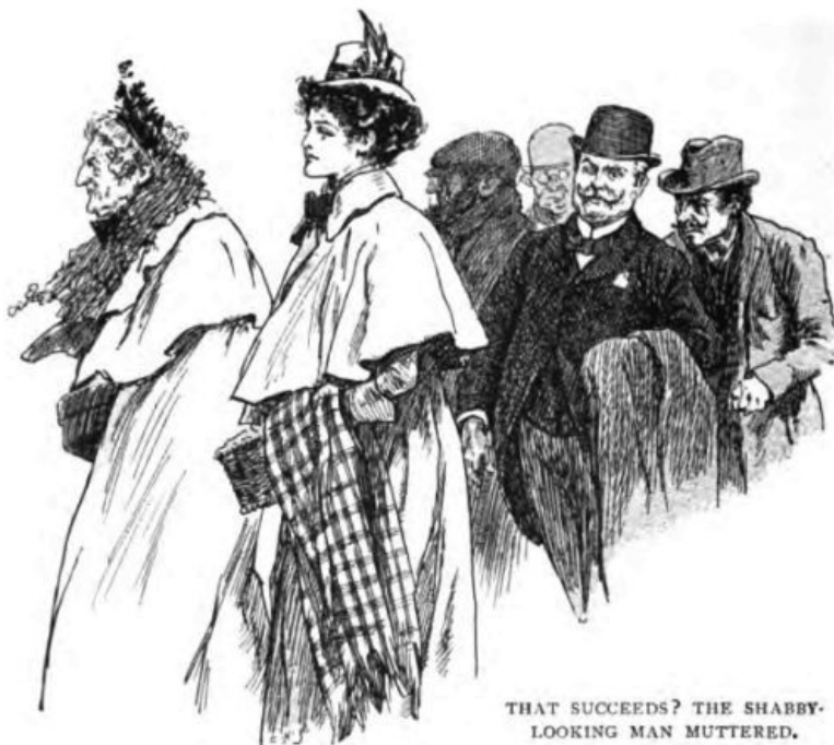
THAT SUCCEEDS? THE SHABBY-LOOKING MAN MUTTERED.

By this time my suspicions of the Count were profound. From the first I had doubted him; he was so blandly plausible. But as we landed at Ostend I had accidentally overheard a low whispered conversation when he passed a shabby-looking man, who had travelled in a second-class carriage from London. 'That succeeds?' the shabby-looking man had muttered under his breath in French, as the haughty nobleman with the waxed moustache brushed by him.