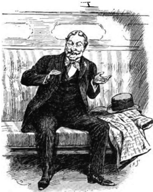
A MOST URBANE AND OBLIGING CONTINENTAL GENTLEMAN.

other people's property as if it was blackbeetles? No, I will not let you take this, Lois; this is my jewel-box—it contains all that remains of the Fawley family jewels. I positively decline to appear at Schlangenbad without a diamond to my back. This never leaves my hands. It's hard enough nowadays to keep body and skirt together. Have you secured that coupé at Ostend? '