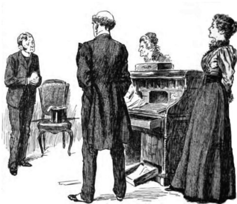
YOU WISHED TO SEE ME, SIR?

He advanced, fumbling his hands all the time, and smiling and fawning. 'You wished to see me, sir?' he murmured, in a deprecatory voice, looking sideways at Lady Georgina and me, but addressing the lawyer.