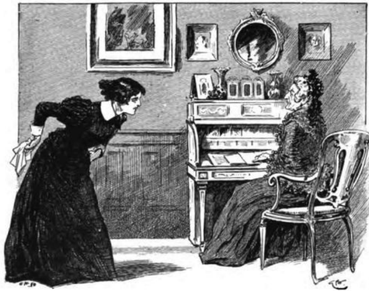
OUI, MADAME; MERCI BEAUCOUP, MADAME.

could I do, my dear? I simply couldn't put up with such insolence. So I looked her straight back in the face—oh, she quailed, I can tell you; and I said to her, in my iciest voice—you know how icy I can be when occasion demands it!—the second old lady nodded an ungrudging assent, as if perfectly prepared to admit her friend's rare gift of iciness—'I said to her, "Célestine, you can take your month's wages, and half an hour to get out of this house." And she dropped me a deep reverence, and she answered: " Oui, madame; merci beaucoup, madame; je ne desire pas mieux, madame. " And out she flounced. So there was the end of it.'