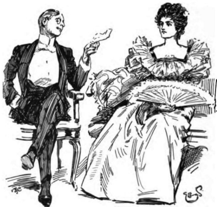
IT'S I WHO AM THE WINNAH.

'I'd give a couple of monkeys for those whiskahs,' Lord Southminster murmured, half unnoticed.