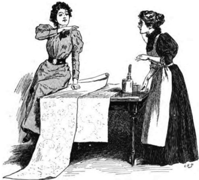
I AM GOING OUT, SIMPLY IN SEARCH OF ADVENTURE.

'Yes, it's a terrible nuisance,' the eldest and ugliest of the two observed—she was a high-born lady, with a distinctly cantankerous cast of countenance. She had a Roman nose, and her skin was wrinkled like a wilted apple; she wore coffee-coloured point-lace in her bonnet, with a complexion to match. 'But what