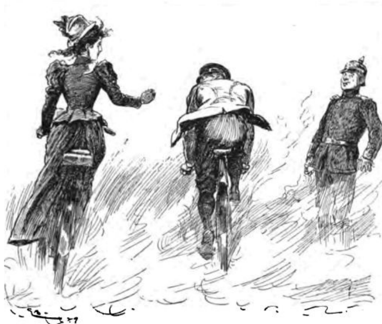
I AM HERE BEHIND YOU, HERR LIEUTENANT.

'Yes, I am here, behind you, Herr Lieutenant,' I answered, putting on a spurt; 'and I hope next to be before you.'