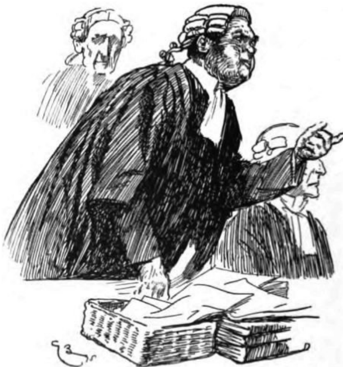
THE CROSS-EYED Q.C. BEGGED HIM TO BE VERY CAREFUL.

'That won't do me much good,' he answered, 'if I have to wait fourteen years for you—at Portland.'