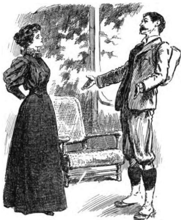
I MAY STAY, MAYN'T I?

Elsie rose like a lamb. I have an impression that she gathered we wanted to be left alone.