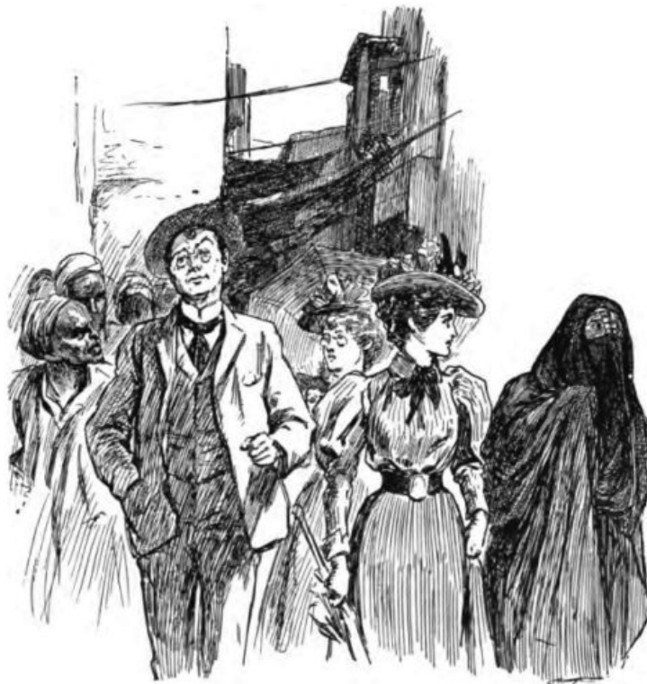
HER AGITATION WAS EVIDENT.

All through that anxious afternoon we sat in our tents, under the shade of the mud-wall,