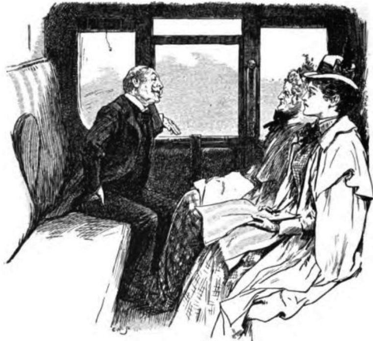
PERSONS OF MILADI'S TEMPERAMENT ARE ALWAYS YOUNG.

At Ostend the Count made a second gallant attempt to capture the jewel-case, which Lady Georgina automatically repulsed. She had a fixed habit, I believe, of sticking fast to that jewel-case; for she was too overpowered by the Count's urbanity, I feel sure, to suspect for a moment his honesty of purpose. But whenever she travelled, I fancy, she clung to her case as if her life depended upon it; it contained the whole of her valuable diamonds.