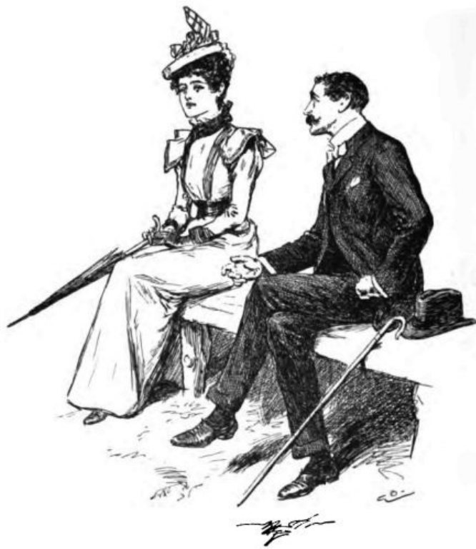
MISS CAYLEY, HE SAID, YOU ARE PLAYING WITH ME.

child, my child, what shall I do without you?'