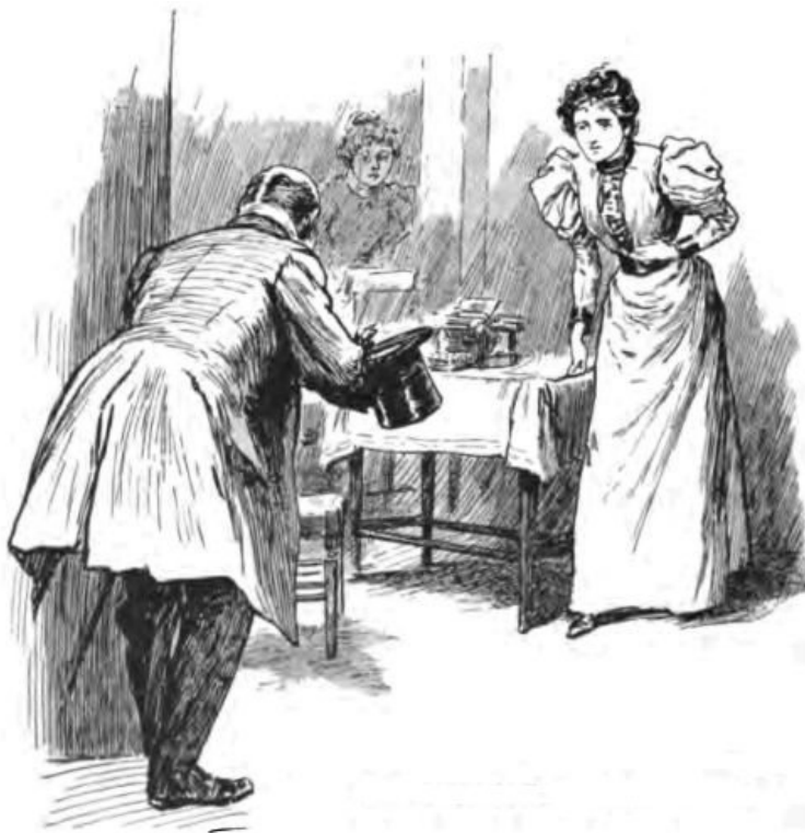
HE BOWED TO US EACH SEPARATELY.

I saw he took my remark as a compliment. What I really meant to say was that a commonplace man might easily be brother to so clever a woman as Lady Georgina.