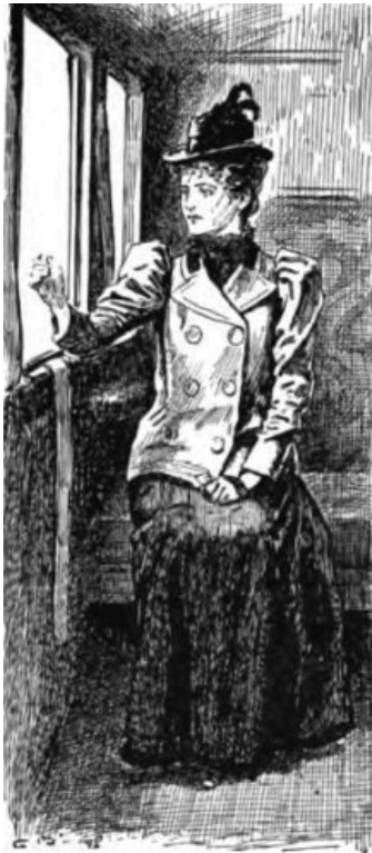
I BECKONED A PORTER.

I drew a card from my case before we left Berwick station, and scribbled a few hasty words on it in German. 'We are watched. A detective! If we run through to Edinburgh, we shall doubtless be arrested or at least impeded. This train will stop at Dunbar for one minute. Just before it leaves again, get out as quietly as you can—at the last moment. I will also get out and join you. Let Partab go on; it will excite less attention. The scheme I suggest is the only safe plan. If you agree, as soon as we have well started from Berwick, shake your handkerchief unobtrusively out of your carriage window.'