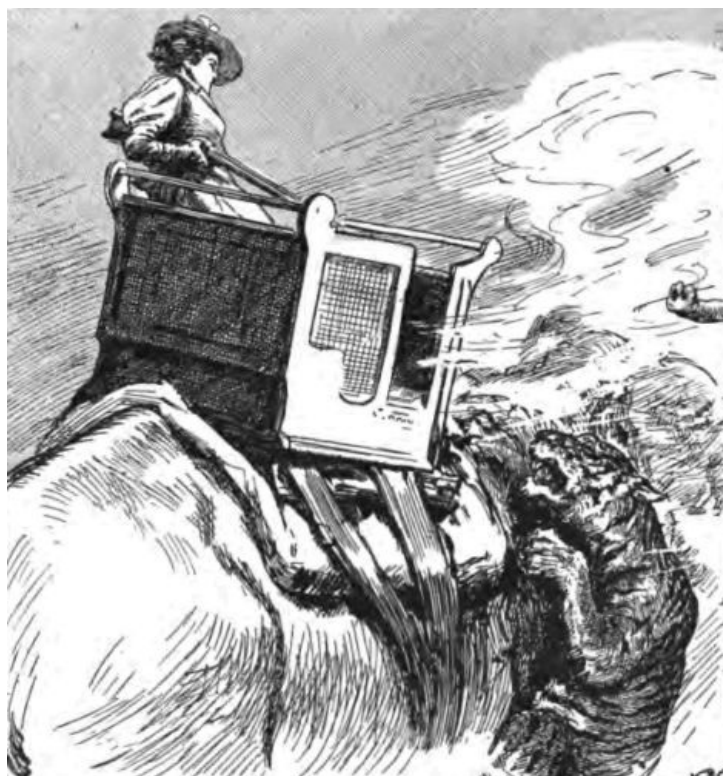
IT WENT OFF UNEXPECTEDLY.

My mahout, unable to keep his seat with the rocking, now dropped off his cushion among the scrub below. He could speak a few words of English. 'Shoot, Mem Sahib, shoot!' he cried, flinging his hands up. But I was tossed to and fro, from side to side, with my rifle under my arm. It was impossible to aim. Yet in sheer terror I tried to draw the trigger. I failed; but somehow I caught my rifle against the side of my cage. Something snapped in it somewhere. It went off unexpectedly, without my aiming or firing. I shut my eyes. When I opened them again, I saw a swimming picture of the great sullen beast, loosing his hold on the elephant. I saw his brindled face; I saw his white tusks. But his gleaming pupils burned bright no longer. His jaw was full towards me: I had shot him between the eyes. He fell, slowly, with blood streaming from his nostrils, and his tongue lolling out. His muscles relaxed; his huge limbs grew limp. In a minute, he lay stretched at full length on the ground, with his head on one side, a grand, terrible picture.