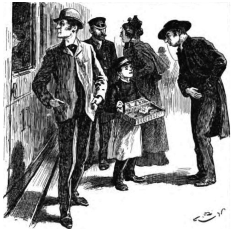
HE TOOK A LONG, CARELESS STARE AT ME.

At York, I noticed with a thrill of terror that a man in plain clothes, with the obtrusively unobtrusive air of a detective, looked carefully though casually into every carriage. I felt sure he was a spy, because of his marked outer jauntiness of demeanour, which hardly masked an underlying hang-dog expression of scrutiny. When he reached my place, he took a long, careless stare at me—a seemingly careless stare, which was yet brim-full of the keenest observation. Then he paced slowly along the line of carriages, with a glance at each, till he arrived just opposite the Maharajah's compartment. There he stared hard once more. The Maharajah descended; so did Harold and the Hindu attendant, who was dressed just like him. The man I took for a detective indulged in a frank, long gaze at the unconscious Indian prince, but cast only a hasty eye on the two apparent followers. That touch of revelation relieved my mind a little. I felt convinced the police were watching the Maharajah and myself, as suspicious persons connected with the case; but they had not yet guessed that Harold had disguised himself as one of the two invariable Rajput servants.