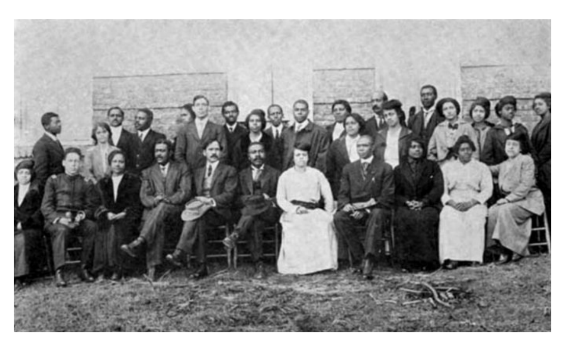
TEACHERS OF SNOW HILL INSTITUTE

We have in the South, as every one knows, a dual system of public schools, one for the whites and one for the Negroes. This accounts in part for our poor schools for both white and colored. Such a system is expensive and, of course, the Negro gets the worst of the bargain. This is not surprising to him; he expects it in all such cases. He has been taught to expect only a half loaf where others get a whole one, but in some cases he gets practically nothing from the State for education. For an instance, I know four or five Negro public schools in the Black Belt that get $37.00 for the school term of four months. It would be hard to figure out how a teacher can live in these days on $9.25 per month. But, as I have said, the agencies that I have mentioned above have done much and are doing more to improve these conditions.