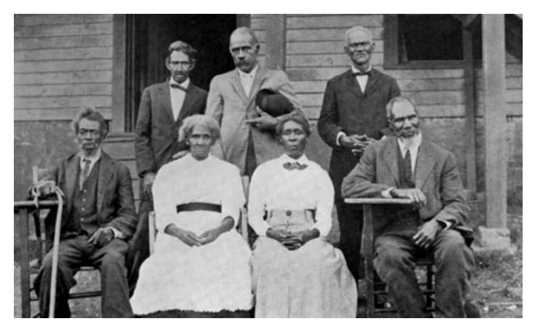
FIRST TRUSTEES OF SNOW HILL AND TWO OF THEIR WIVES

They were much opposed to industrial education. When the school was started, many of the parents came to school and forbade our "working" their children, stating as their objection that their children had been working all their lives and that they did not mean to send them to school to learn to work. Not only did they forbid our having their children work, but many took their children out of school rather than allow them to do so. A good deal of this opposition was kept up by illiterate preachers and incompetent teachers, who had not had any particular training for their profession. In fact, ninety-eight per cent of them had attended no school. We continued, however, to keep the "Industrial Plank" in our platform, and year after year some industry was added until we now have fourteen industries in constant operation. Agriculture is the foremost and basic industry of the institution. We do this because we are in a farming section and ninety-five per cent of the people depend upon agriculture for a livelihood.