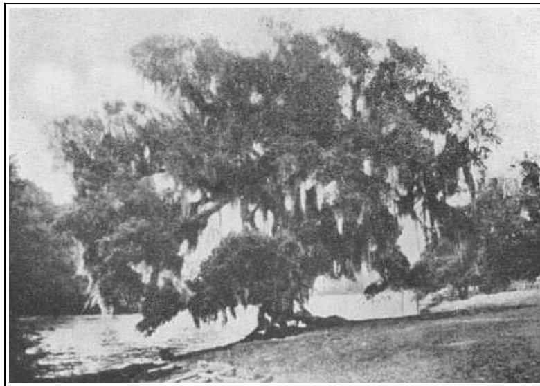
The Evangeline Oak Near the "Poste des Attakapas"

"'Louis,' said she, painfully impressed by her lover's silence and coldness, 'why do you turn away from me? I am still your Emmeline, your betrothed, and I have kept pure and unsullied my plighted faith to you. Not a word of welcome, Louis?' she said, as the tears started to her eyes. 'Tell me, do tell me that you love me still, and that the joy of meeting me has overcome you, and stifled your utterance.'