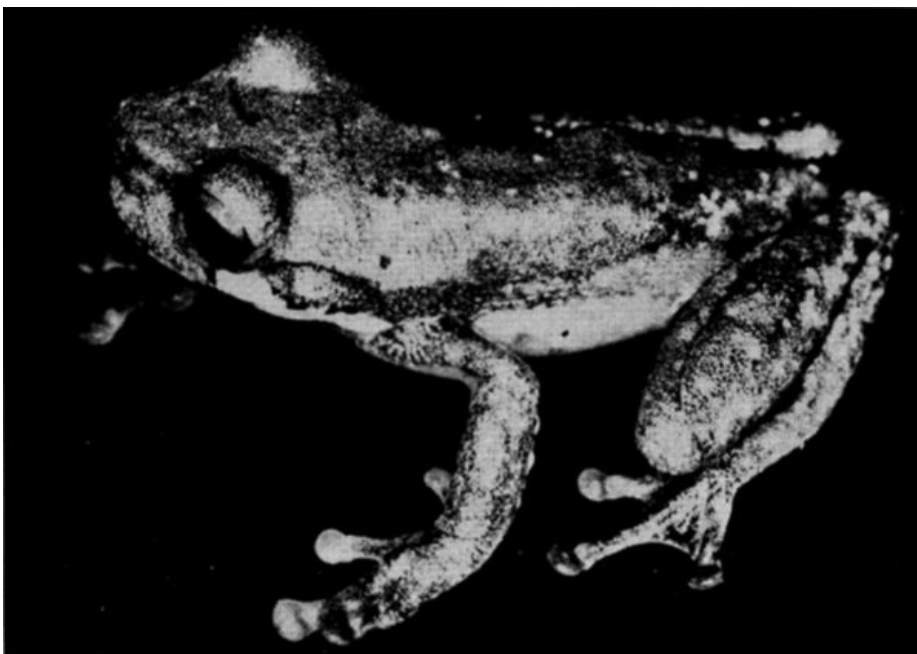
Fig. 2. Holotype of Ptychohyla chamulae (KU 58063). × 3.

Color (in alcohol) dull brown above with irregular dark brown blotches; dorsal surfaces of limbs brown with narrow darker brown transverse bars; posterior