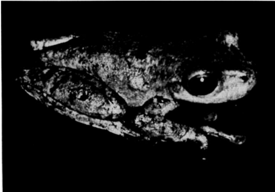
Fig. 1. Paratype of Ptychohyla ignicolor (UMMZ 119602). × 3.