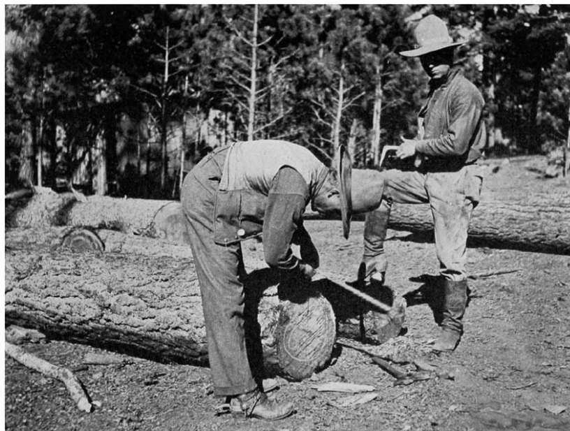
FOREST RANGERS SCALING TIMBER

Next to the protection of his District from fire, the most important duty of the Ranger has to do with the sale of timber and the marking of the individual trees which are to be cut. The reproduction of the forest depends directly on what trees are kept for seed, or on how the existing young growth is protected and preserved in felling and swamping the trees which have been marked for cutting, and in skidding the logs. The disposal of the slash must be looked after, for it has much to do with forest reproduction, and with promoting safety from fire. Then, the scaling of the logs determines the amount of the payment the Government receives for its timber, and there are often regulations governing the transportation of the scaled logs whose enforcement is of great consequence to the future forest.