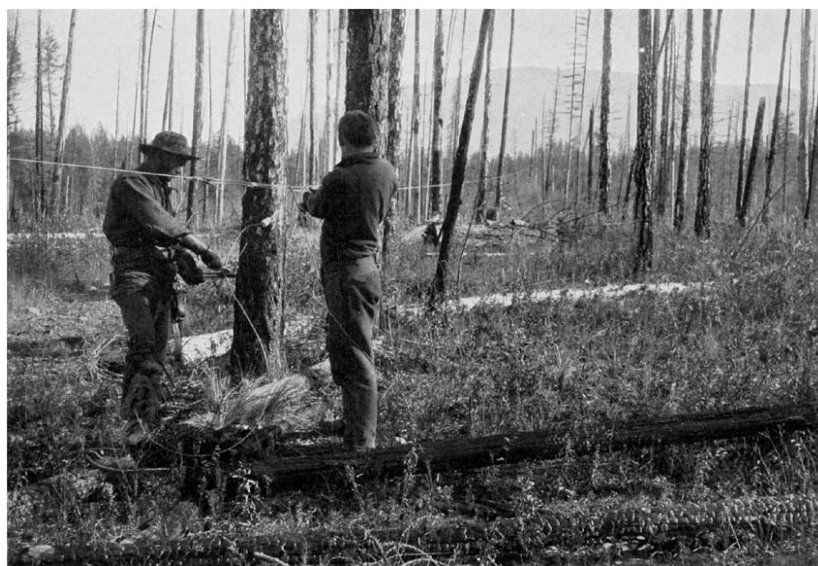
STRINGING A FOREST TELEPHONE LINE

The work of a Forest Ranger is, first of all, to protect the District committed to his charge against fire. That comes before all else. For that purpose, the Ranger patrols his District during the seasons when fires are dangerous, or watches for signs of fire from certain high points, called fire-lookouts, or both. He keeps the trails and fire lines clear and the telephone in working order, and sees to it that the fire fighting tools, such as spades, axes, and rakes, are in good condition and ready for service. If he is wise, he establishes such relations with the people who live in his neighborhood that they become his volunteer assistants in watching for forest fires, in taking precautions against them, and in notifying him of them when they do take place.