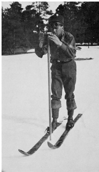
A FOREST EXAMINER RUNNING A COMPASS LINE

In nearly every National Forest there are areas upon which the trees have been destroyed by fire. Many of these are so large or so remote from seed-bearing trees that natural reproduction will not suffice to replace the forest. In such localities planting is needed, and for that purpose the Forest Examiner must establish and conduct a forest nursery. The decision on the kind of trees to plant and on the methods of raising and planting them, the collection of the seed, the care and transplanting of the young trees until they are set out on the site of the future forest, forms a task of absorbing interest. Such work often requires a high degree of technical skill. It is likely to occupy a larger and larger share of the time and attention of the trained men of the Forest Service.