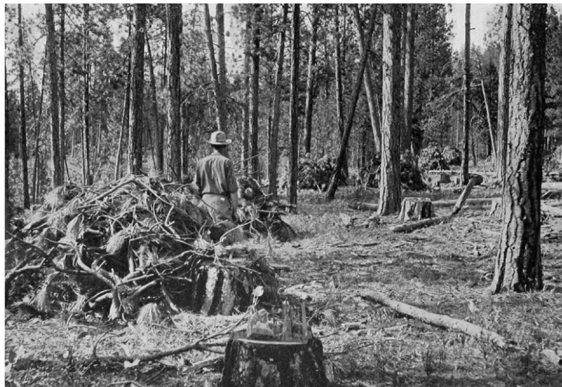
BRUSH PILING IN A NATIONAL FOREST TIMBER SALE

The office work needed in the mapping of the National Forests, with all their resources, boundaries, and interior holdings, is in charge of the Branch of Operation. So is the immense amount of drafting which is necessary in the other work of the Service, and the photographic laboratory in which maps are reproduced and where permanent photographic records of the condition of the forest are made.