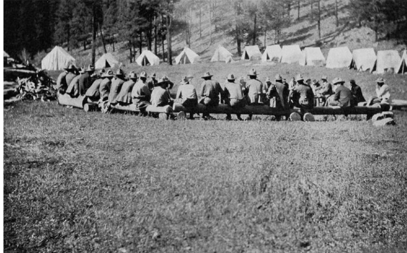
FOREST RANGERS GETTING INSTRUCTION IN METHODS OF WORK FROM A DISTRICT FOREST OFFICER

District offices is in charge of a District Forester, who directs the practical carrying out of the policies finally determined upon in Washington, after consultation with the men in the field. The execution of all the work, the larger features of which the Washington office decides and directs (and the details of which it inspects), is the task of the District Forester. The District Forester's office is necessarily organized much on the same general lines as the Washington headquarters. Thus, the subjects of accounts, operation, silviculture, grazing, lands, and forest products are all represented in the District offices. In addition, a legal officer is necessarily attached to each District office, and each District Forester has in his District one or more forest experiment stations, employed mainly in studying questions of growth and reproduction; and three forest insect field stations, maintained in coöperation with the Bureau of Entomology, are divided among the six Districts.