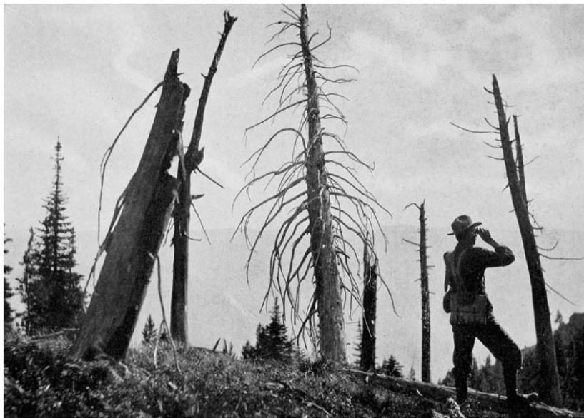
A FOREST RANGER LOOKING FOR FIRE FROM A NATIONAL FOREST LOOKOUT STATION Page 32