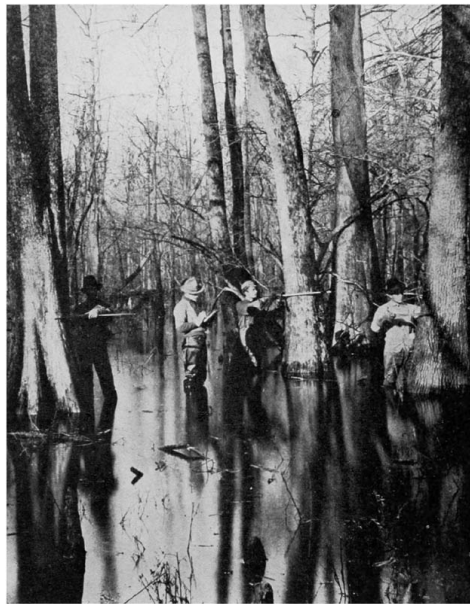
FOREST SERVICE MEN MAKING FRESH MEASUREMENTS IN THE MISSOURI SWAMPS