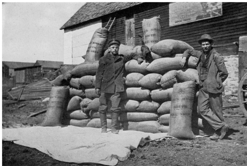
WESTERN YELLOW PINE SEED COLLECTED BY THE FOREST SERVICE FOR PLANTING UP DENUED LANDS

The Supervisor spends about half his time in the office and half in the field, inspecting the work of his men and consulting with them, meeting local residents or associations of local residents who have propositions to submit for improving the service of the forest to them, or for correcting mistakes, or who wish to lay before the Supervisor some one of the numberless matters in which the forest affects their welfare. The usefulness of the Supervisor depends as much upon his good judgment, his ability to meet men and do business with them, and his knowledge of local needs and local affairs, as it does upon his knowledge of the forest itself. As in the case of every superior officer, his attitude toward his work, his energy, his good sense, and his good will are or should be reflected in the men under him, so that his position is one of the greatest importance in