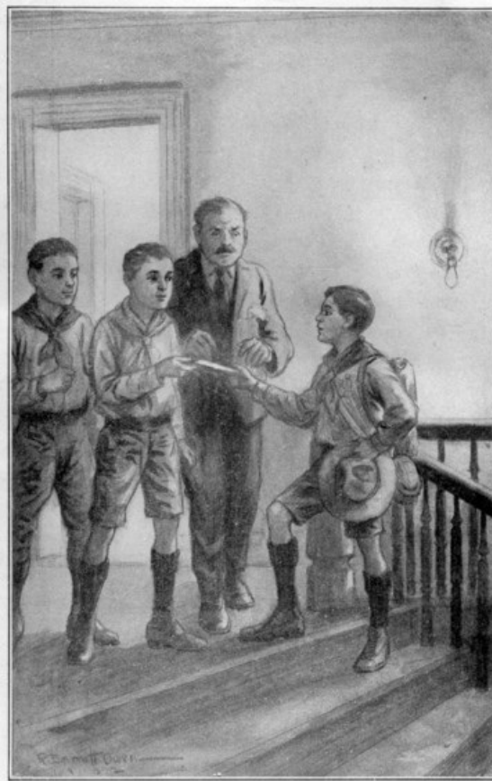
"HERE, READ THIS LETTER," SAID PEE-WEE TO ROY. Roy Blakeley in the Haunted Camp. Page 187