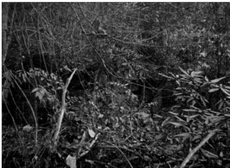
Moonshine Still-House Hidden in the Laurel

The shock turned around, then tumbled over, and there stood revealed a bare-headed, bare-footed woman, coarse featured but of superb physique—one of those mountain giantesses who think nothing of shouldering a two-bushel sack of corn and carrying it a mile or two without letting it down.