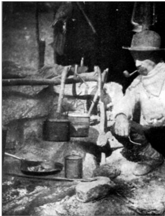
The Author in Camp in the Big Smokies

In times of scarcity many of our people took to the woods and gathered commoner medicinal roots, such as bloodroot and wild ginger (there are scores of others growing wild in great profusion), but made only a pittance at it, as synthetic drugs have mostly taken the place of herbal simples in modern medicine. Women and children did better, in the days before Christmas, by gathering galax, "hemlock" ( leucothoe ), and mistletoe, selling to the dealers at the railroad, who ship them North for holiday decorations. One bright lad from town informed me, with evident pride of geography, that "Some of this goes to London, England." Nearly everywhere in our woods the beautiful ruddy-bronze galax is abundant. Along the water-courses, leucothoe , which similarly turns bronze in autumn, and lasts throughout the winter, is so prolific as to be a nuisance to travelers, being hard to push through.