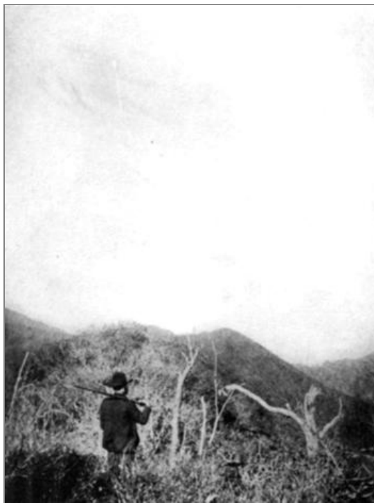
“...Powerful steep and Laurely...”

“All this,” I apostrophized, “shall be swept away, tree and plant, beast and fish. Fire will blacken the earth; flood will swallow and spew forth the soil. The simple-hearted native men and women will scatter and disappear. In their stead will come slaves speaking strange tongues, to toil in the darkness under the rocks. Soot will arise, and foul gases; the streams will run murky death. Let me not see it! No; I will