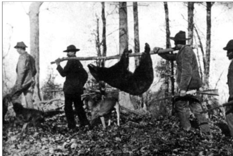
"By and by up they came, carrying the Bear on a trimmed sapling"

For many a league to the southward clouds covered all the valleys in billows of white, from which rose a hundred mountain tops, like islands in a tropic ocean. My fancy sailed among and beyond them, beyond the horizon's rim, even unto those far seas that I had sailed in my youth, to the old times and the old friends that I should never see again.