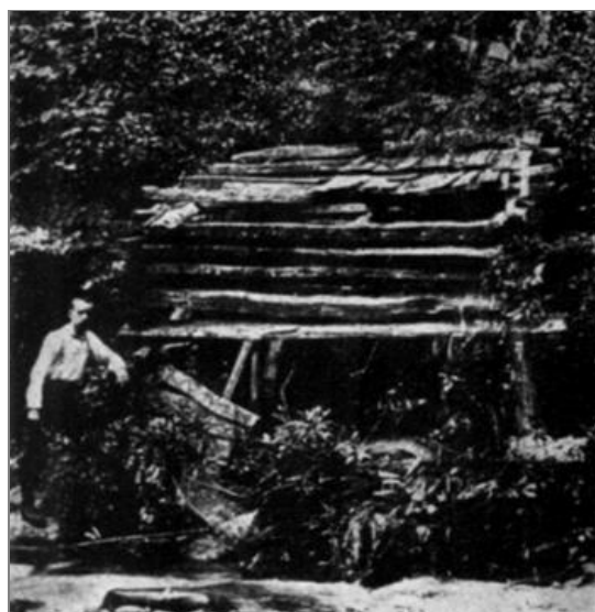
MOONSHINE MILL—SIDE VIEW

The trails that lead hither are blind and rough. Behind the mill rises an almost precipitous mountain-side. Much of the corn is brought in on men’s backs at the dead of night.