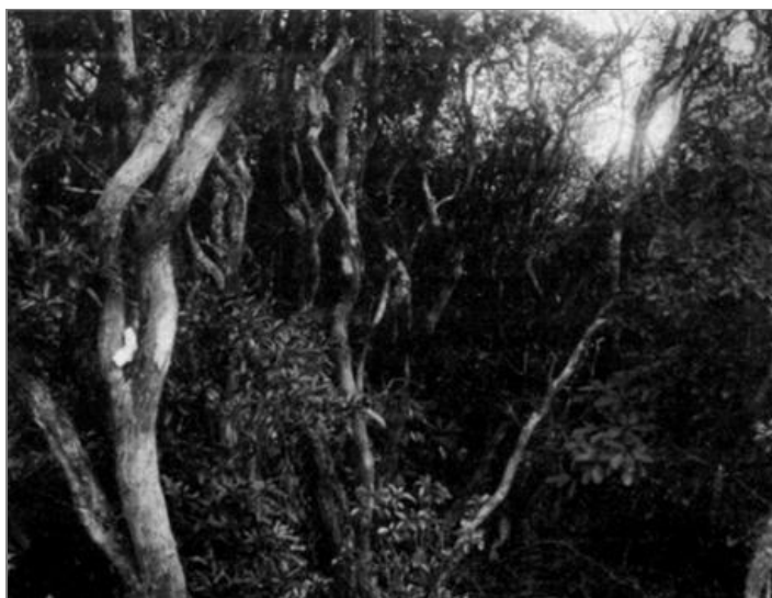
The Bears' Home—Laurel and Rhododendron

"Then," said he, "if I had missed your cabin I would have starved to death, for I depended on finding a house to the eastward, and would have followed the trail till I dropped. I have been out in the laurel thickets, now, three days and two nights; so nothing could have induced me to leave this trail, once I found it, or until I could see out to a house on one side or other of the mountain."