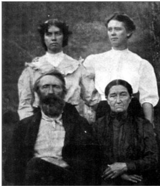
A Family of Pioneers in the Twentieth Century

Foreigner, outlander, it is all one; we are “different,” we are “quar,” to the mountaineer. He knows he is an American; but his conception of the metes and bounds of America is vague to the vanishing point. As for countries over-sea—well, when a celebrated Nebraskan returned from his trip around the globe, one of my backwoods neighbors proudly informed me: “I see they give Bryan a lot of receptions when he kem back from the other world.”