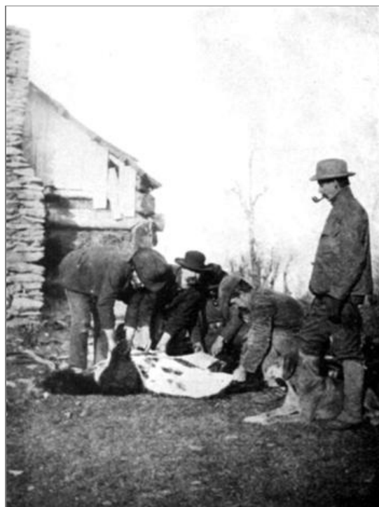
Skinning a frozen bear