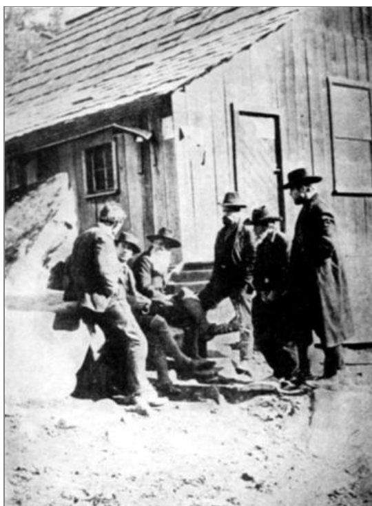
At the Post-Office

Trade was mostly by barter, in which 'coon skins and ginseng had the same rank as in the days of Davy Crockett and Daniel Boone. Long credits were given on anticipated crops; but the risks were great and the market limited by local consumption, as it did not pay to haul bulky commodities to the railroad. Hence it was self-preservation for the storekeepers to carry only a slender stock of essentials and take pains to have little left through unproductive times.