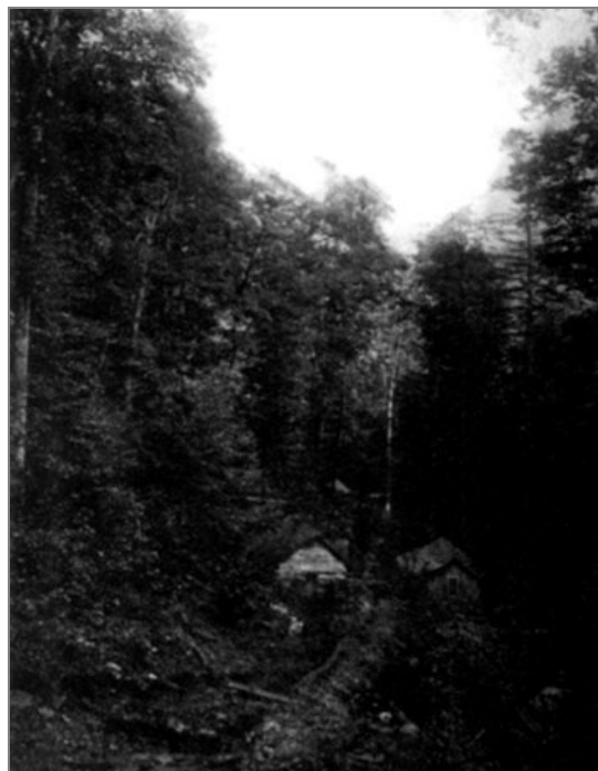
The old copper mine