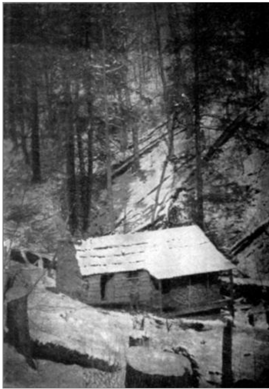
Cabin on the Little Fork of Sugar Fork of Hazel Creek in which the author lived alone for three years