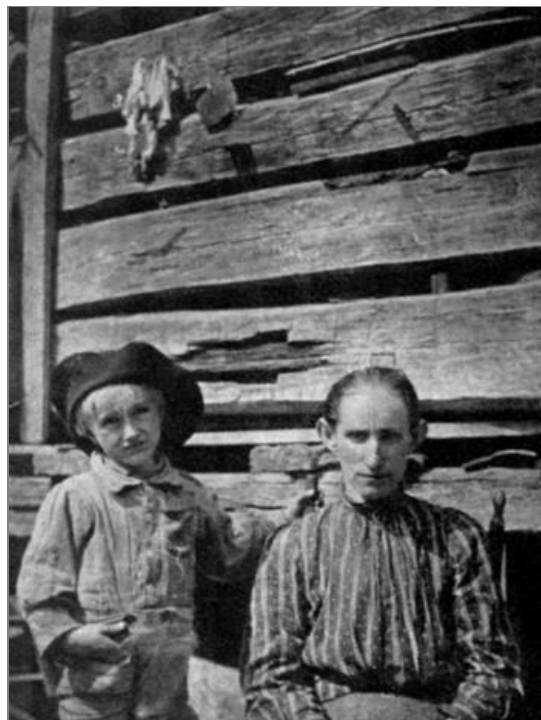
"At thirty a mountain woman is apt to have a worn and faded look"