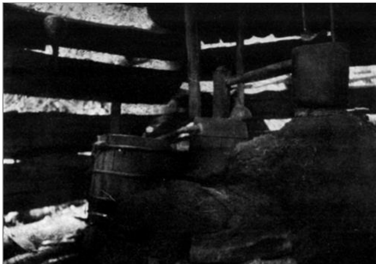
Moonshine Still in Full Operation

It takes two or three men to run a still. It is possible for one man to do the work, on so small a scale as is usually practiced, but it would be a hard task for him; then, too, there are few mountaineers who could individually furnish the capital, small though it be. So three men, let us say, will "chip in" five or ten dollars apiece, and purchase a second-hand still, if such is procurable, otherwise a new one, and that is all the apparatus they have to pay money for. If they should be too poor even to go to this expense, they will make a retort by inverting a half-barrel or an old wooden churn over a soap-kettle, and then all they have to buy is a piece of copper tubing for the worm.