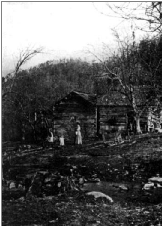
Many of the homes have but one window

And here is another significant fact: as regards personal property I do not know any race in the world that is more honest than our backwoodsmen of the southern mountains. As soon as you leave the railroad you enter a land where sneak-thieves are rare and burglars almost unheard of. In my own county and all those adjoining it there has been only one case of highway robbery and only one of murder for money, so far as I can learn, in the past forty years.