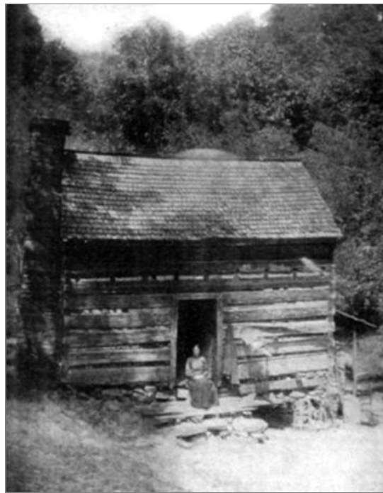
An Average Mountain Cabin

Some of the early settlers, who had first choice of land, took pains in building their houses, squaring the logs like bridge timbers, joining them closely, smoothing their puncheons with an adze almost as truly as if they were planed, and using mortar instead of clay in laying chimney and hearth. But such houses nowadays are rare. If a man can afford so much effort as all that he will build a framed dwelling. If not, he will content himself with such a cabin as I have described. If he prospers he may add a duplicate of it alongside and cover the whole with one roof, leaving a ten or twelve-foot entry between.