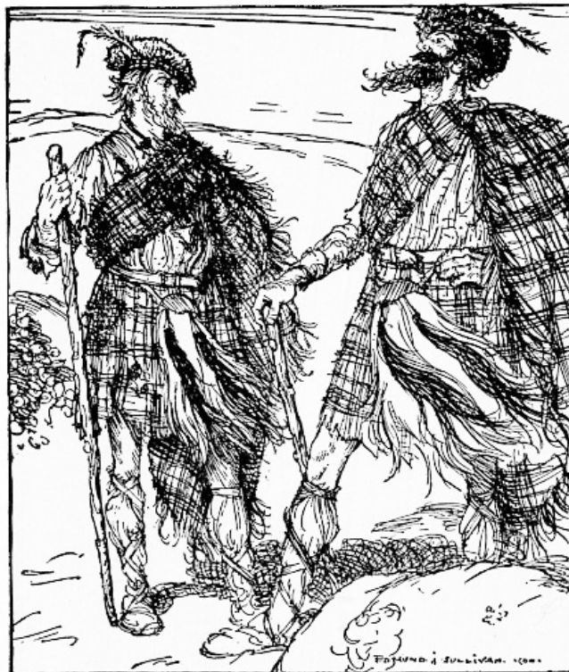
“THE TWO WENT OUTSIDE AND TOOK THE ROAD BY WHICH THEY HAD COME.”

The young men awoke somewhat late next day with heads reasonably clear, a very practical testimonial to the soundness of their previous night's vintage.