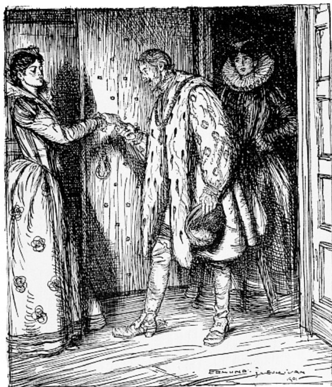
"MY FAIR ANTAGONIST, I BID YOU GOOD-NIGHT."