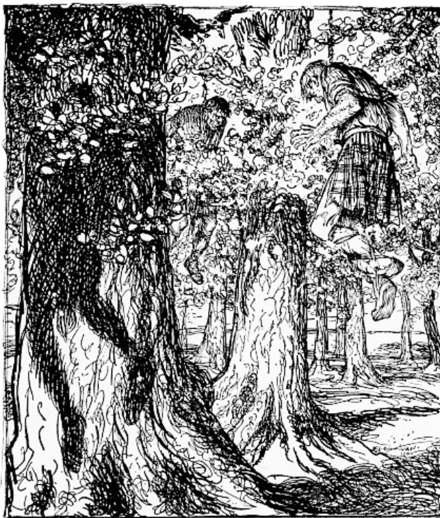
"THE FORTY-ONE TREES BORE THEIR BURDEN."

Armstrong gasped, and a greenish pallor overspread his face.