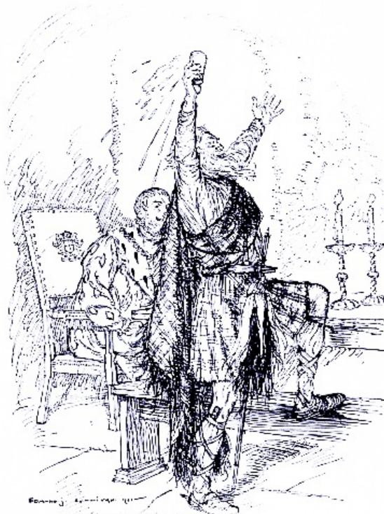
“AT LAST MACNAB SPRANG TO HIS FEET, HOLDING ALOFT HIS BRIMMING FLAGON.”

“You must all come to Loch Tay,” cried the chief, “and I will show you a banqueting hall in honour of James the Fifth, such as you have never before seen.” Then to the horror of the