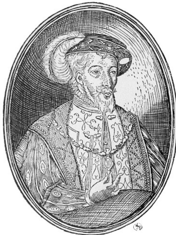
JACOBUS, V, REX, SCOTORUM. THE PRINCE OF GOOD FELLOWS