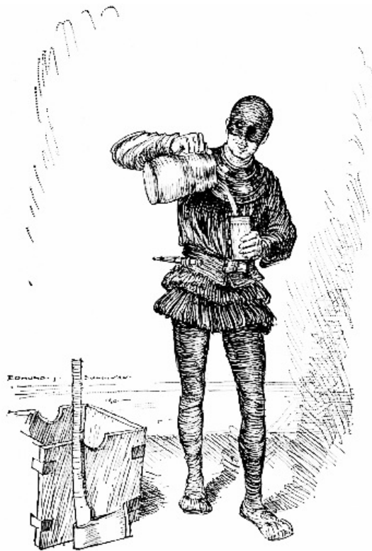
"HEADSMAN: DO YOUR DUTY."

"Indeed," said the cobbler with an uneasy laugh, "I shall be the first to admit it."