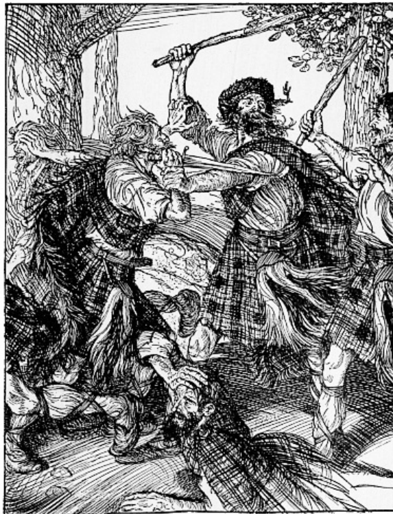
"FIVE STALWART RUFFIANS FELL UPON HIM."

"That will be interesting," replied the king. "Good-day to you."