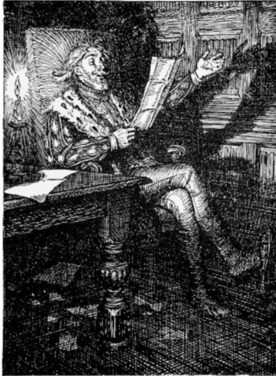
"THE KING HAD COMPOSED A POEM IN THIRTEEN STANZAS, ENTITLED 'THE BEGGAR MAN.'"

Literary ambition has before now led men into difficulties. The king had completed a poem in thirteen stanzas entitled "The Beggar Man," and the prime requisite of a completed poem is an audience to listen to it. In spite of the fact that he wrote poetry, the king was a sensible person, and he knew that if he read his verses to the court, the members thereof were not the persons to criticise adequately the merits of such a composition; for you cannot expect a high noble, who, if he ever notices a beggar, merely does so to throw a curse at him, or lay the flat of his sword over his shoulders, to appreciate an epic which celebrates the free life led by a mendicant.