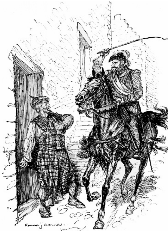
"OUT OF THE WAY, FELLOW!"

"Out of the way, fellow!" cried the rider, and, barely giving him time to obey, the horseman struck at the pedestrian fiercely with his whip. The young man's agility saved him. Nimbly he placed his back against the wall, thus avoiding the horse's hoof and the rider's lash. The victim's right hand made a swift motion to his left hip, but finding no weapon of defence there, the arm fell back to his side again, and he laughed quietly to himself. The next motion of his hand was more in accordance with his station, for it removed his bonnet, and he stood uncovered until the proud cavalcade passed him.