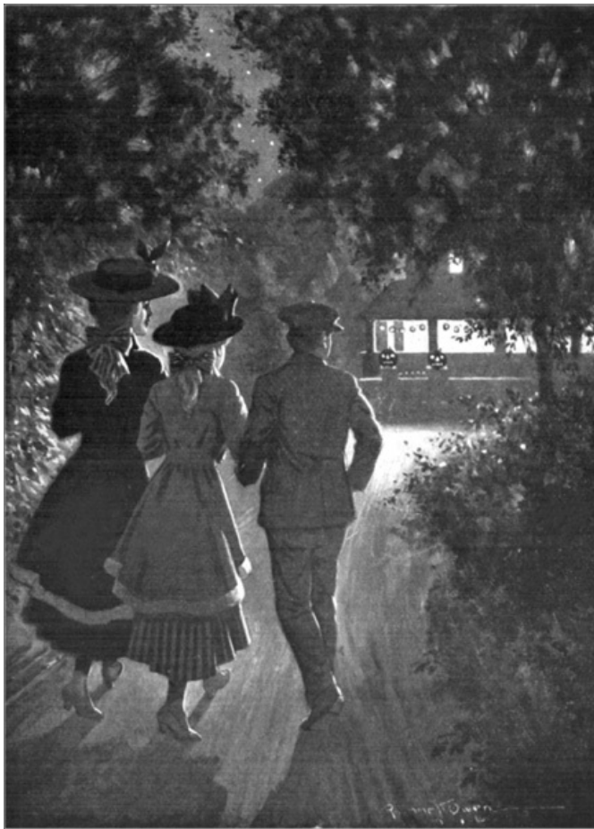
They saw two huge pumpkin lanterns grinning a welcome from the gateposts. Page 173