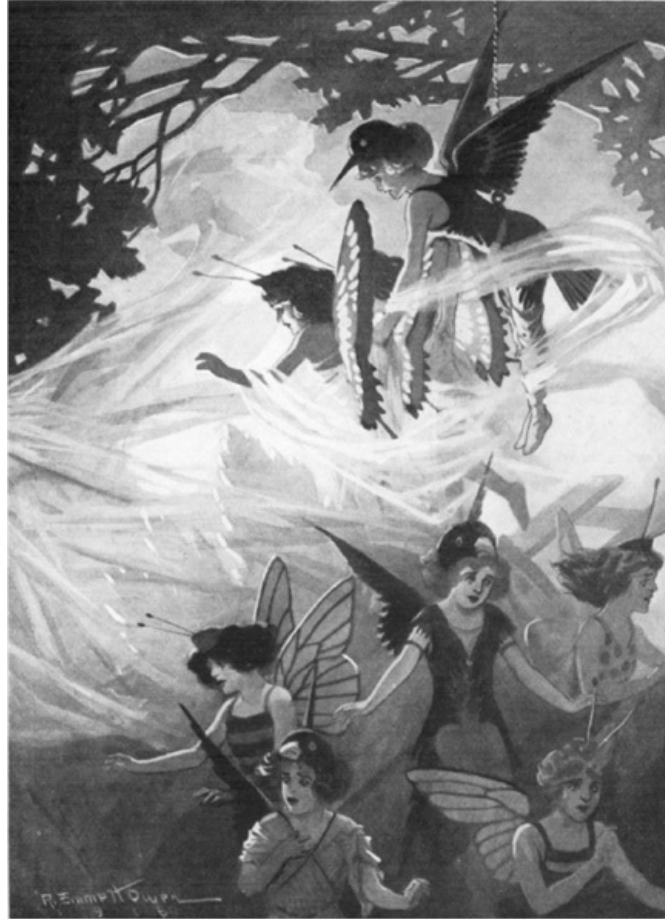
The scaffolding pulled apart slowly, falling forward through the drop. Page 238

The Corner House girl, frightened as she was, miraculously preserved her presence of mind. As she had already done before during the rehearsals, she seized the sashes of her two smaller schoolmates at the first alarm. Their feet slipped from the foothold, but Tess held them.