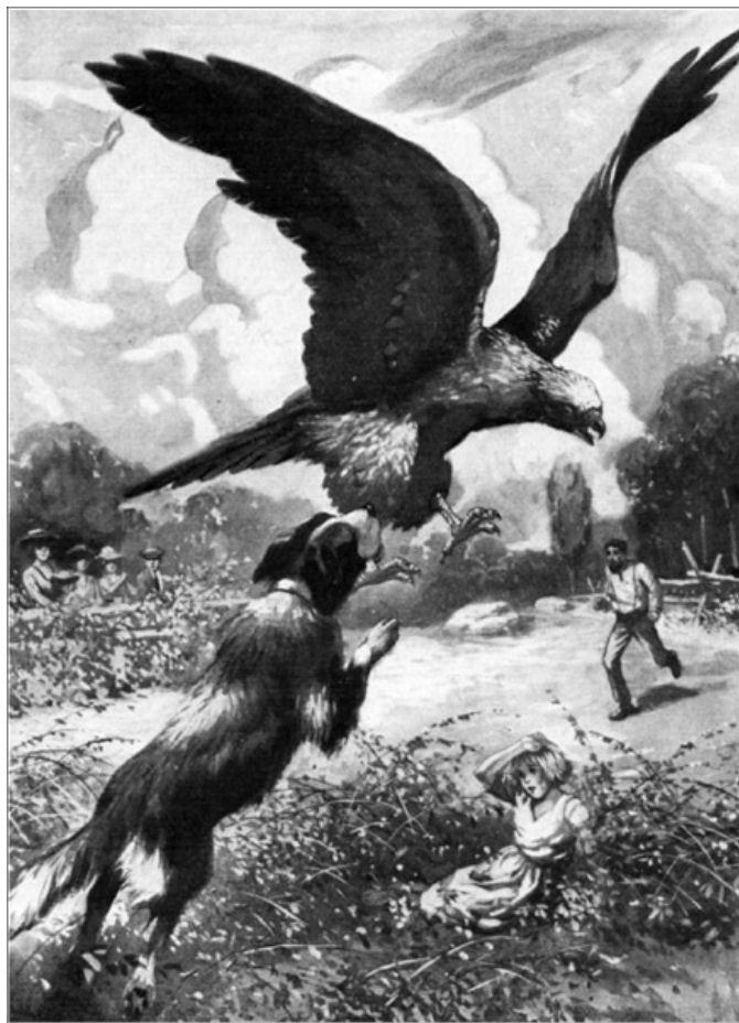
At the moment the eagle dropped with spread talons, the big dog leaped. Page 103