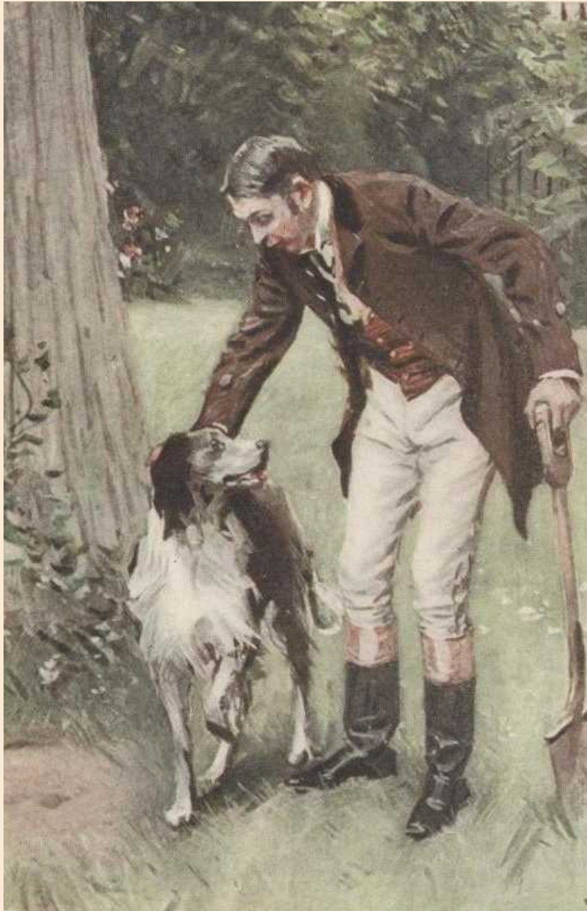
"POOR LITTLE DOGGIE, YOU SAVED HIS CHILD"

Soon the master stopped discussing a moment, and rang in the footman, and said, "Bury it in the far corner of the garden," and then went on with the discussion, and I trotted after the footman, very happy and grateful, for I knew the puppy was out of its pain now, because it was asleep. We went far down the garden to the farthest end, where the children and the nurse and the puppy and I used to play in the summer in the shade of a great elm, and there the footman dug a hole, and I saw he was going to plant the puppy, and I was glad, because it would grow and come up a fine handsome dog, like Robin Adair, and be a beautiful surprise for the family when they came home; so I tried to help him dig, but my lame leg was no good, being stiff, you know, and you have to have two, or it is no use. When the footman had finished and covered little Robin up, he patted my head, and there were tears in his eyes, and he said: "Poor little doggie, you saved HIS child!"