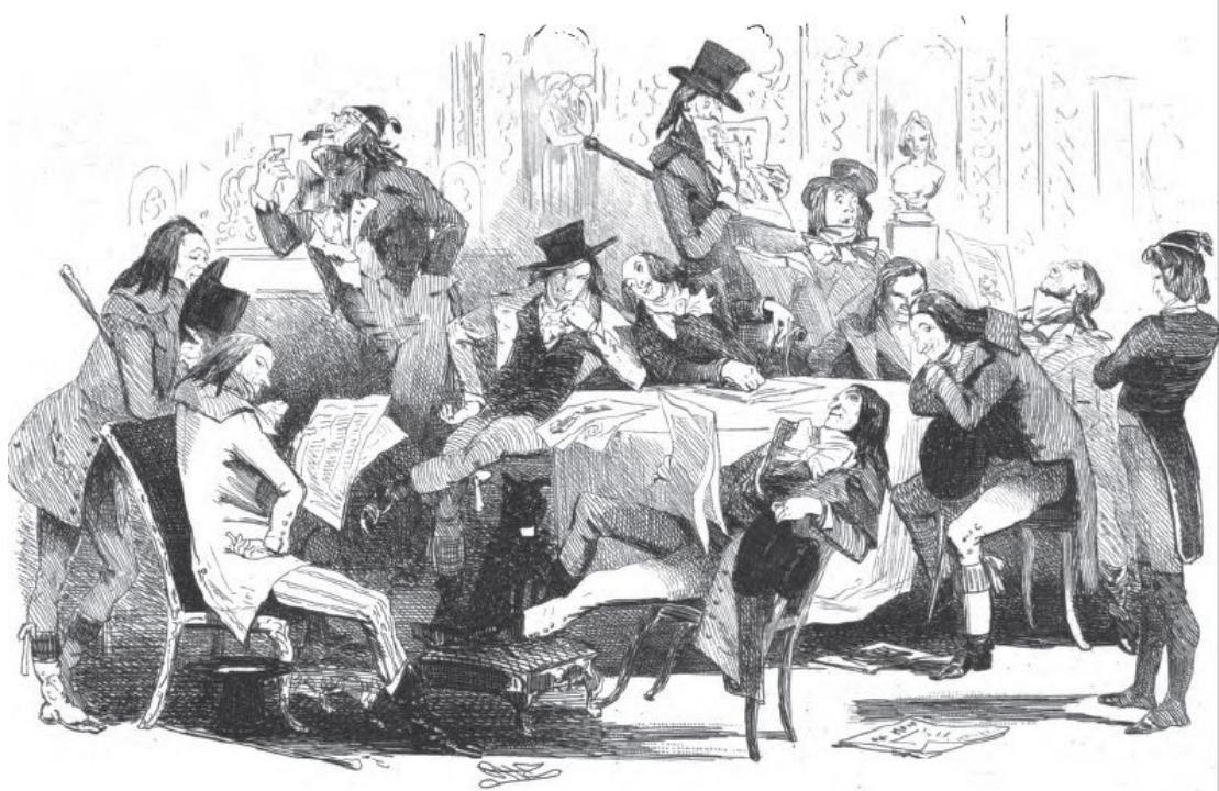
Monsieur Crillac's Salon

A short and not very gracious nod concluded the audience; and I took my leave not the less abashed that I could mark a kind of half smile on most of the faces about me as I withdrew from the crowd,—scarcely in the street, however, when my heart felt light and my step elastic. I was a sous-lieutenant of hussars; and if I did my duty, what cared I for the smiles and frowns of my colonel? and had not the General Bonaparte himself told me that "no grade was too high for the brave man who did so?"