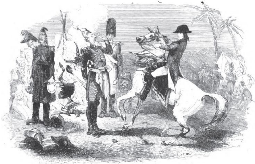
The 'Petit Caporal' caught indulging in delicacies.

"'It is not a sheep, Général,' said I, stepping forward, and trying to hide the long ladle I was basting with.