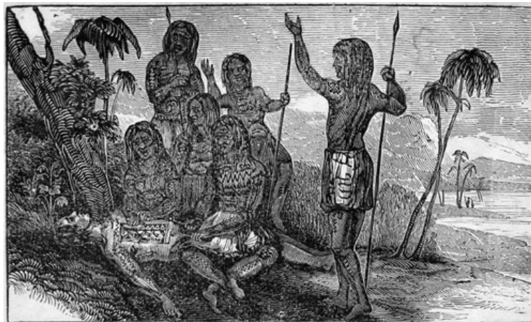
DESCRIPTION OF THE PROCESS OF TATTOOING.