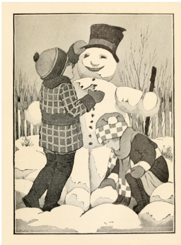
HE WAS ALTOGETHER A VERY STYLISH SNOW MAN.