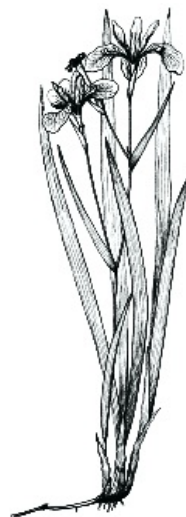
Fig. 3.— Iris tenuis .

T HIS pretty delicate species of Iris, Fig. 3, is a native of the Cascade Mountains of Northern Oregon. Its long branching rootstocks are scarcely more than a line in thickness, sending up sterile leafy shoots and slender stems about a foot high. The leaves are thin and pale green, rather taller than the stems, sword-shaped and half an inch broad or more. The leaves of the stem are bract-like and distant, the upper one or two subtending slender peduncles. The spathes are short, very thin and scarious, and enclose the bases of their rather small solitary flowers, which are "white, lightly striped and blotched with yellow and purple." The sepals and petals are oblong-spatulate, from a short tube, the sepals spreading, the shorter petals erect and notched.