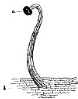
Fig. 2.—Hair from Petal of Chrysanthemum, much enlarged. a —resin drop. b —epidermis of petal with wavy cells.

The flower is of pure white, with the firm, long and broad petals strongly incurved at the extremities. Upon the back or outer surface of this incurved portion will be found, in the form of quite prominent hairs, the peculiarity which makes this variety unique.