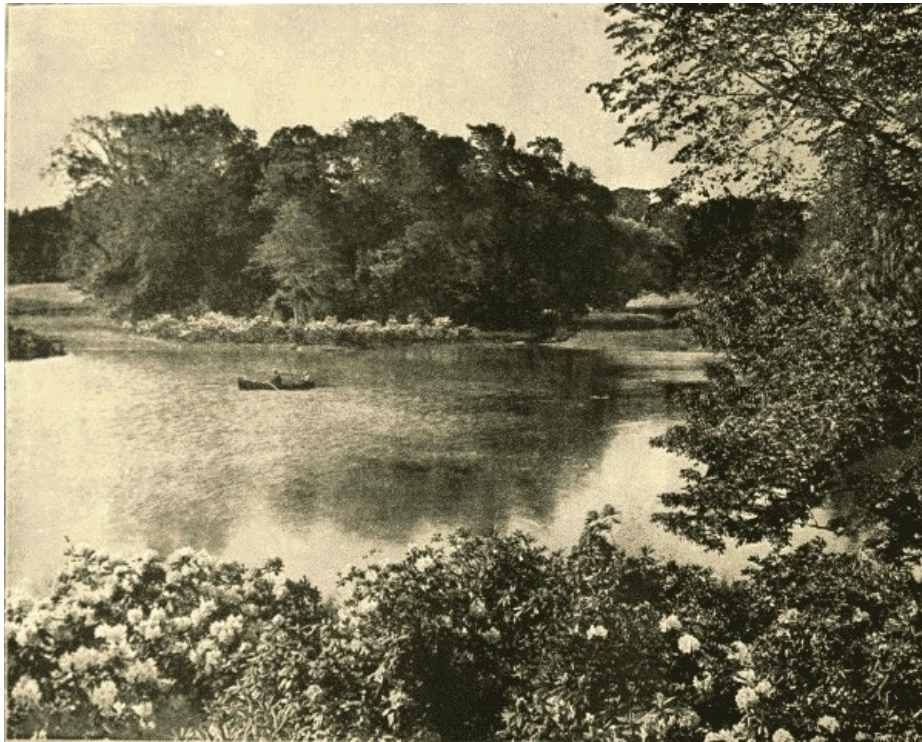
A Piece of Artificial Water.