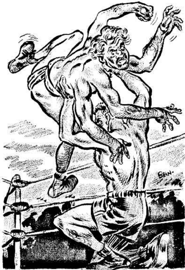
It looked as though Hoiman's Bum would be remembered on Mars.

She put in the order, then brought me a set-up. I let my eyes go over her, real careful, for maybe the thousandth time. No doubt of it—the lassie had a classy chassis. If she just wouldn't yak so damn much.