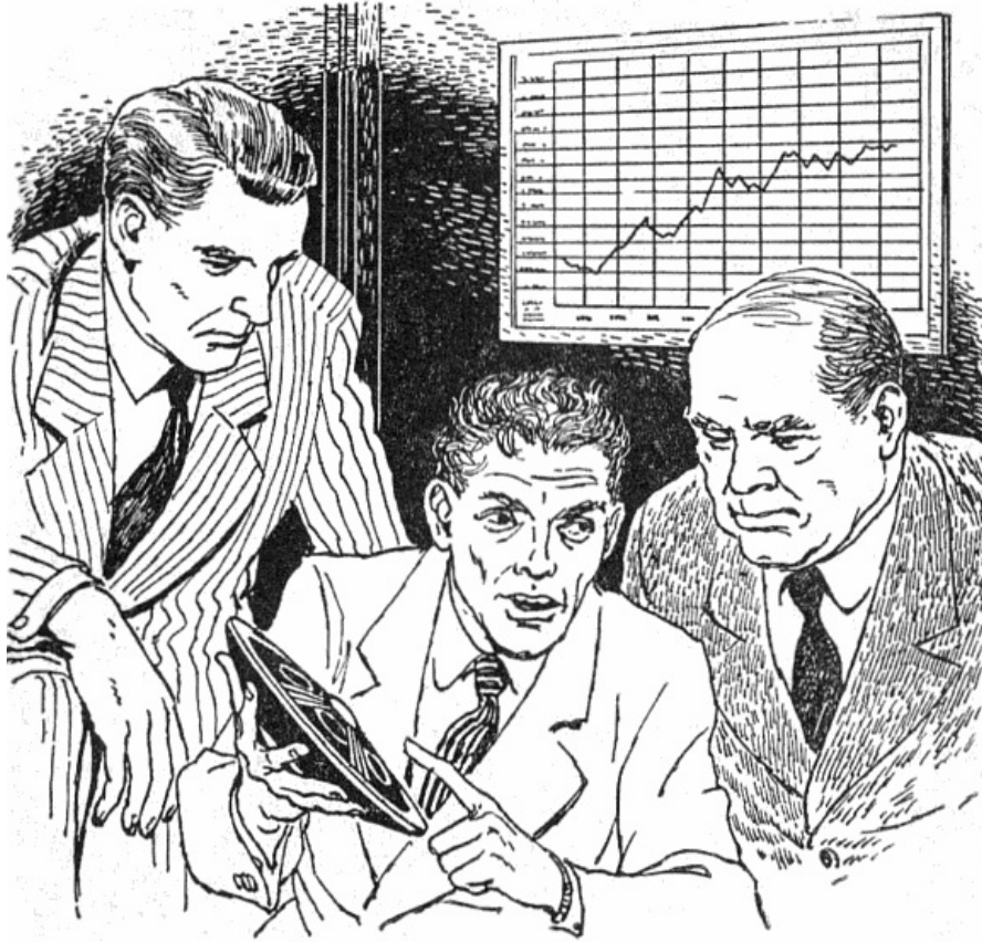
Illustrated by Ed Emsh