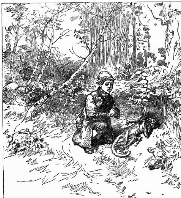
"HOW I LOVE YOU, MR. STUBBS!"

As the monkey's groans increased in number but diminished in force Toby ran to the brook, filled his hands with water, and held it to the poor animal's mouth.