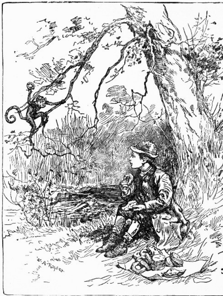
BREAKFAST IN THE WOODS. See p. 235.