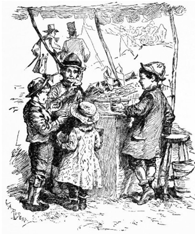
TOBY AND THE LITTLE BOY CUSTOMERS.

"That may all be true, an' I don't dispute it," said Ben; "but you see you didn't stay with your uncle Daniel when you had the chance, an' you did come with the circus. You've told Job you wanted to leave, an' he'll be watchin' you all the time to see that you don't give him the slip. Now, what's the consequence? Why, you can't get away for a while, anyhow, an' you'd better try to amount to something while you are here. Perhaps after you've got so you can ride you may want to stay; an' I'll see to it that you get all of your wages, except enough to pay Castle for learnin' of you." [Pg 166]