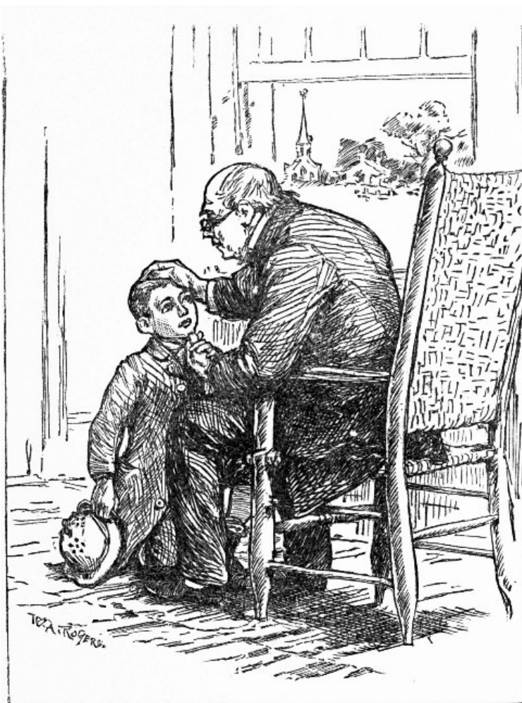
UNCLE DANIEL'S BLESSING.

And in Uncle Daniel's kindly care we may safely leave Toby Tyler.