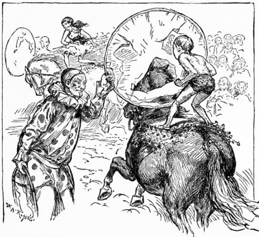
MADemoiselle JEANNETTE AND MONSIEUR AJAX.

"That's because you rode so well and helped me so much," she said, as she saw Toby's cheeks growing a fiery red; and then she turned to those who were waiting to greet her.