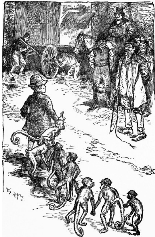
BRINGING BACK THE RUNAWAYS.

"Job Lord's new boy," said some one in the crowd. [Pg 99]