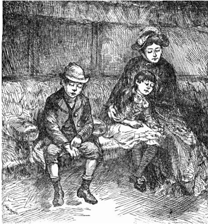
TOBY IN THE "WOMEN'S WAGON."

This praise seemed to please the young lady, and in a short time the two became very good friends, even if Toby did not occupy a more exalted position than that of candy-seller. She had learned from him all about the accident to the monkey-cage, and about Mr. Stubbs, and in return had told him that her name was Ella Mason, though on the bills she was called "Mademoiselle Jeannette."