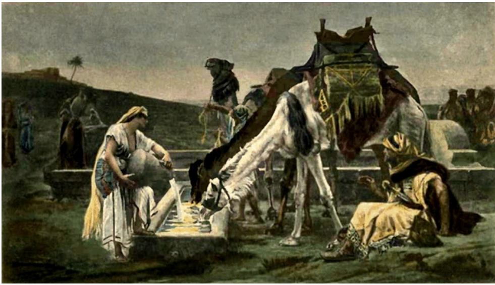
REBEKAH AND ISAAC'S AGENT, ELIEZER After the painting by A. Cabanel

Probably no feature in the social life of a people is of so universal an interest as its marriage customs, and there is no courtship, either ancient or modern, which has more enkindled the imagination and awakened the interest of men than that between Isaac and Rebekah..... It is a truly picturesque and even romantic story, which never loses its charm; and Rebekah, whether at the well or in her household, will always present a unique picture of womanly grace and beauty.