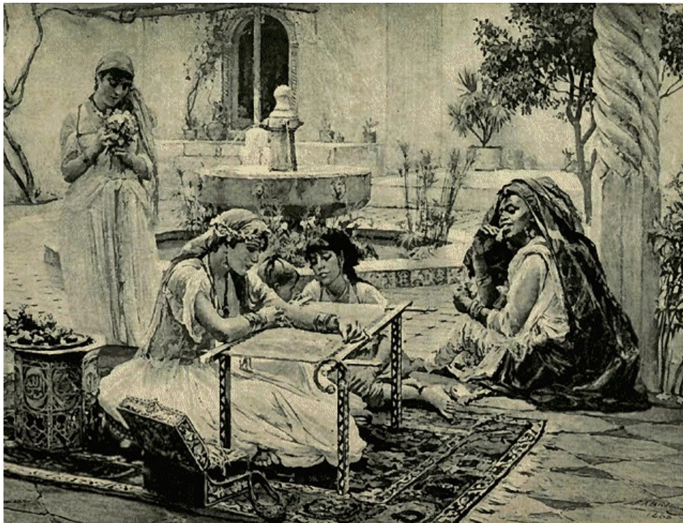
AN ORIENTAL WOMAN'S PASTIME After the painting by Frederick A. Bridgman

The Arab girls, as a rule, grow up in ignorance. It is not thought worth while to educate the daughter; and, indeed, it is regarded by many as destructive of the best order of society to give woman any opportunity which may cause her to desire to usurp the power which heaven has placed in the hands of men. There is, accordingly, little enlightened housekeeping, little to stimulate a woman's mind, little opportunity here for "the hand that rocks the cradle" to move the world. Sons grow up with little respect for their mothers, for there is nothing to make it otherwise. The husband, should he wish to divorce himself from his wife, simply orders her to leave his house, and his will is law. Civil government takes no cognizance of matrimonial affairs, and religious authority allows the husband to do much as he may see fit in his own house.