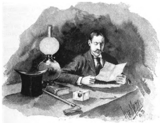
"BUT HE HAD ALREADY TAKEN IT UP AND BROKEN THE SEAL."

He too went to his room. The lamp was burning on the round table and a letter lay beneath it. Ah, true! the long-lost letter! He took it up abstractedly--it was in Wolff's handwriting. He put it down again; what could he want? Some business of course. Should he spoil this happy hour with unpleasant, perhaps care-bringing news? No, let the letter wait--till--but he had already taken it up and broken the seal.