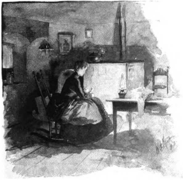
"SHE SAT DOWN BEFORE THE STOVE AND BEGAN TO TAKE OFF THE LITTLE RED FLANNEL FROCK."