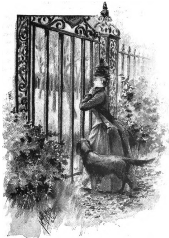
"SHE LEANED WITH HER UNGLOVED HANDS AGAINST THE MISTY BARS OF THE GATE."

The first rays of the morning sun were resting like reddish gold on the tips of the forest trees which crowded close up to the white villa-like house. Magnificent oaks, like giant sentinels, stood on the lawn before the massive wall. A narrow, little-used path wound in between them, such as are to be found in places not intended to be walked upon. The great trees gave out little shade as yet, the oak-tree is late in getting its leaves; those that had already appeared looked young and shrivelled against the knotted branches, and formed a delightful contrast to the dark green of the evergreens on the other side of the garden wall, mingled with the tender misty foliage of the birches. "Waldruhe" lay as if dreaming in this early stillness. The green jalousies were all closed, like sleepy eyelids; on the roof a row of bright-feathered pigeons were sunning themselves. The lawn before the house was like a wilderness, the grass-grown paths scarcely distinguishable, which led from the great iron gate to the veranda steps. From a side-building a little smoke rose up to the blue sky, and a cat sat crouched on the wooden bench beside the hall-door. There was no sound except the joyful trills of the larks as they soared out of sight in the blue sky.