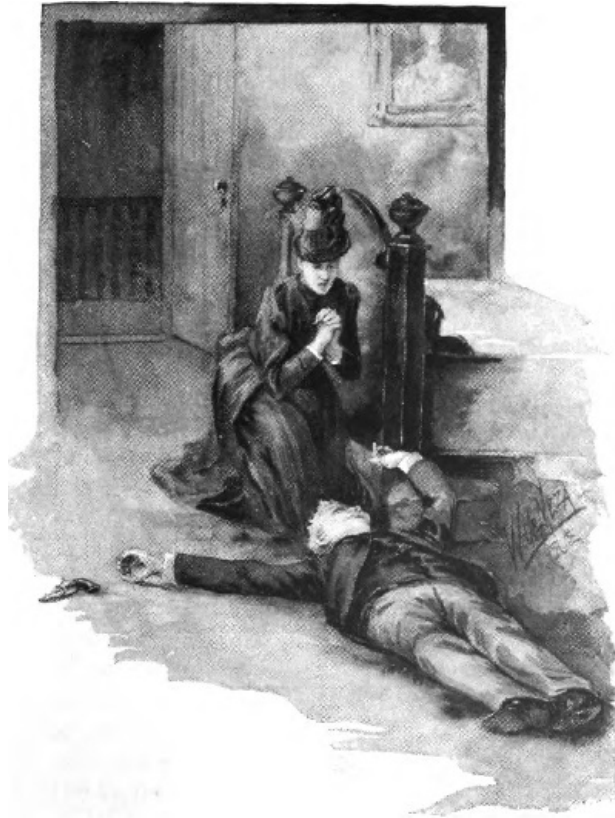
"HE WAS UP STAIRS--YES--BUT HE WAS DEAD."

"And I found him, Frank. He built 'Waldruhe' when I was but a child, and he used to go and stay there for weeks together. It is so hard to talk of it--he was not happy, Frank. Ah, we will not dwell on it. Mamma did not understand him, and it was the day after Christmas and I knew they had had a dispute; that is not the right word for it either, for papa never contradicted her, and he bore so patiently all her crying and complaining. After awhile I heard the carriage drive away. It was in the morning--and I had such a strange feeling of anxiety and dread and after dinner I put on my hat and cloak and ran out of the Bergedorf gate along the high road, on and on till I came to 'Waldruhe.' I was surprised to see that the blinds were shut in his room, but I saw the fresh wheel-tracks in front of the house. The gardener's wife, who lives in a little cottage on the place, said he was upstairs. He was upstairs--yes--but he was dead!"