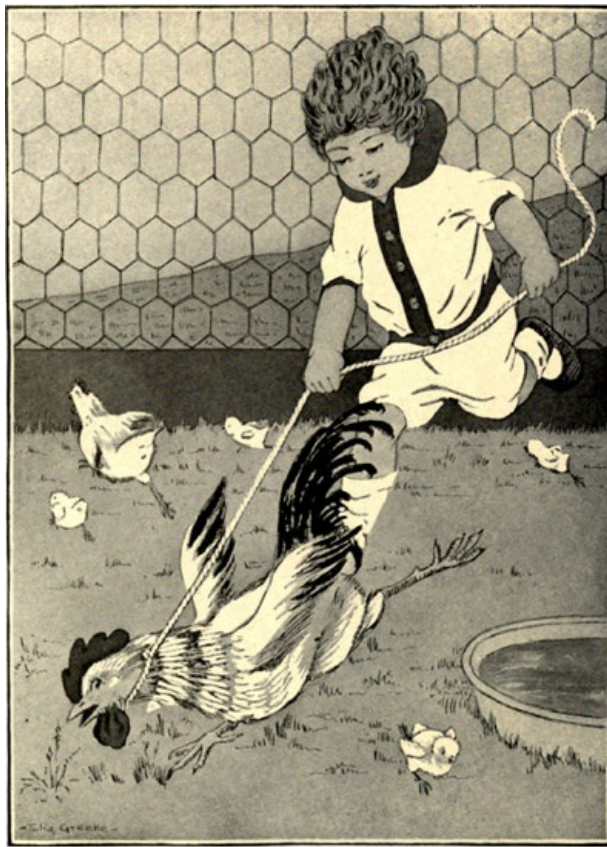
TROUBLE HAD LASSOED THE BIG ROOSTER! The Curlytops at Uncle Frank's Ranch Page 139

"Gid-dap, pony!" cried Baby William, trotting along on his short, fat legs, making-believe, as he often did, that he was riding horseback. "Gid-dap! I lasso a rooster, I did!" [141]