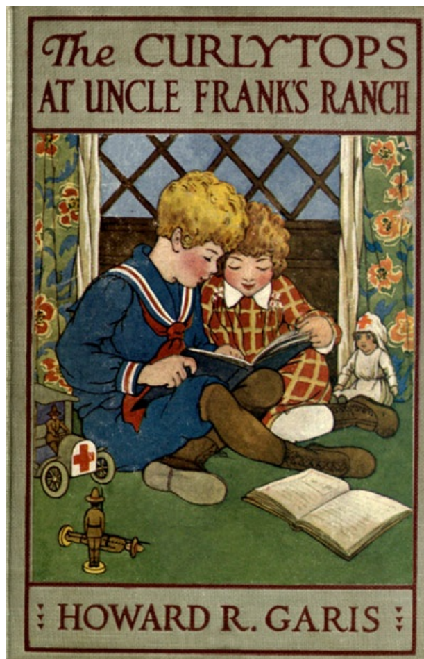
The CURLYTOPS AT UNCLE FRANK'S RANCH

*** START OF THE PROJECT GUTENBERG EBOOK THE CURLYTOPS AT UNCLE FRANK'S RANCH; OR, LITTLE FOLKS ON PONYBACK ***