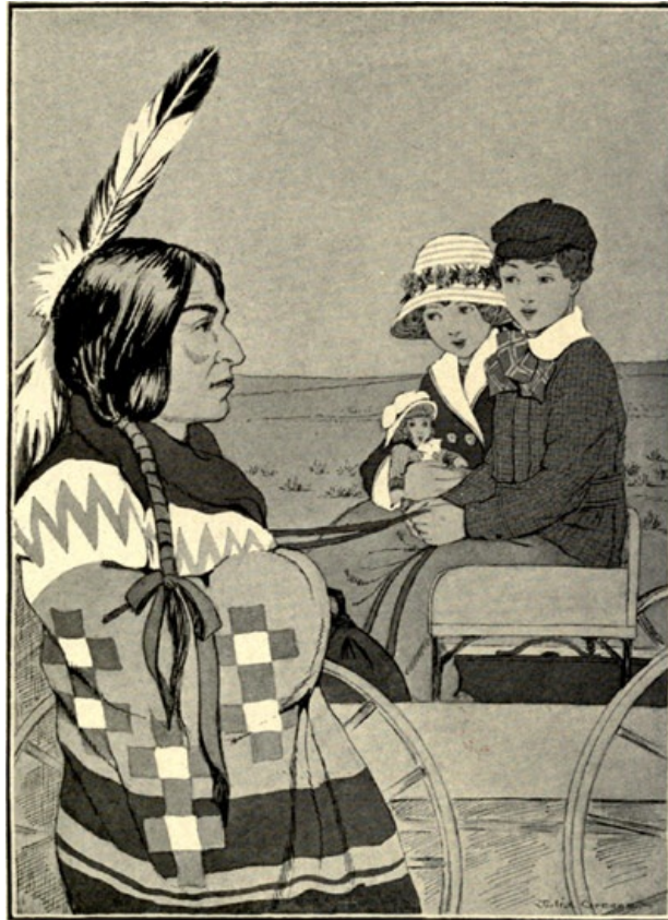
"LOOK, TED! LOOK!" "IT'S AN INDIAN." The Curlytops at Uncle Frank's Ranch Page 65

"Those are my horses and cattle—steers we call the last," explained Uncle Frank. "They are eating grass to get fat. You'll soon be closer to them."