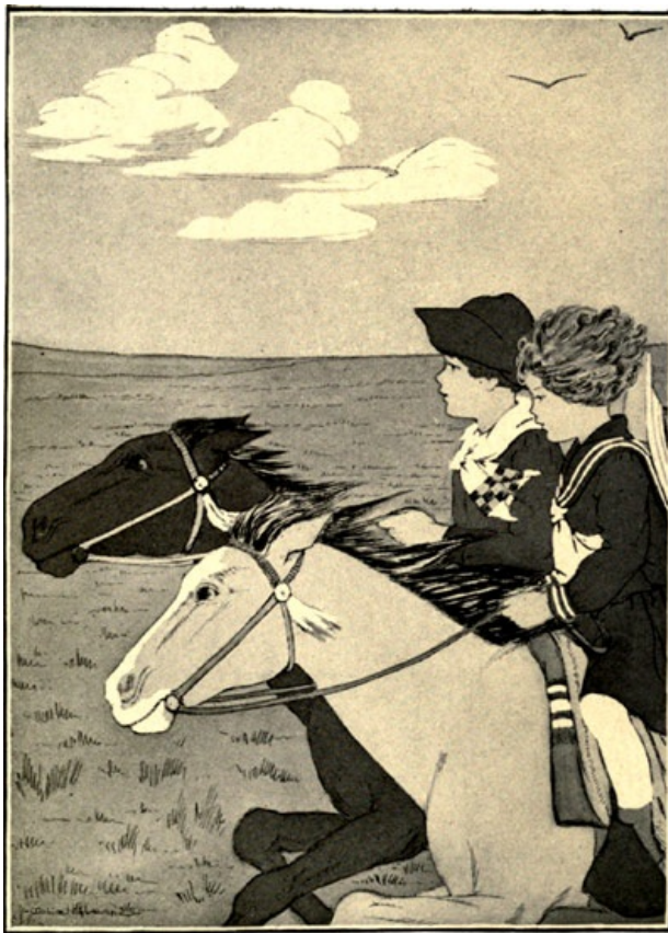
OVER THE PRAIRIES RODE JANET AND TED. The Curlytops at Uncle Frank's Ranch Page 171

"Yes, I'll do that," agreed Janet, and soon, having had one of the cowboys who had been left behind at Ring Rosy Ranch saddle Clipclap and Star Face, the Curlytops started for their ride. [171]